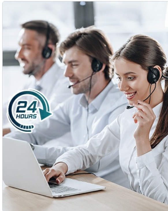
Image: KGHKGH customer service representatives wearing headsets, indicating 24-hour support availability.

For warranty information or technical support, please refer to the contact details provided with your purchase documentation or visit the official KGHKGH website. Keep your proof of purchase for any warranty claims.