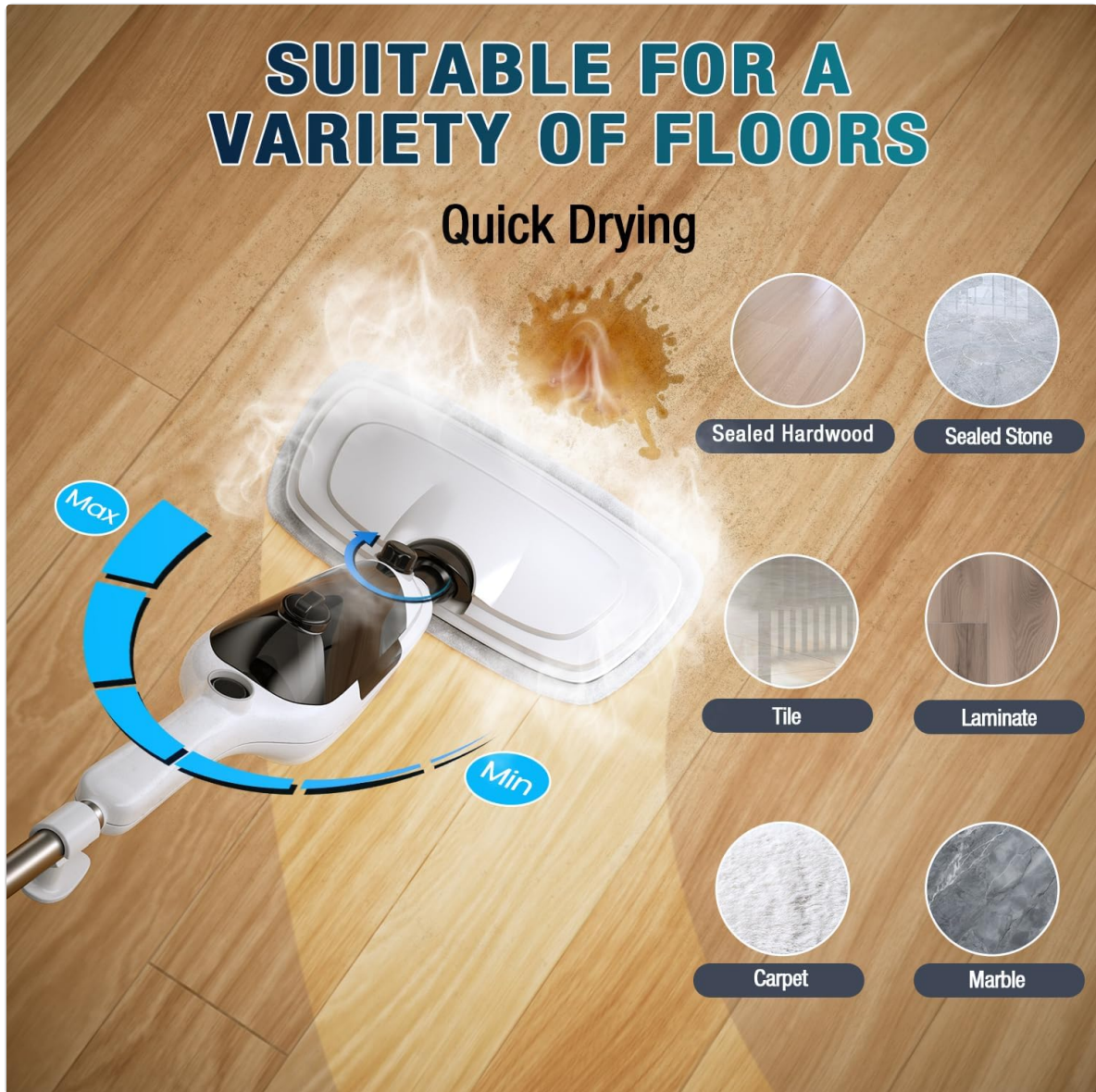
Image: The steam mop effectively cleaning different floor types including sealed hardwood, sealed stone, tile, laminate, carpet, and marble.