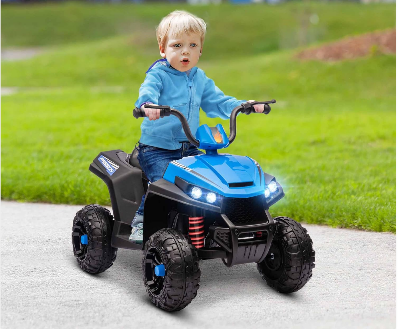
Detailed view of the quad's front, showcasing bright LED headlights and the robust spring suspension system for a smooth ride.