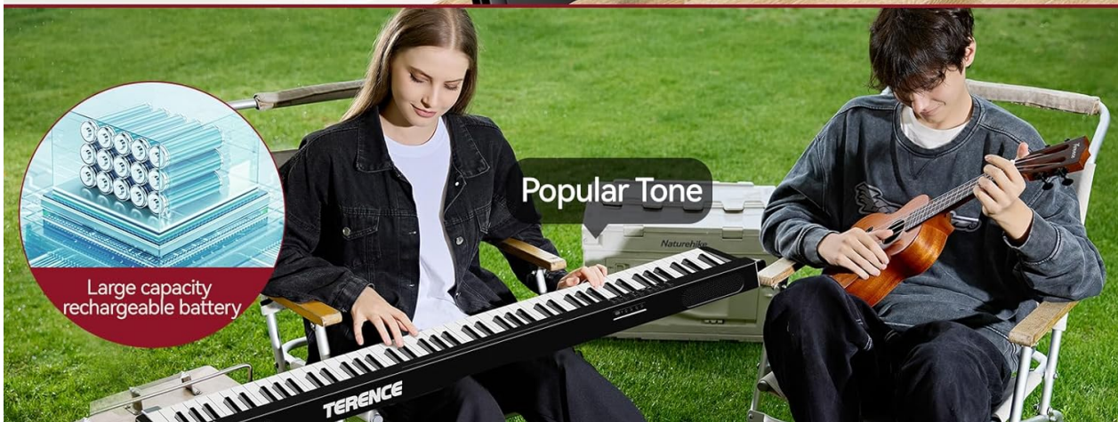
Image: The keyboard connected to its power source for charging.