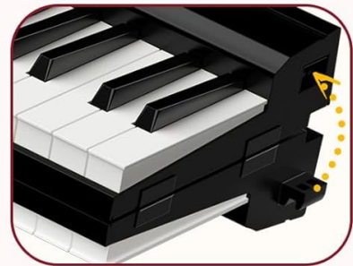
Image: The keyboard being unfolded, showcasing its compact design for portability.

Your browser does not support the video tag.