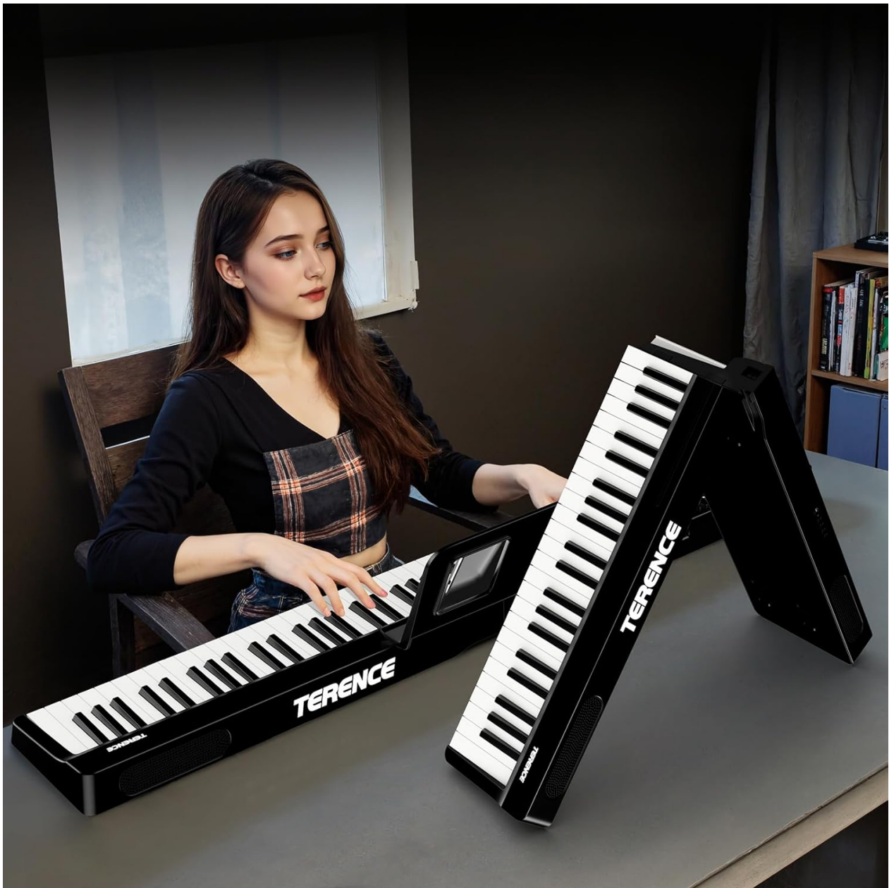
Image: The keyboard in both its folded and unfolded states, emphasizing its portability.