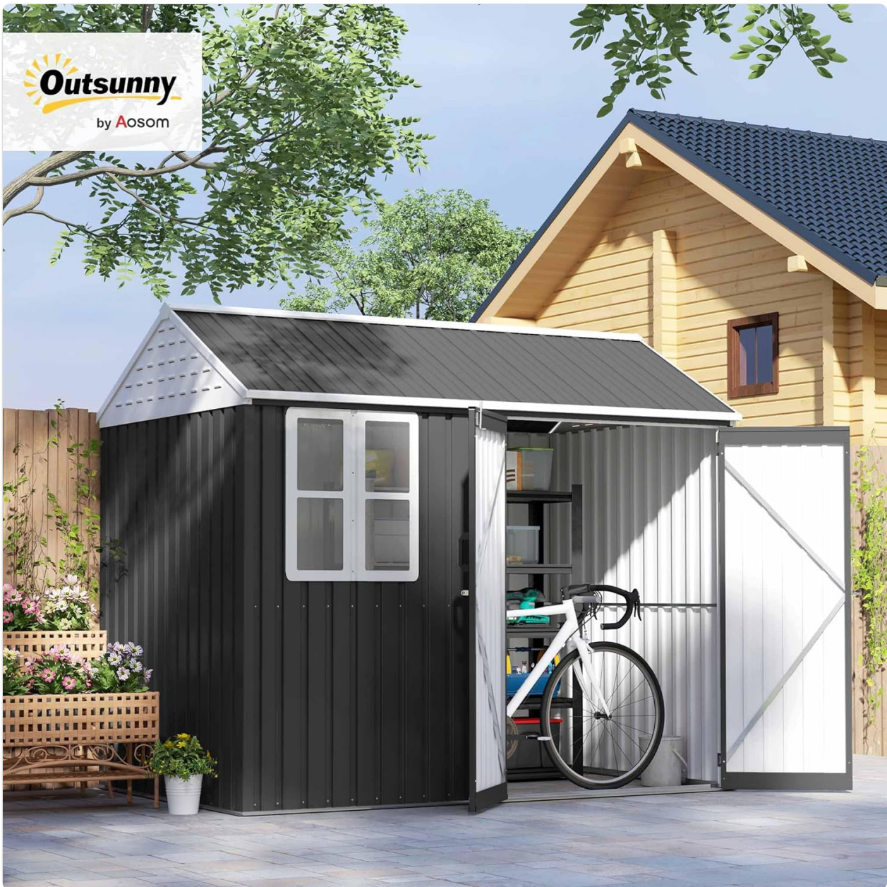
Figure 1.2: An angled view of the shed, highlighting the side window and the wide access provided by the double doors.