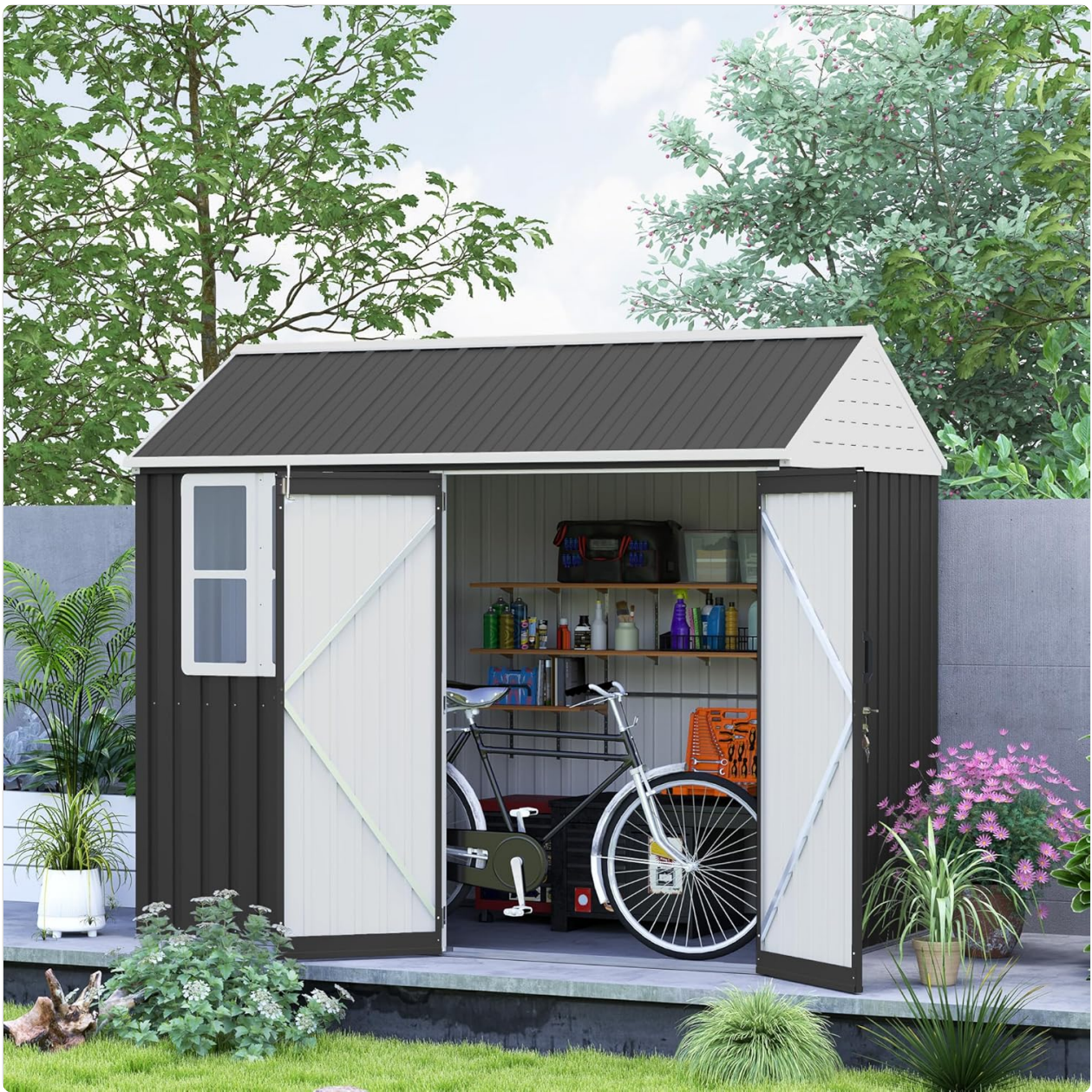
Figure 1.1: The Outsunny 8' x 6' Outdoor Storage Shed with its double doors open, showcasing its spacious interior suitable for various garden tools and equipment.