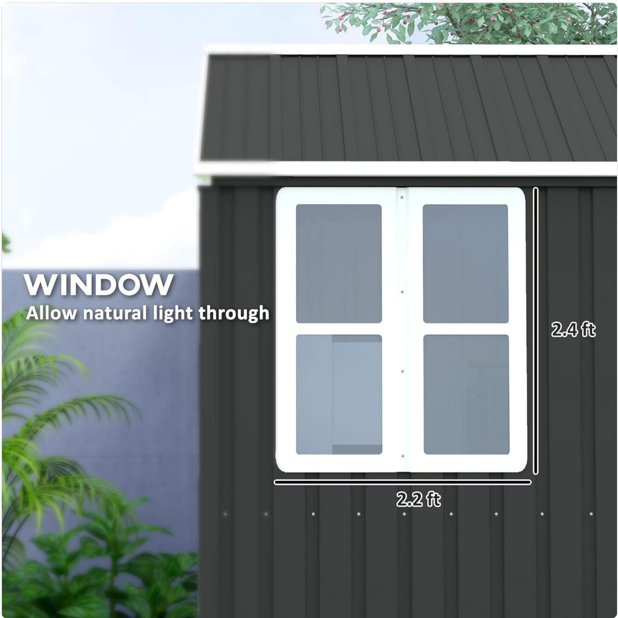
Figure 4.1: The shed's galvanized steel structure provides robust protection against elements.