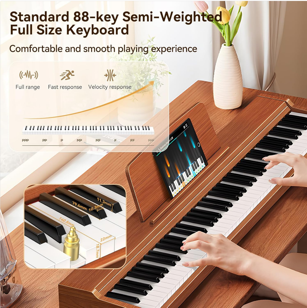
Image: Details of the TERENCE 88-key semi-weighted digital piano keyboard, illustrating key response and dimensions for a comfortable playing experience.