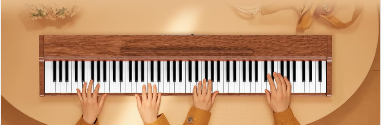
Image: Illustration of the dual-player mode on the TERENCE digital piano, showing two sets of hands playing on the keyboard simultaneously.

Dual-Player Mode splits the keyboard into two 44-key zones. No sound overlap, with independent volume controls for balanced harmony.