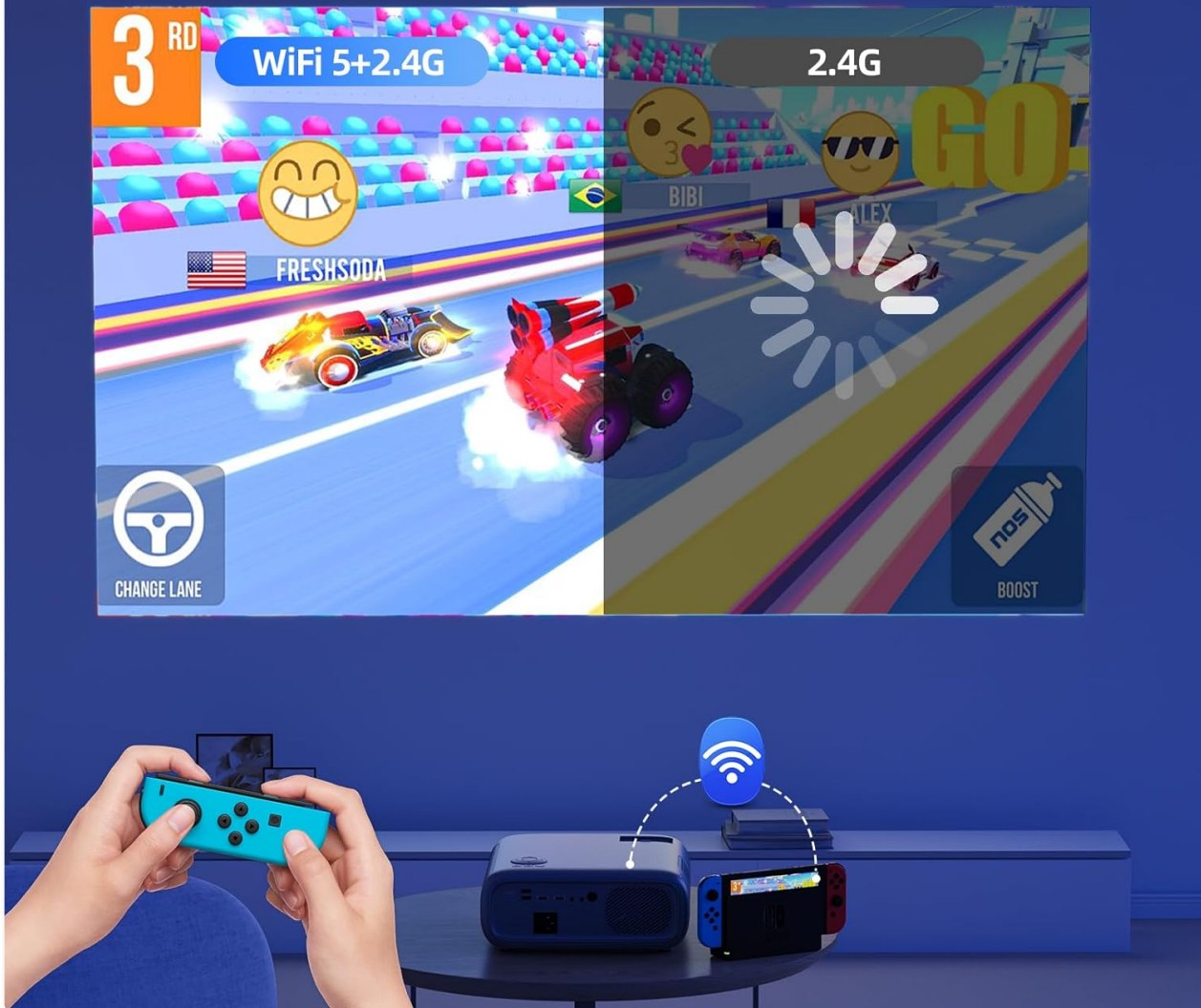
Image: Demonstrating dual-band WiFi connectivity for fast and stable streaming or gaming.

O Wi-Fi de banda dupla 2.4+5 garante uma rede mais rápida e suave, fornecendo som e imagem sincronizados.