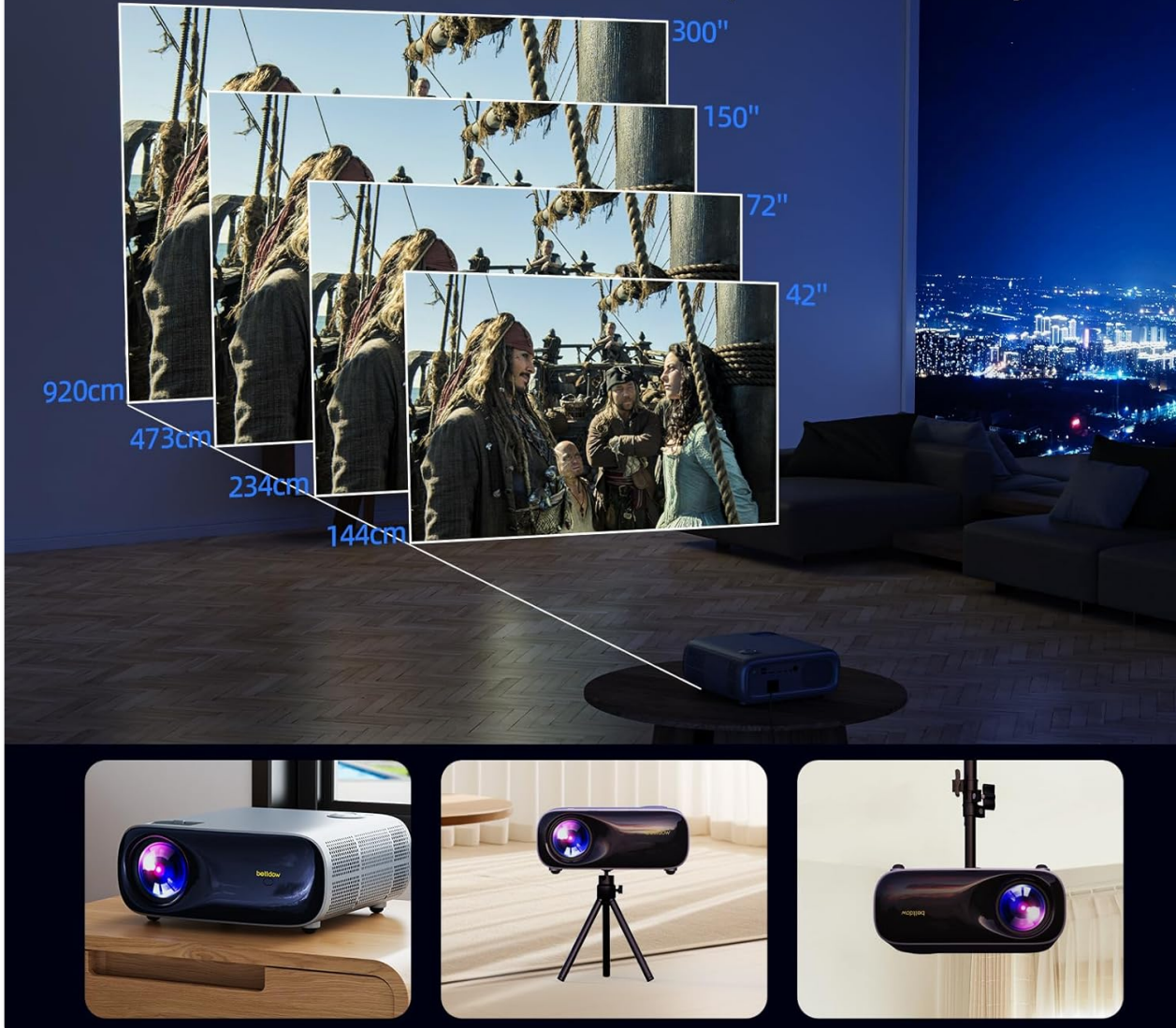
Image: Illustration of flexible projection sizes and diverse mounting possibilities for the projector.

Tamanho máximo de 300", mostrando mais detalhes, reduzindo a tensão ocular e desfrutando de uma melhor experiência de visualização.