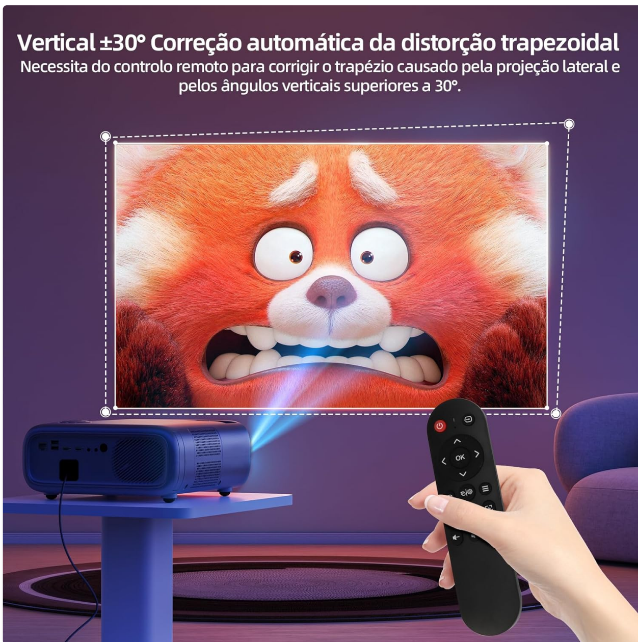
Image: Adjusting vertical keystone correction with the remote control to ensure a properly shaped image.