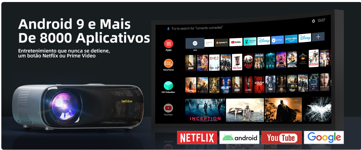
Image: The Android 9.0 interface showing available applications for entertainment and productivity.