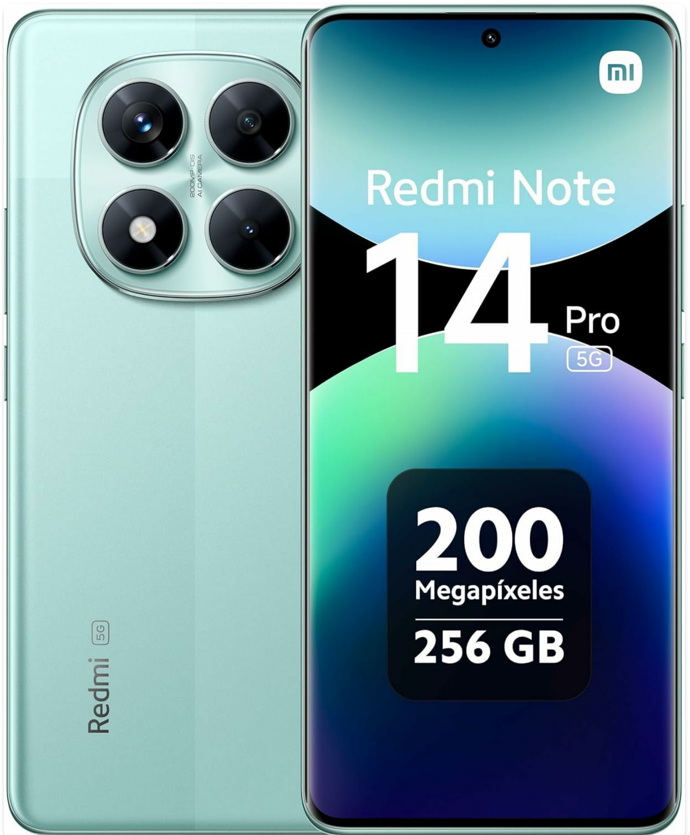
Image 1.1: The Xiaomi Redmi Note 14 Pro 5G in Coral Green, showcasing its sleek design and camera module.