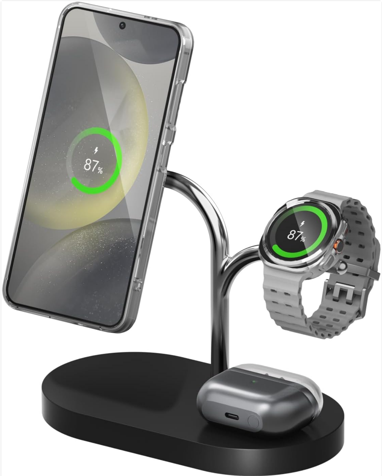
Figure 3: The charging station in use, simultaneously charging a smartphone, smartwatch, and wireless earbuds.