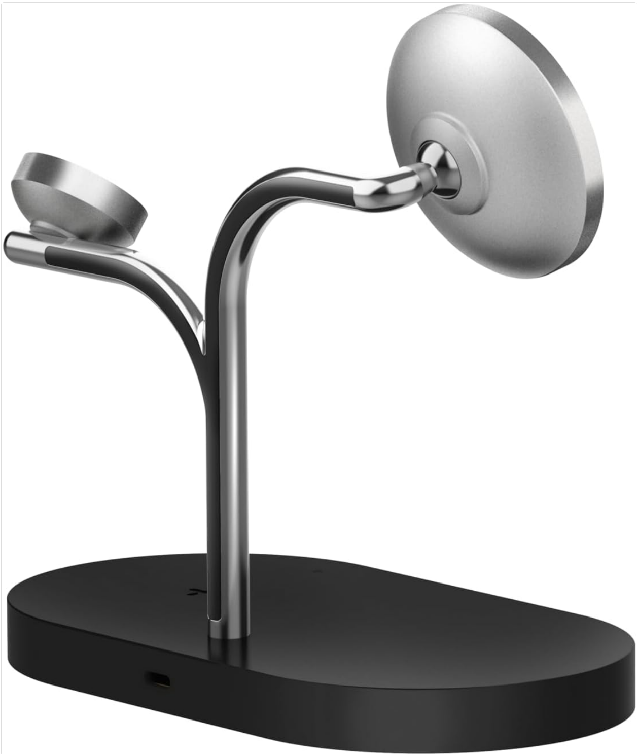
Figure 2: USB Type-C port on the rear of the charging station for power input.

3. Power On: The charging station will power on automatically. Indicator lights may illuminate briefly.