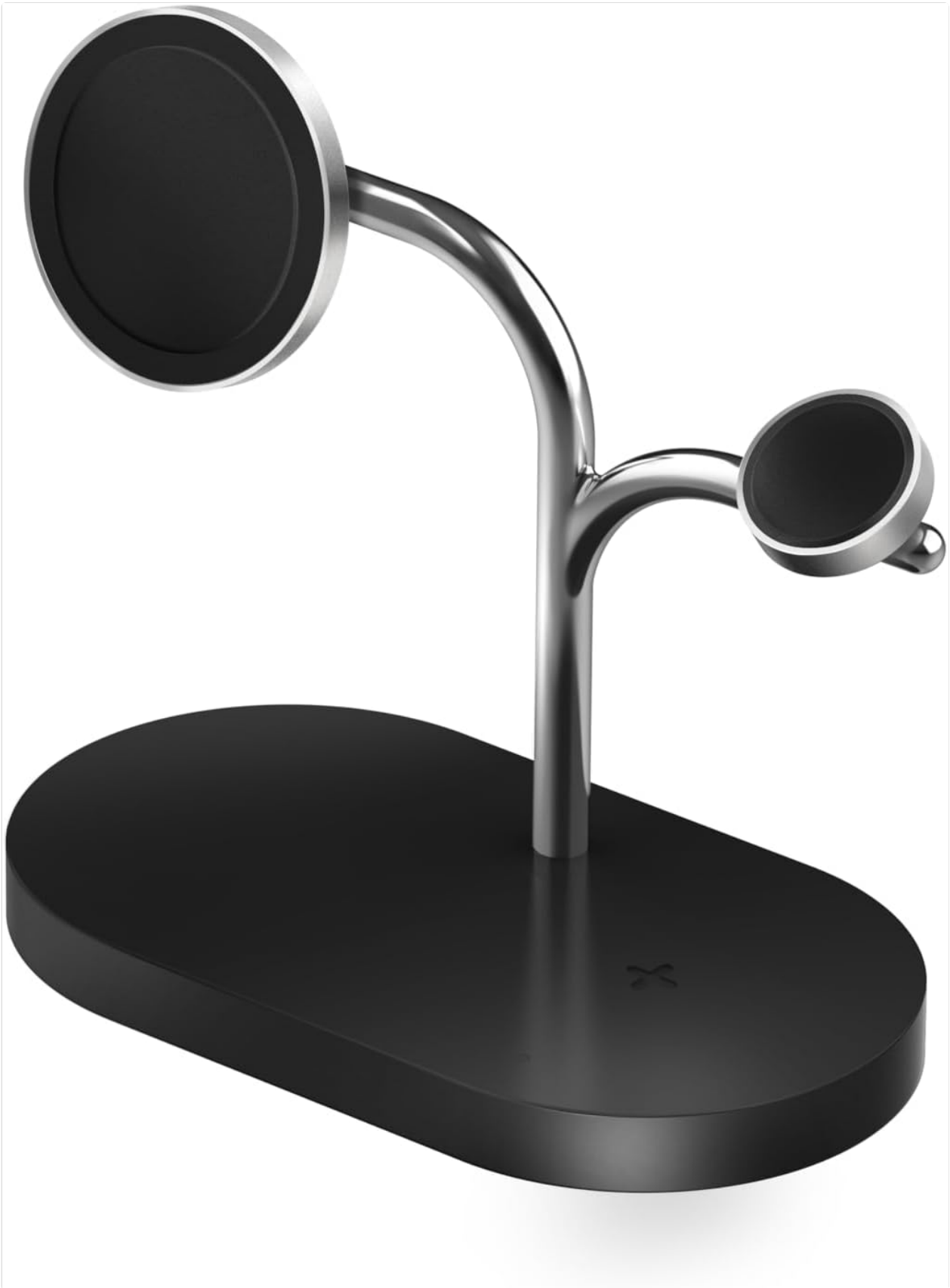
Figure 1: Contents of the Samsung 3-in-1 Wireless Charging Station package.