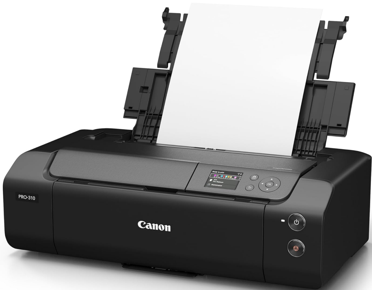
Figure 4: The PRO-310 with its top paper feed open, ready for paper loading.