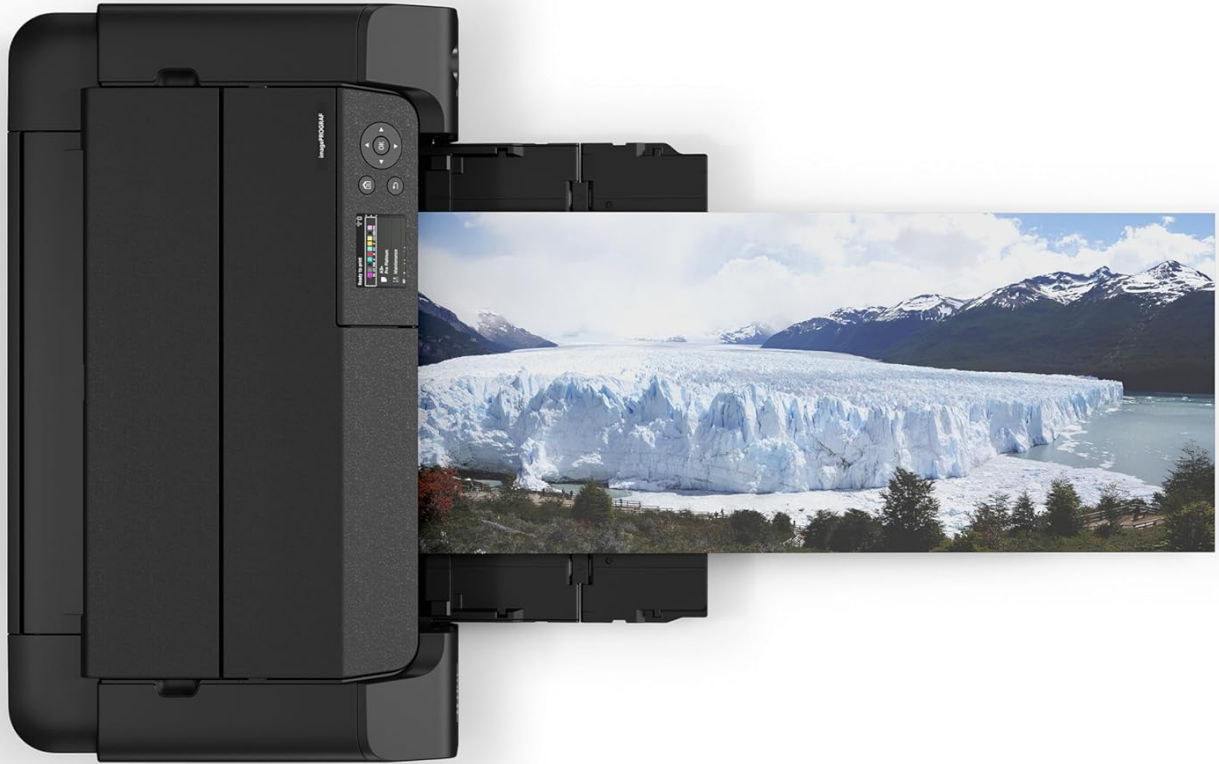
Figure 6: The PRO-310 printing a panoramic image, showcasing its versatile media handling capabilities.