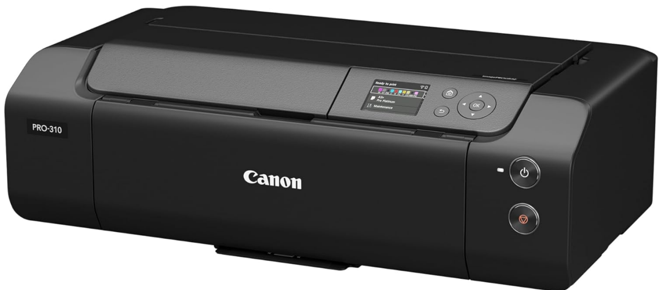
Figure 2: Angled view of the PRO-310, showing its compact design.