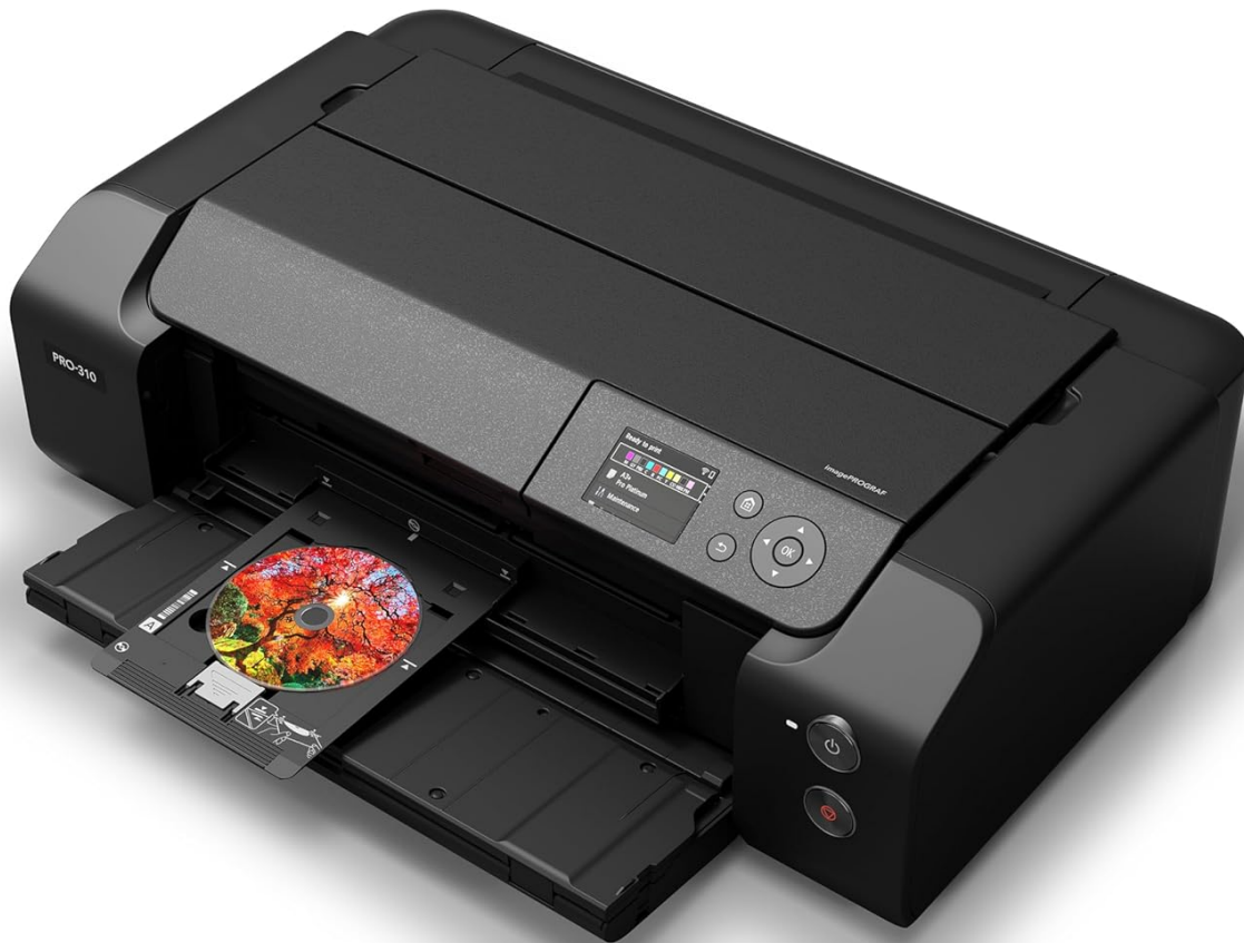
Figure 5: The PRO-310 with its CD/DVD printing tray extended, demonstrating versatile media handling.