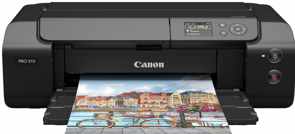
Figure 1: Front view of the Canon imagePROGRAF PRO-310 printer.