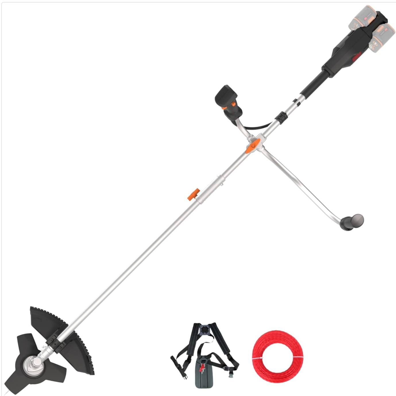
Image: Full view of the WORX WG084E.9 Cordless 40V Brushless Grass Trimmer, showcasing its long shaft, cutting head, and handle, along with included accessories like the harness and cutting line.