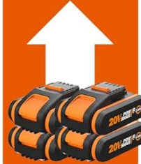
Image: Illustration of the WORX PowerShare battery system, showing compatibility with 20V, 40V, and 80V tools, highlighting the versatility of the battery platform.