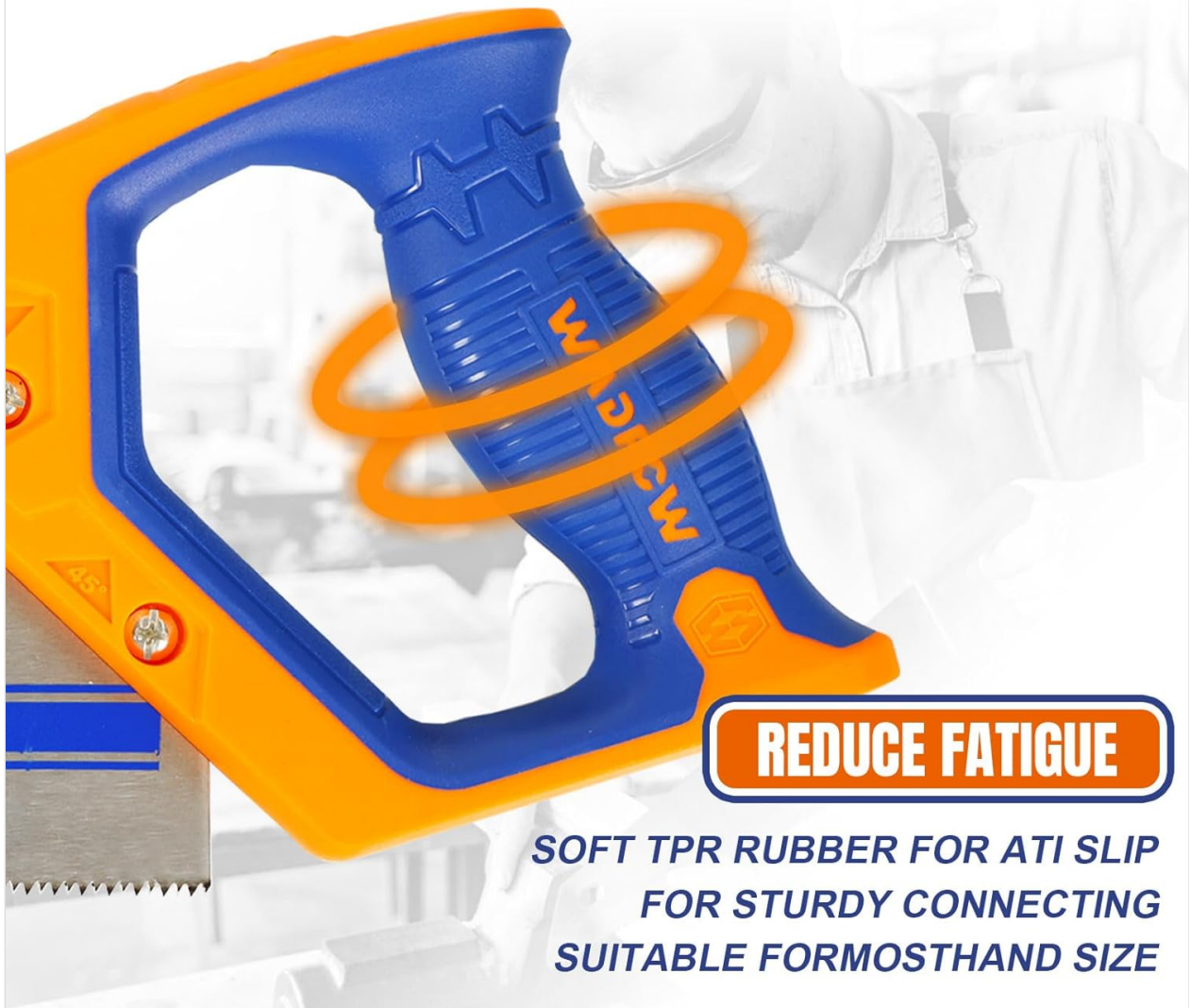
Image 3.1: Close-up of the ergonomic, non-slip ABS+TPE handle, highlighting its design for reduced fatigue.