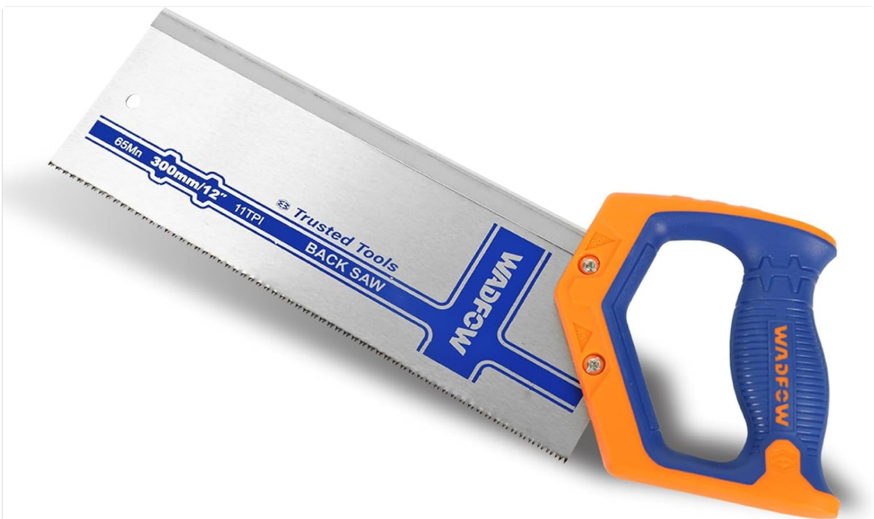
Image 1.1: The WADFOW WHW1130-1 12 Inch Pro Hand Saw, featuring its orange and blue handle and silver blade.

Please read this manual thoroughly before operating the saw and retain it for future reference.