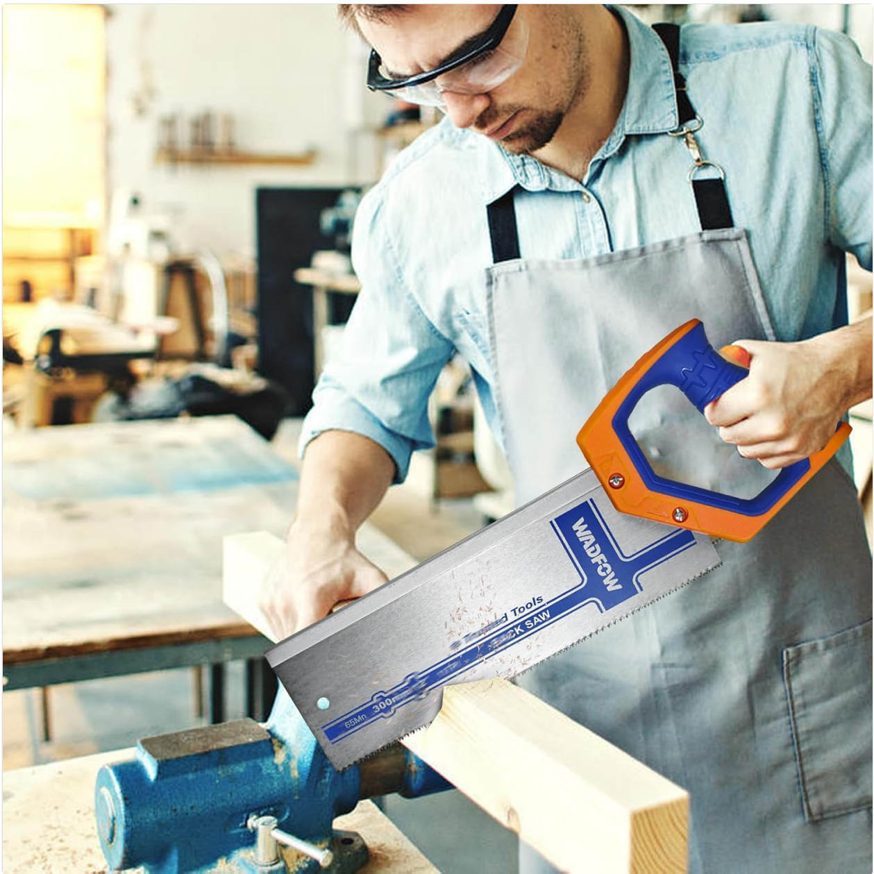
Image 5.1: A user demonstrating the proper technique for cutting wood with the WADFOW hand saw, wearing safety glasses.