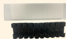
Cable Management Clips & Sticker