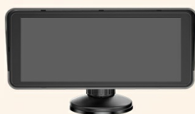
Baby car monitor