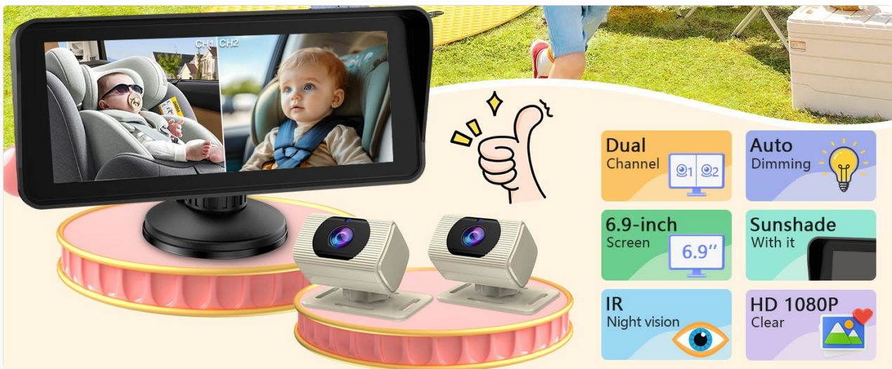
Image: The 6.9-inch ultra-wide display showing simultaneous views from two cameras, providing comprehensive coverage.