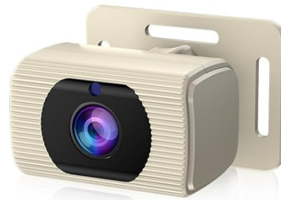
Image: Yakry 2-Kids Baby Car Camera System showing the 6.9-inch split screen monitor and two cameras.