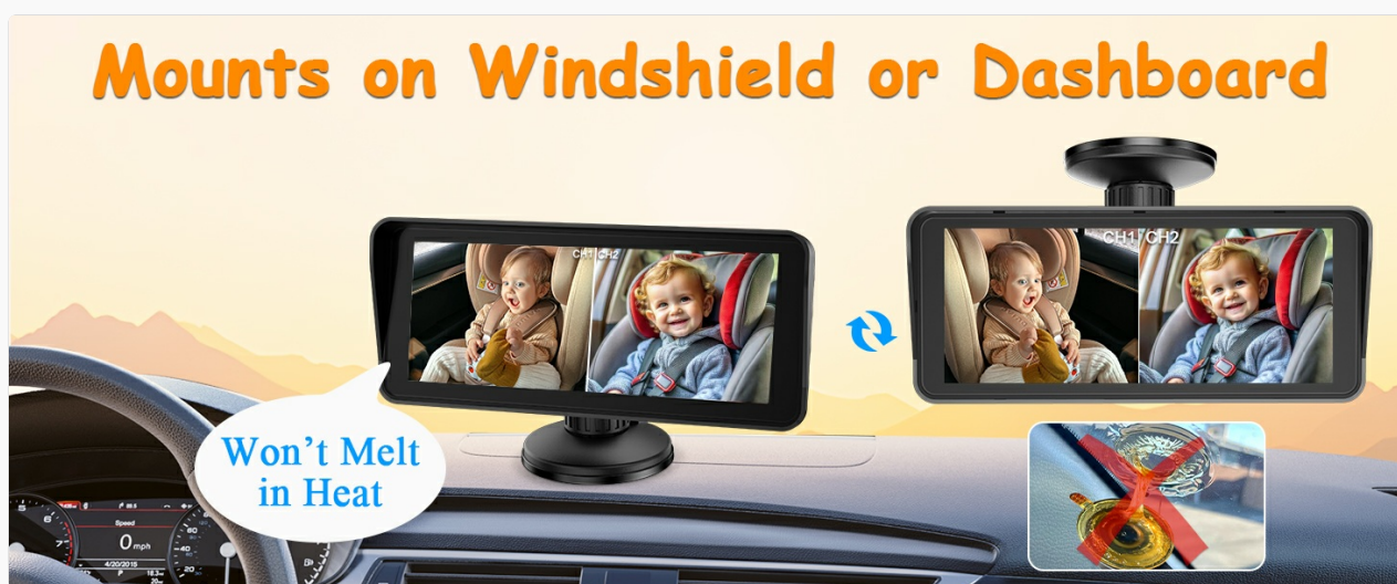
Image: Illustration of flexible mounting options for the monitor, suitable for dashboard or windshield placement.

Image: Visual guide for tool-free installation, showing camera attachment, cable routing, and power connection.