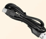
USB adapter cable