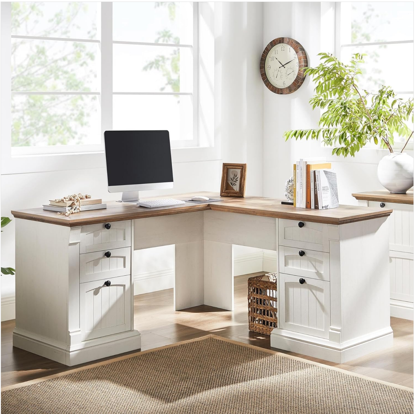
Image: The fully assembled OKD L-shaped executive desk in an antique white finish, showcasing its design and functionality in a home office environment.