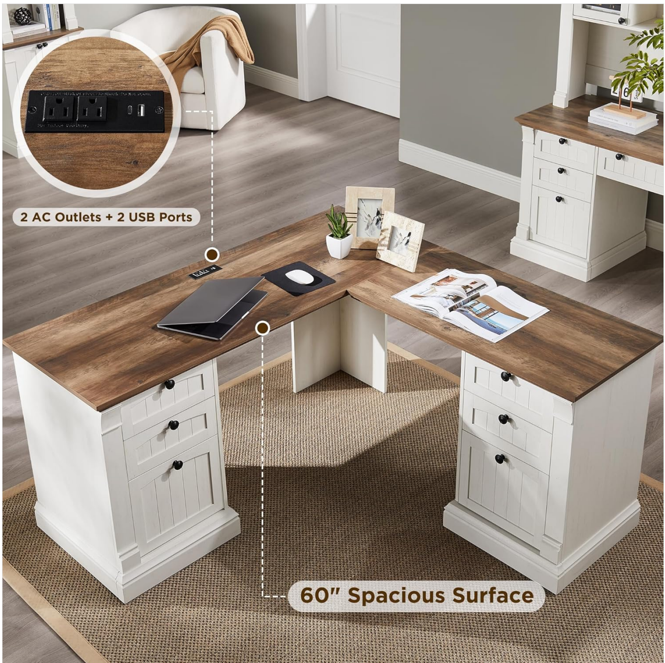
Image: A detailed view of the integrated charging station, featuring two AC power outlets and two USB ports for convenient device charging.