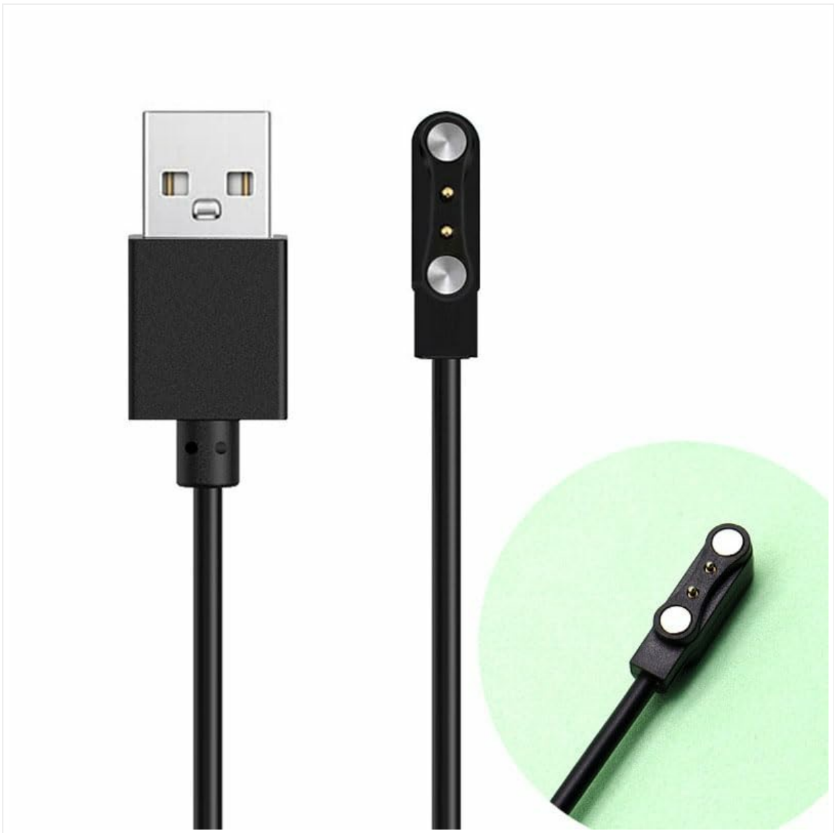
Figure 2.1: The Xininyia P68 P68M Smart Watch Magnetic Charging Cable, featuring a USB-A connector on one end and a magnetic charging head on the other.