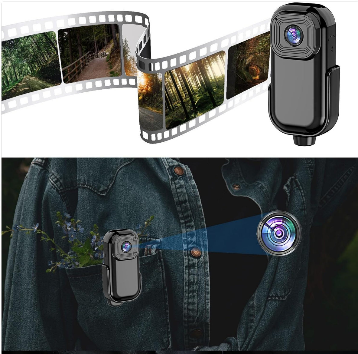
Image 5.3: The camera placed in a shirt pocket, illustrating a discreet and convenient way to record.