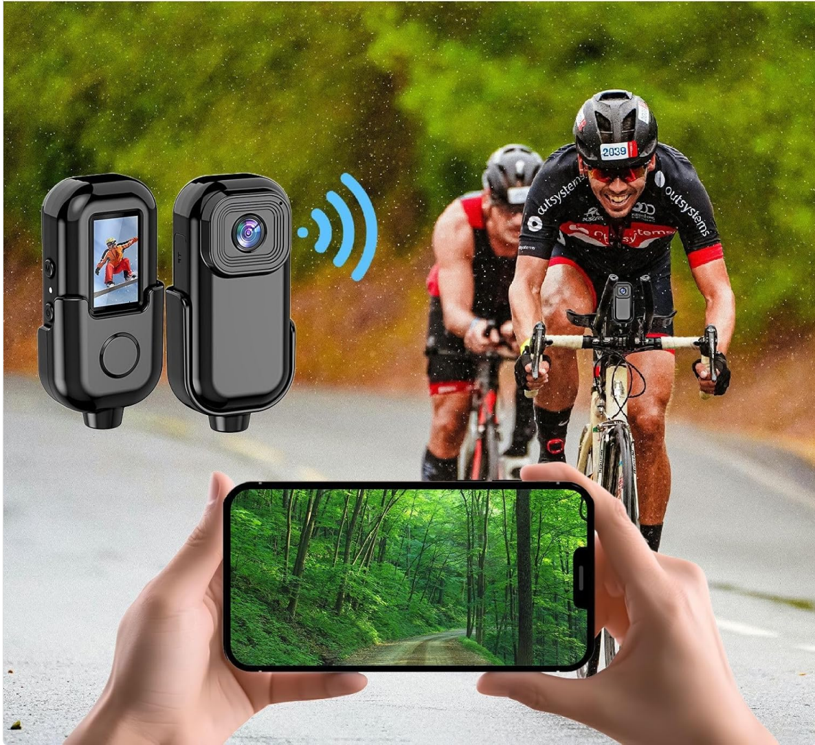
Image 4.2: The camera connected to a smartphone via Wi-Fi, showing a live view of a cycling path on the phone screen.