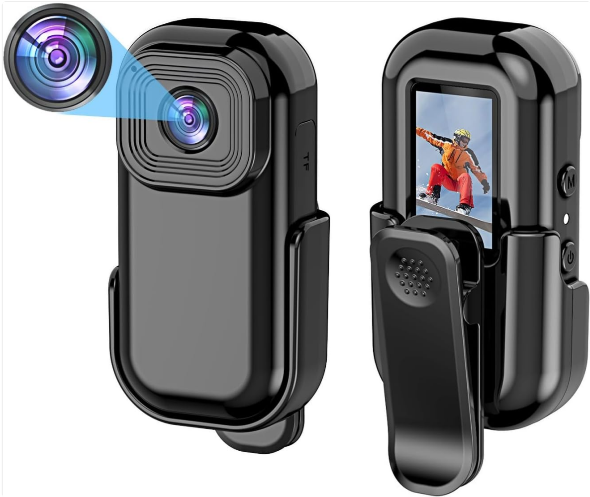
Image 1.1: The bjlysk Sport DV Thumb Sports Camera, a compact and portable recording device.