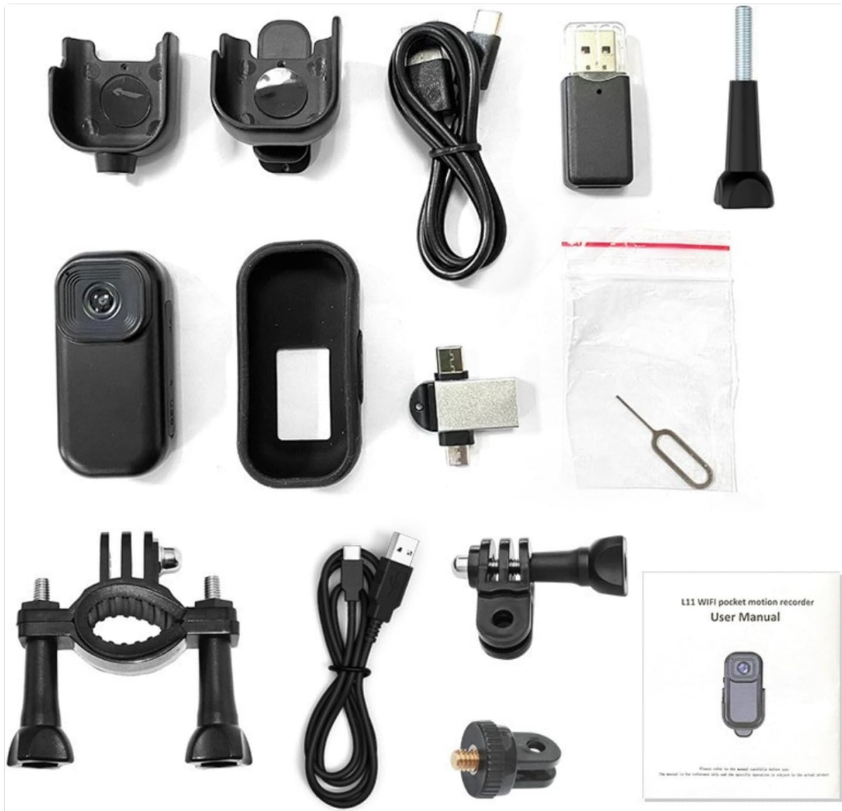
Image 2.2: An overview of the items included in the product package, showing the camera, various mounts, cables, and the physical user manual.