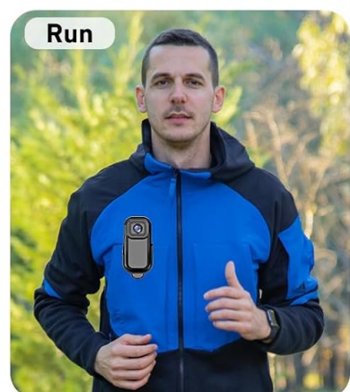
Image 5.1: Examples of the camera being used as a portable video recorder during activities such as climbing, cycling (ride), general sports, and running.