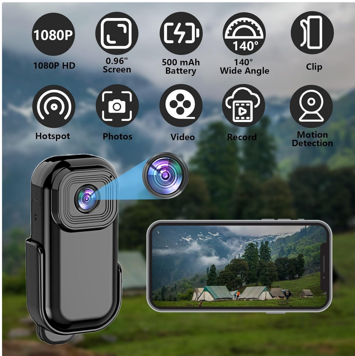
Image 2.1: Visual representation of the camera's key features including 1080P HD, 0.96" screen, 500 mAh battery, 140° wide angle, clip, hotspot, photos, video, record, and motion detection.