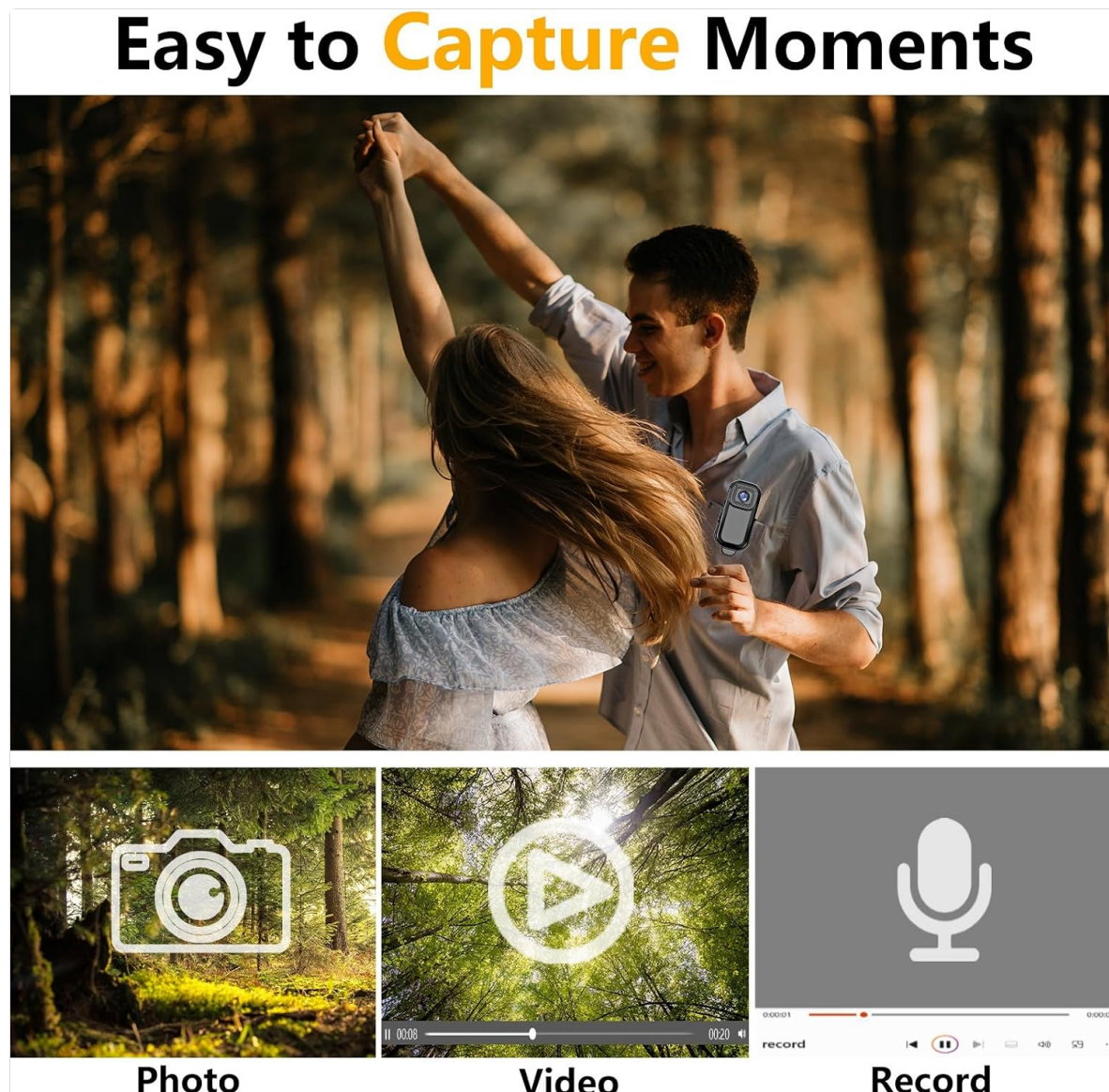
Image 4.1: Illustration of the camera's capabilities to capture photos, videos, and audio recordings.