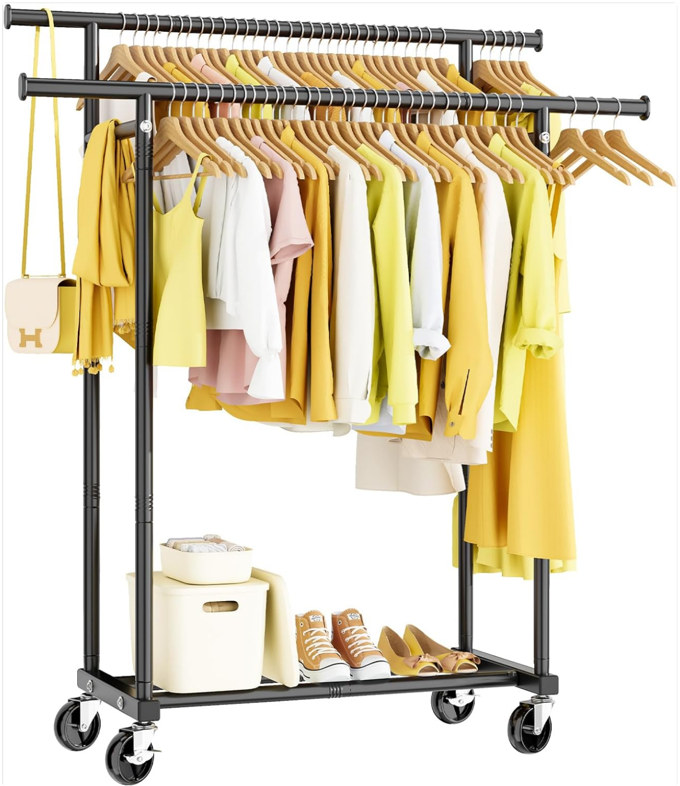
The HYSEYY Double Rods Clothes Rack, fully assembled and in use, showcasing its dual hanging rods and bottom storage shelf.