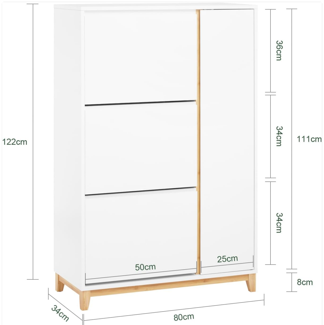
Detailed dimensions of the SoBuy FSR189-WN shoe cabinet.