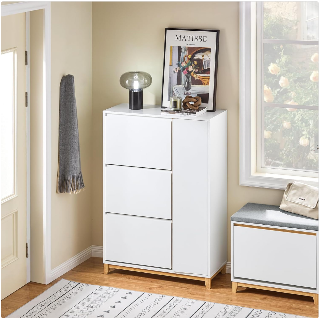
The SoBuy FSR189-WN shoe cabinet, showcasing its compact design and white finish with bamboo accents, positioned in an entryway.