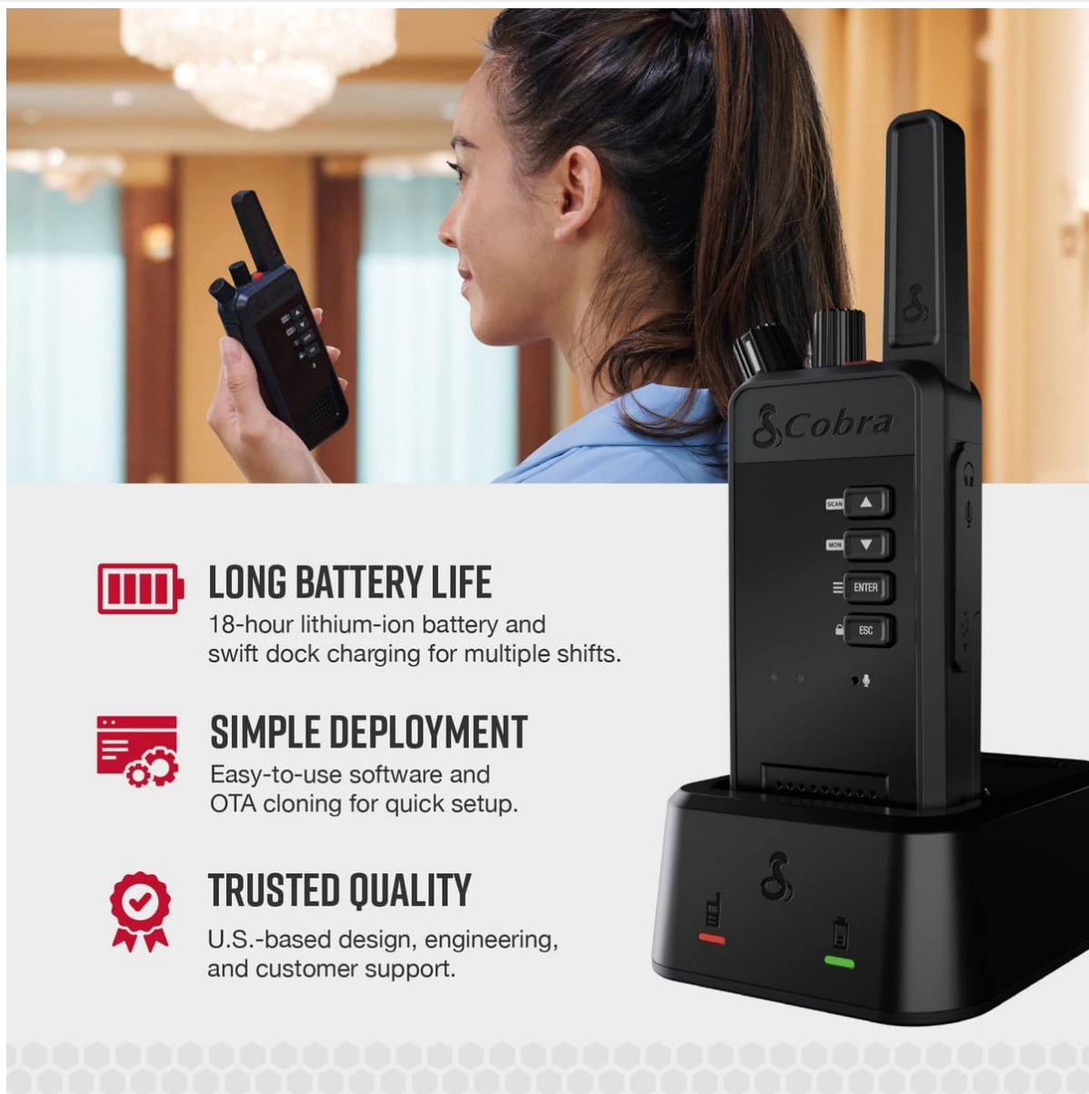
Figure 3.1: Cobra Performa 400 Two-Way Radio and included accessories.

This image displays the Cobra Performa 400 LMR Radio, its charging dock, a USB to USB-C charging cable, and a wall adapter, which are all included in the package.