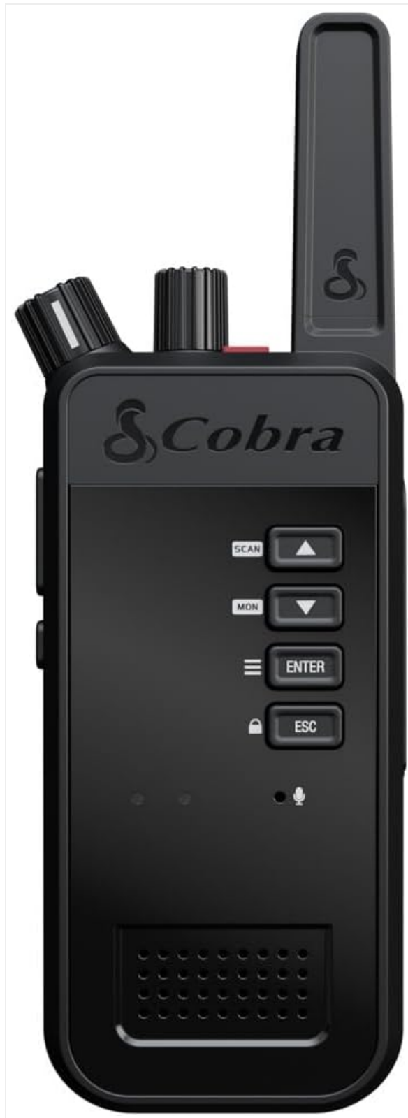
Figure 4.1: Front view of the Cobra Performa 400 Radio.

The front of the radio features a speaker, microphone, and control buttons for navigation and operation. The design is professional and robust.