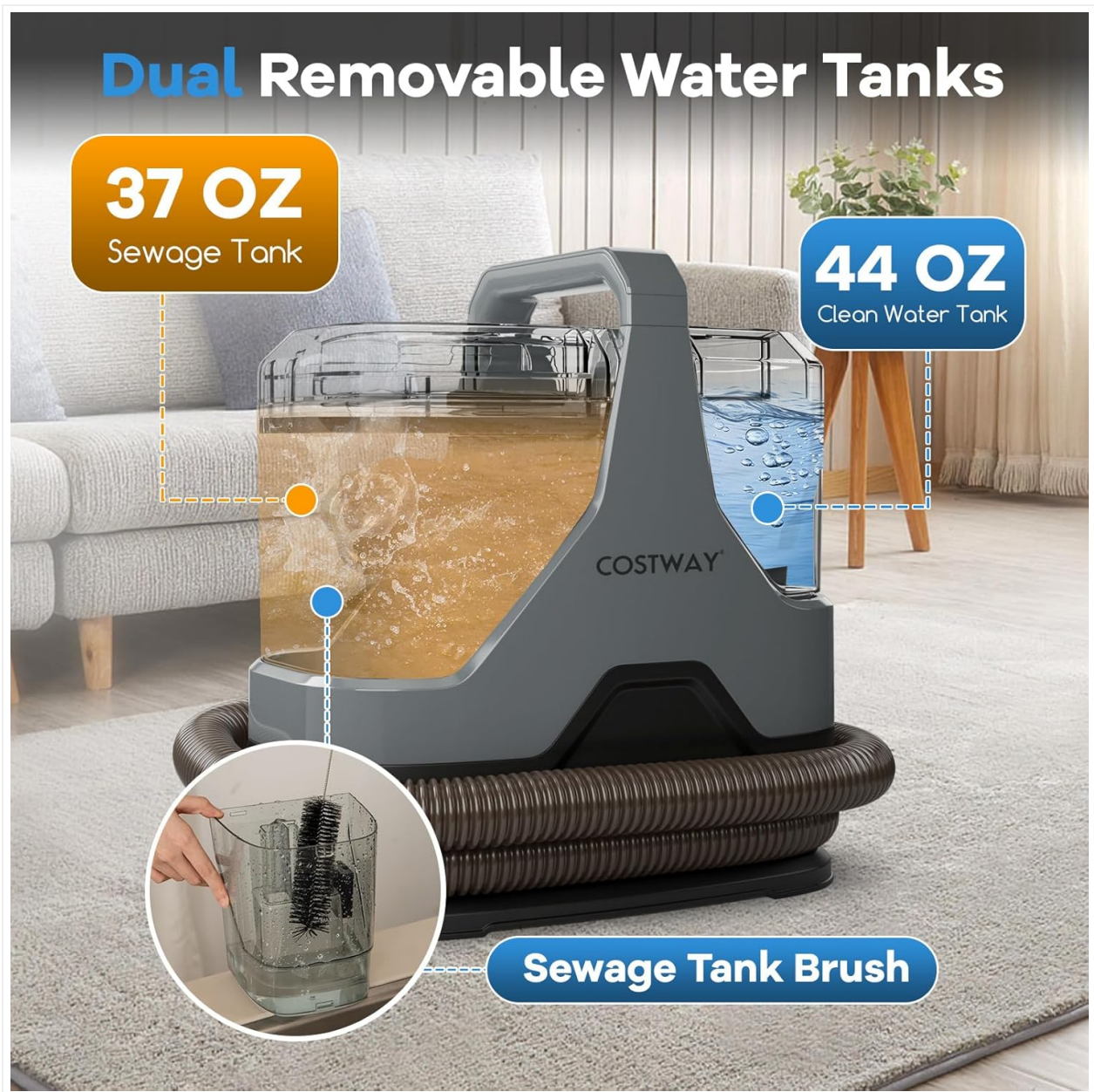
Image 4.1: Illustration of the dual clean water and sewage tanks, indicating their capacities.