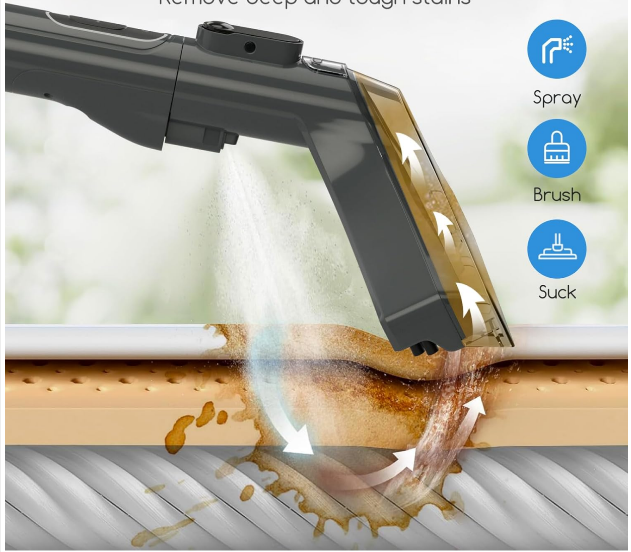
Image 5.1: Visual representation of the spray, brush, and suck functions working together to remove stains.