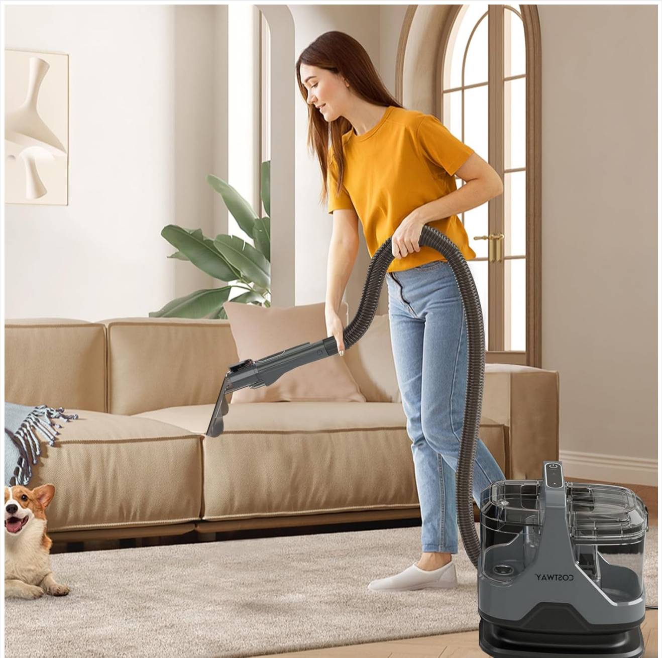
Image 5.4: A user demonstrating the effective use of the upholstery cleaner on a carpet.