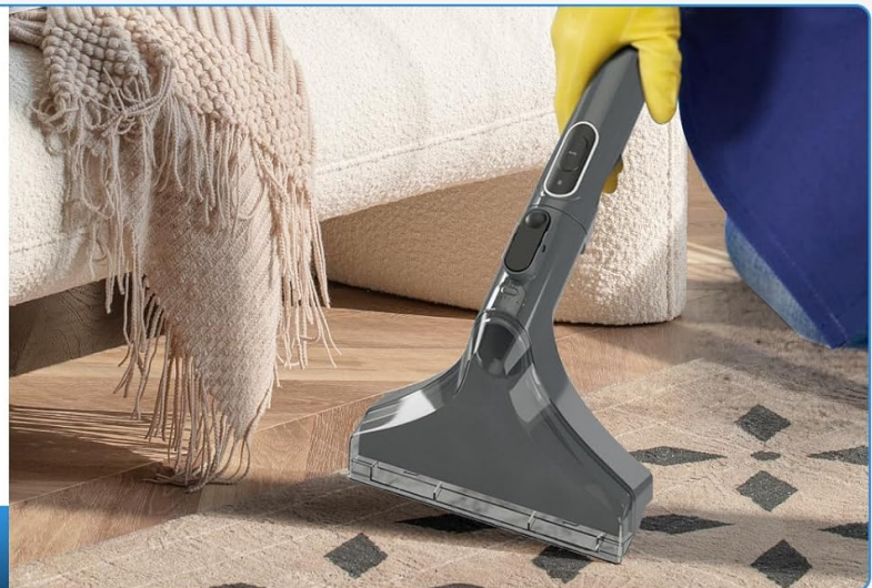
Image 4.2: The upholstery nozzle and tough stain brush, designed for various cleaning tasks.