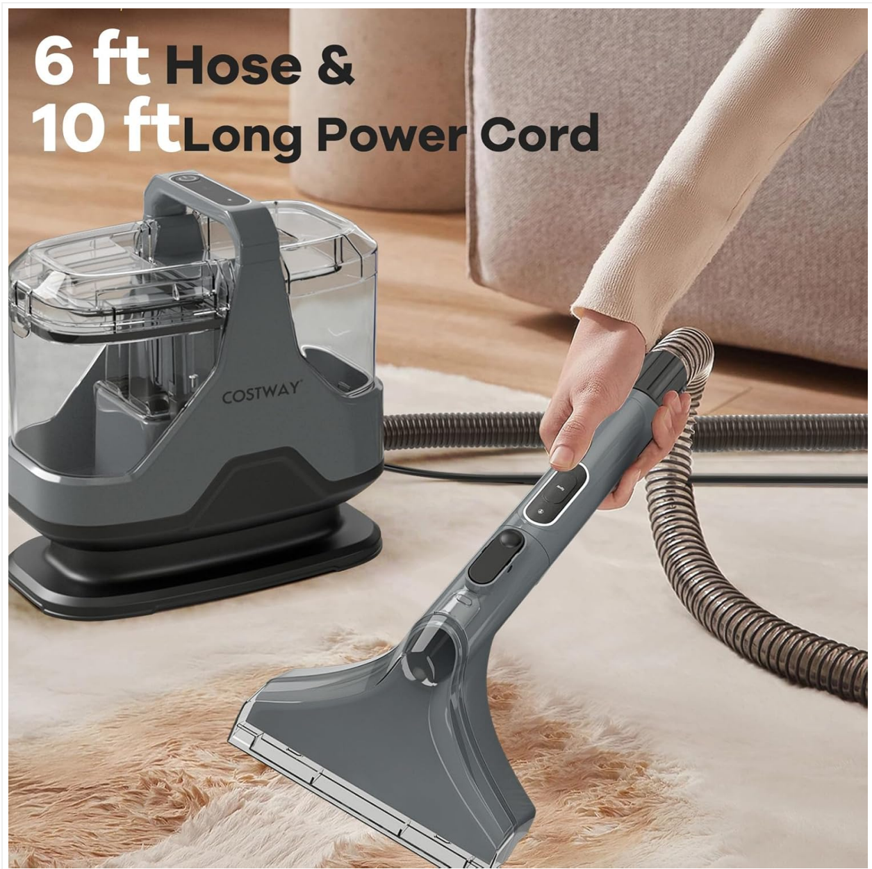
Image 5.3: The long hose and power cord provide ample reach for cleaning various areas.