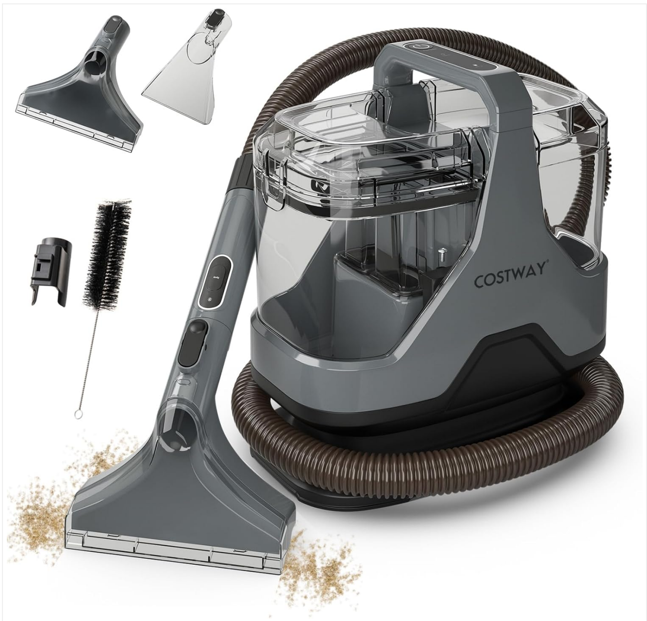
Image 1.1: The COSTWAY Upholstery Cleaner Machine shown with its various attachments, including the tough stain brush and upholstery nozzle.