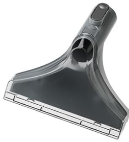
Tough Stain Brush