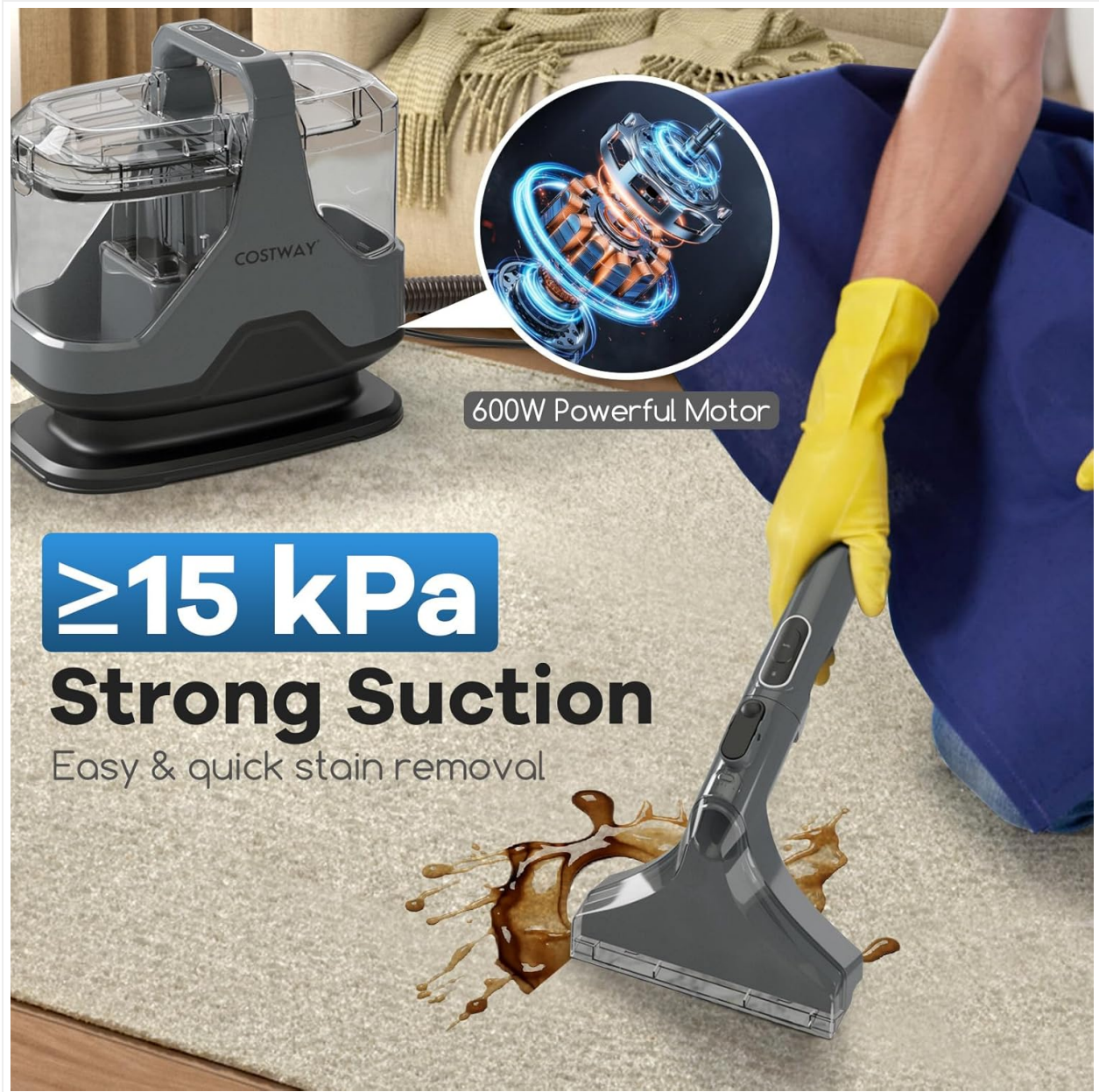
Image 5.2: Depiction of the machine's strong suction power, effectively removing liquid and dirt from a carpet.