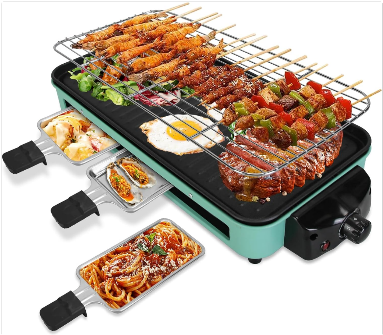
Image 3.1: The TeqHome 1500W Electric Indoor Grill showcasing its 2-in-1 functionality with both the grill net and the non-stick cooking plate in use, alongside the three individual raclette trays.