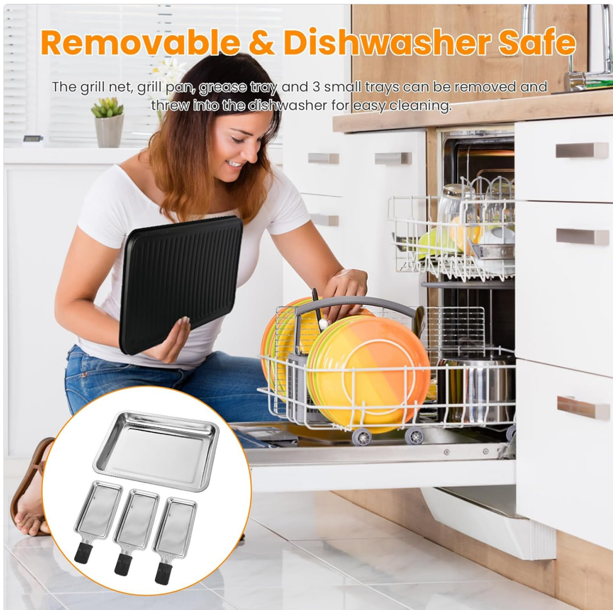
Image 6.1: The grill net, grill pan, grease tray, and three small trays are all removable and can be placed in a dishwasher for easy and convenient cleaning.