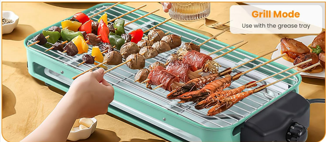
Image 4.1: Illustration of the two primary cooking modes: Frying Pan Mode, which utilizes the non-stick plate and allows for the use of the three small raclette trays, and Grill Mode, which uses the grill net over the grease tray.