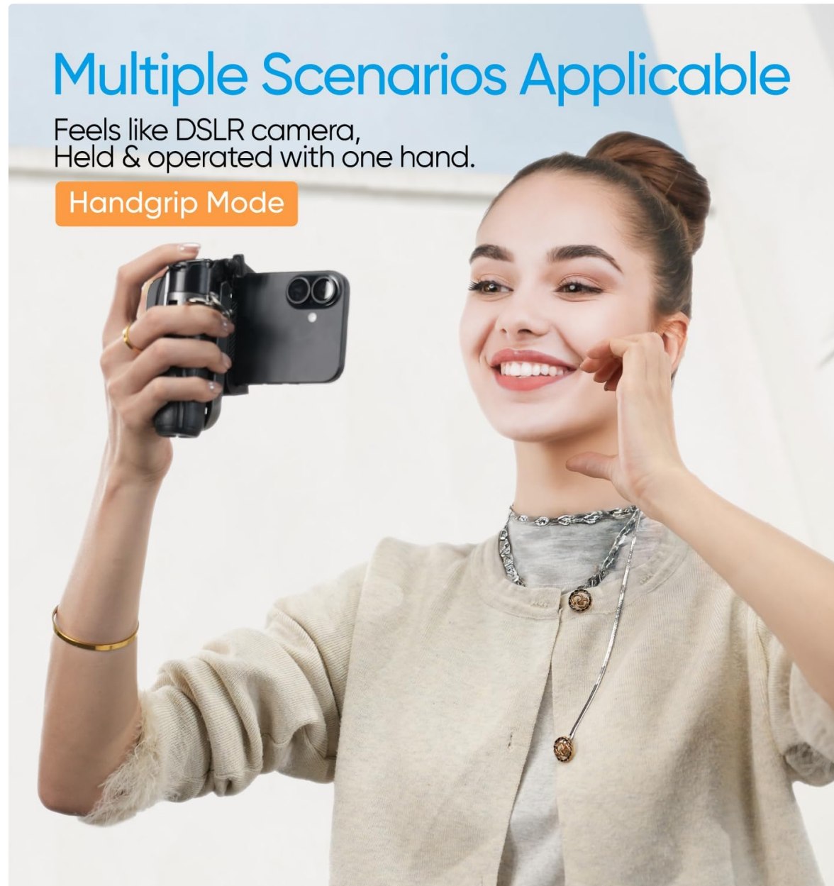
Image 3: A person using the handgrip mode, demonstrating how it feels like holding a DSLR camera for single-handed operation.

For a stable handheld experience, keep the tripod legs folded and use the device as a comfortable handgrip. This mode is ideal for dynamic shots and provides a secure hold for your phone.