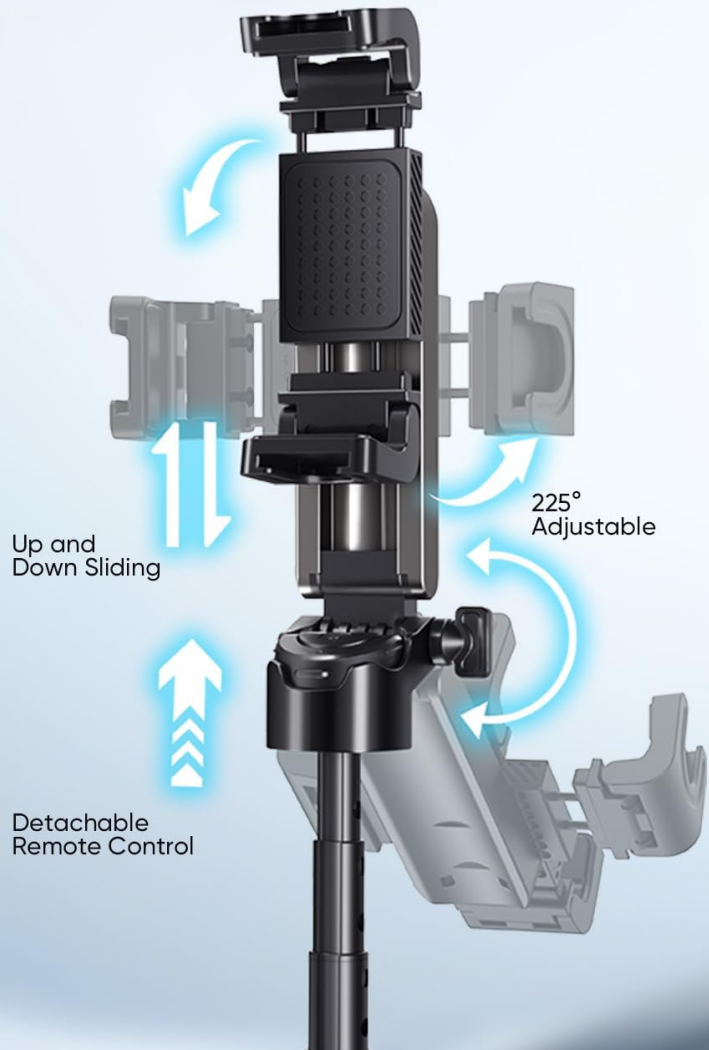
Image 5: Illustration of the 360° rotatable phone holder and 225° adjustable angle, along with cold shoe interfaces for accessories.