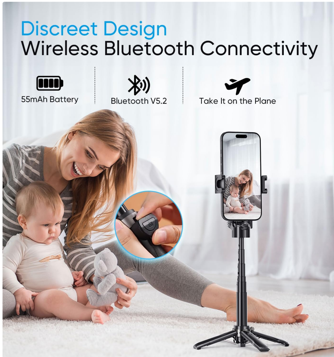
Image 2: A smartphone securely mounted on the tripod, highlighting the discreet design and wireless Bluetooth connectivity of the remote.