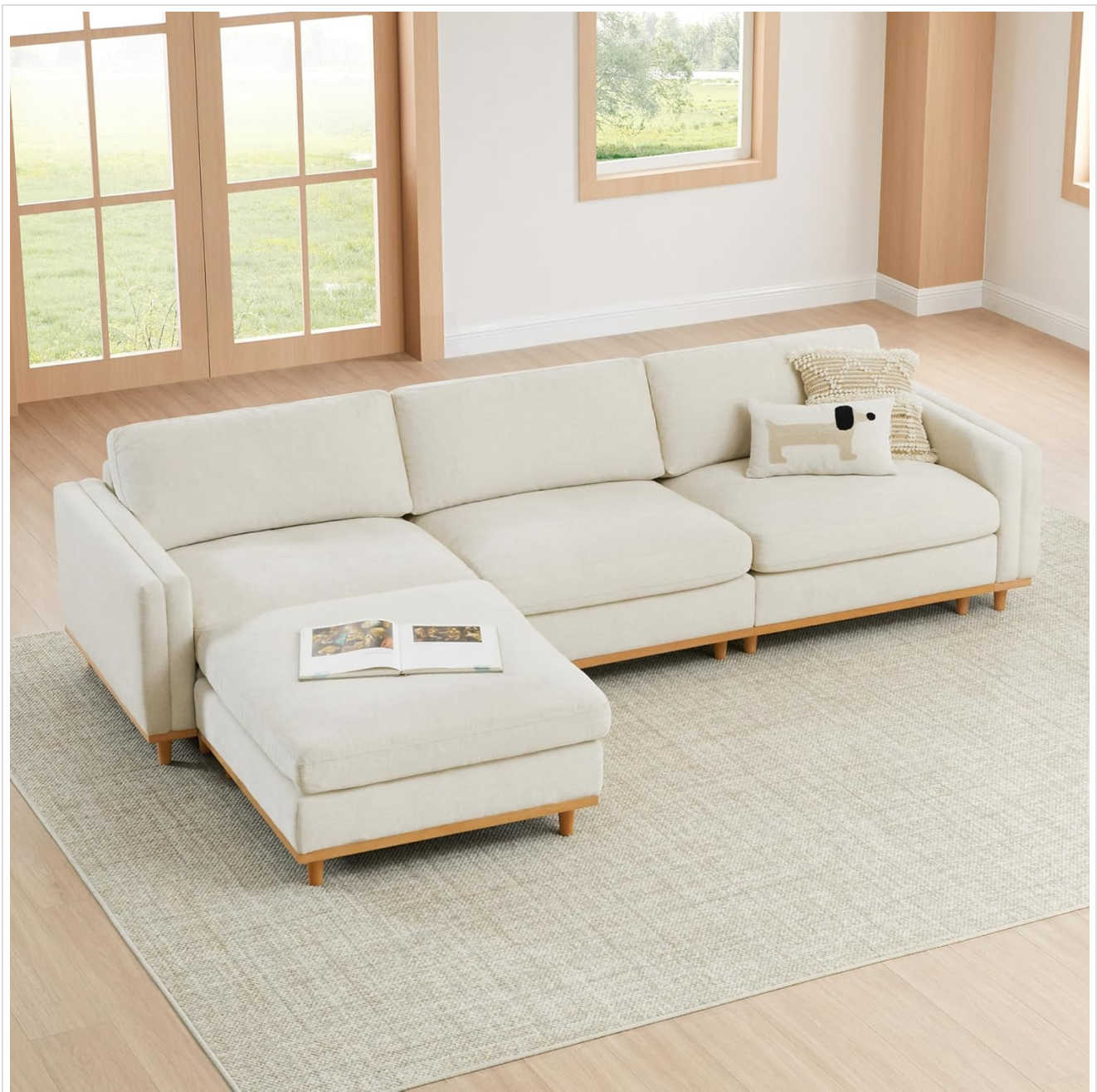
An overhead view of the assembled CHITA L-Shape Modular Sofa in Linen color, showcasing its spacious design and modular components.