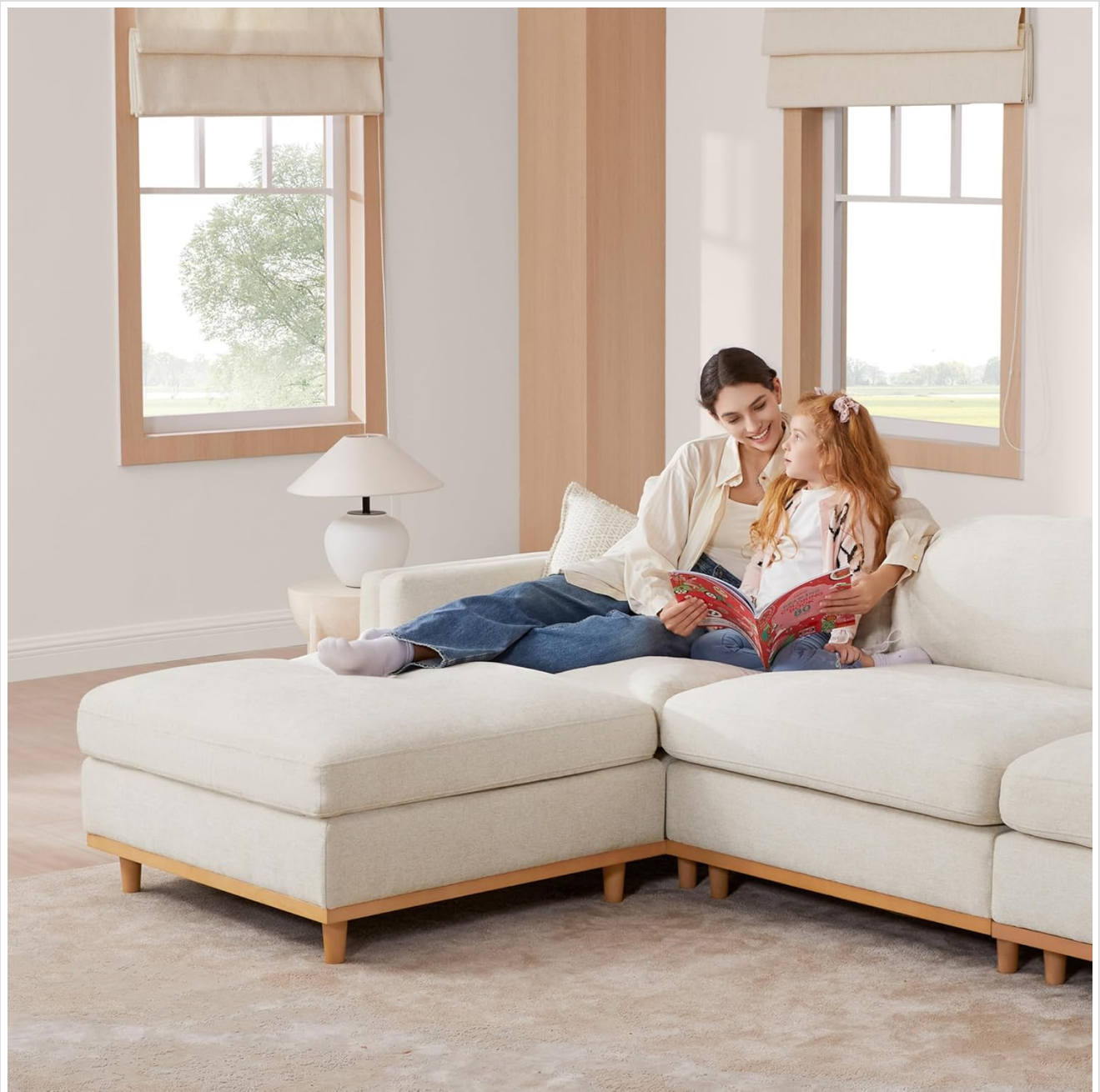
A view of the CHITA L-Shape Modular Sofa in a living room, demonstrating its adaptable design and spacious seating.