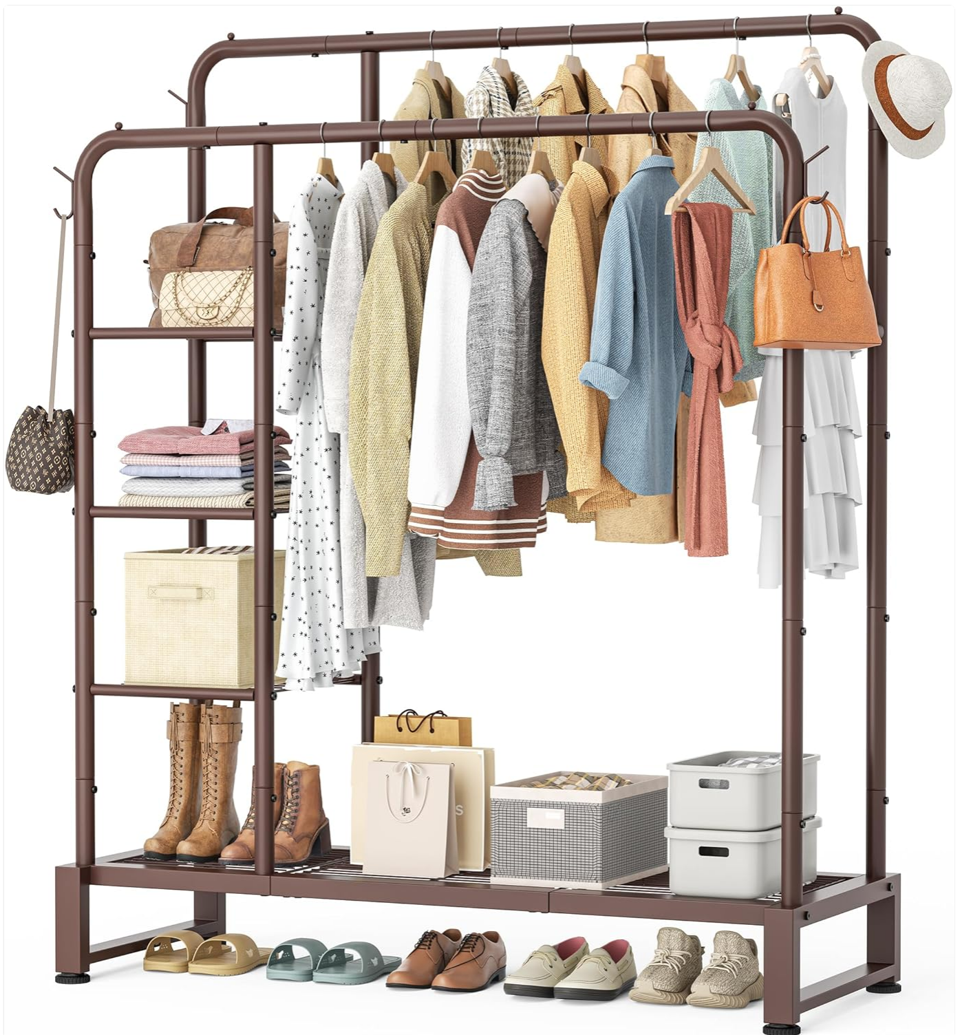
Image 1.1: The HOMIDEC Double Rods Clothes Rack fully assembled and in use, showcasing its storage capabilities for various items.