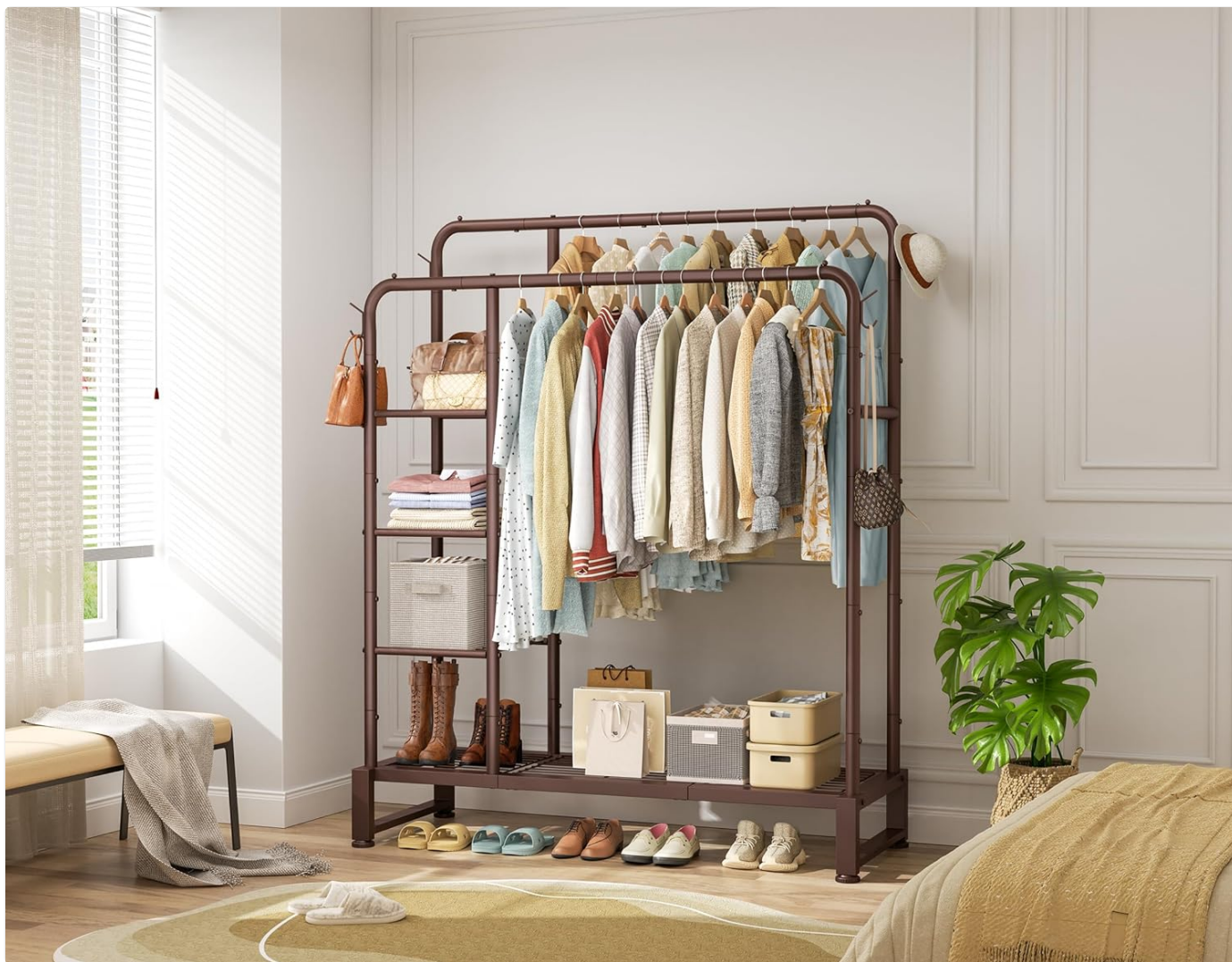
Image 5.1: The clothes rack positioned in a bedroom, demonstrating its capacity to organize a full wardrobe and accessories.