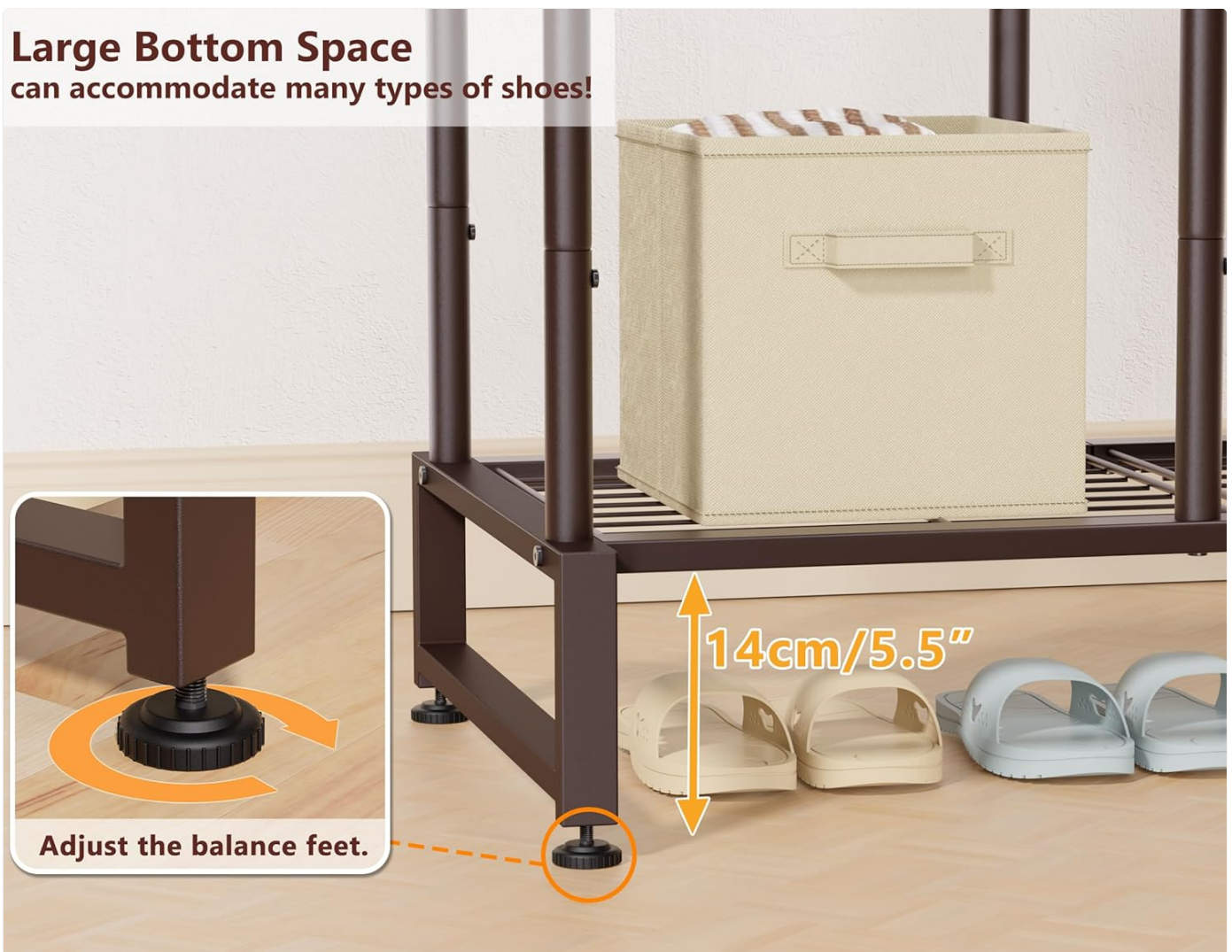
Image 4.1: Close-up details of the rack's construction, highlighting the robust all-iron structure and secure screw connections for stability.

Large Bottom Space can accommodate many types of shoes!