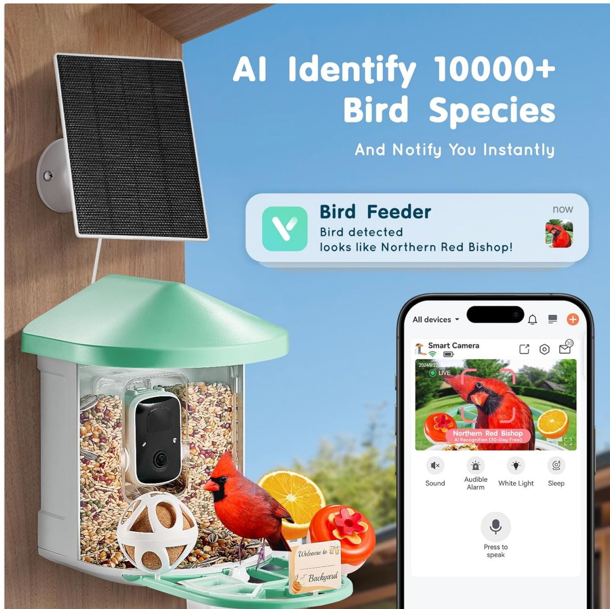
Figure 4: AI bird identification and notification.