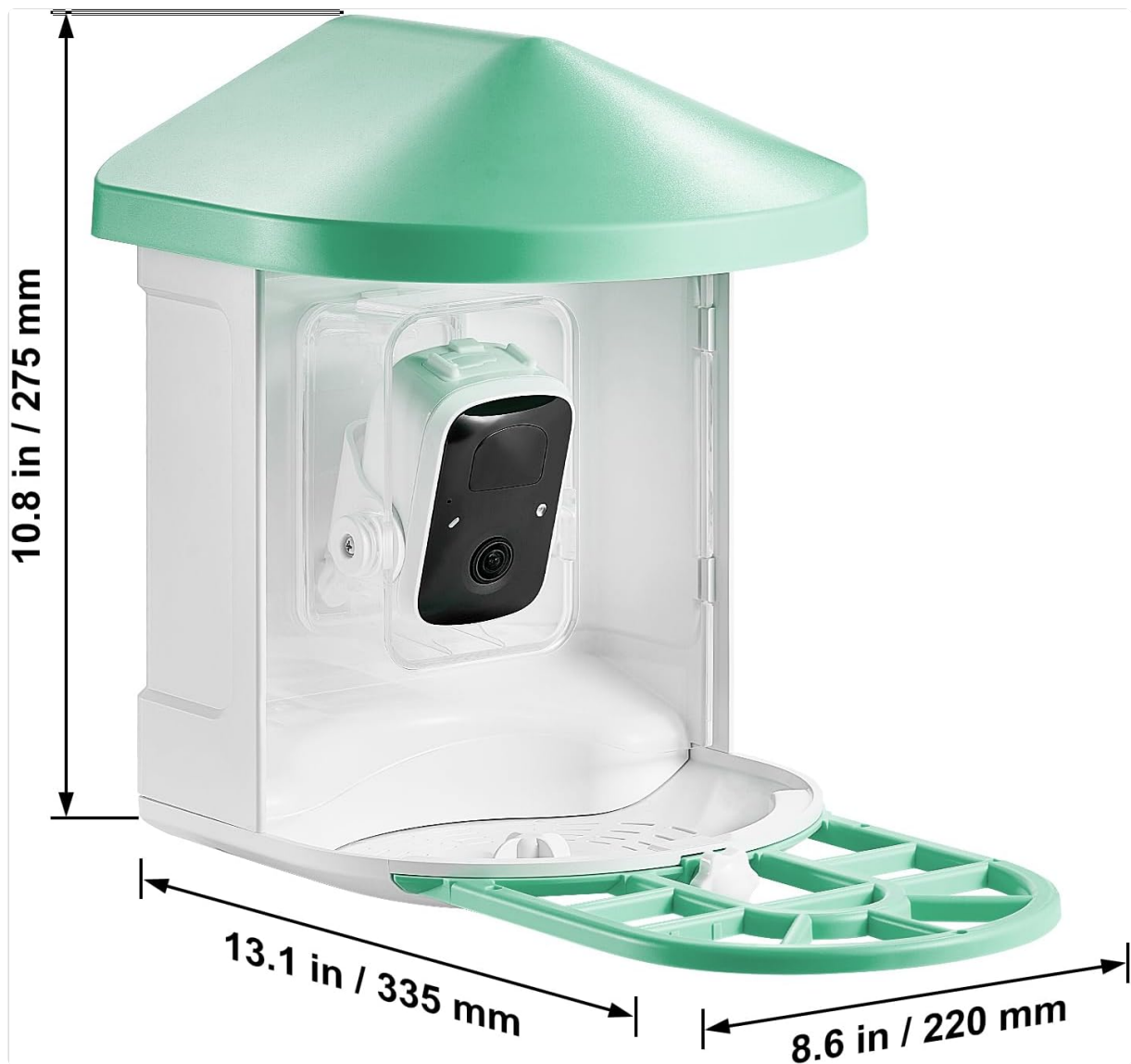
Figure 2: Product Dimensions.