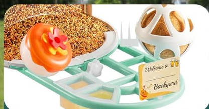
Rich Feeding Accessories