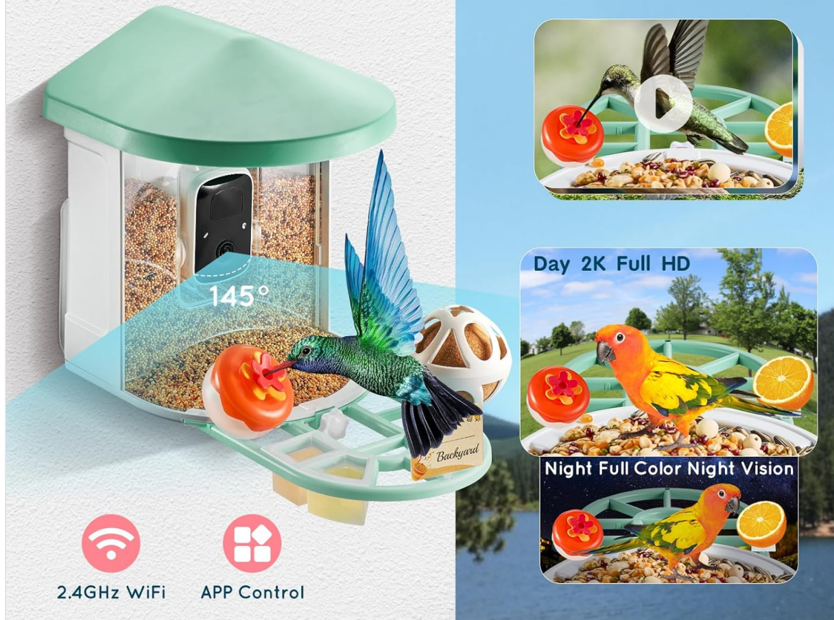
Figure 5: 2K Full HD and Full-Color Night Vision capabilities.

Capture birds' natural beauty in stunning detail