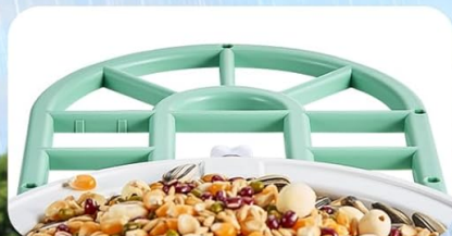
Sturdy Bird Stand