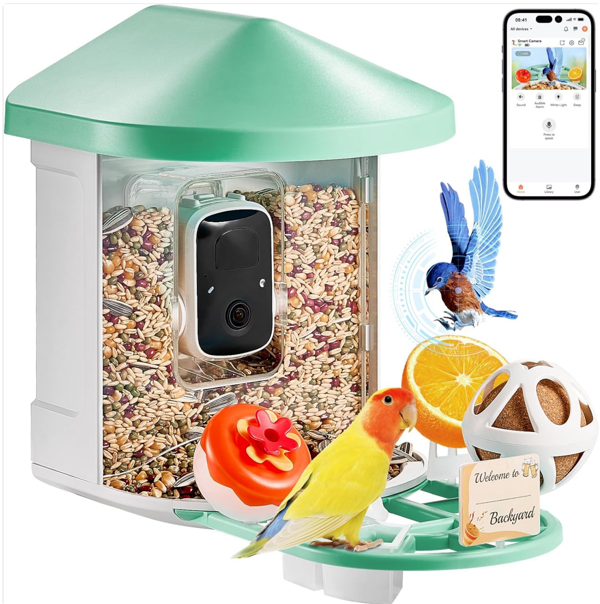
Figure 1: Happybuy Smart Bird Feeder with Camera in use.