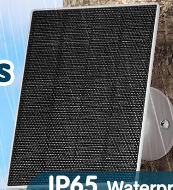
IP65 Waterproof Dustproof