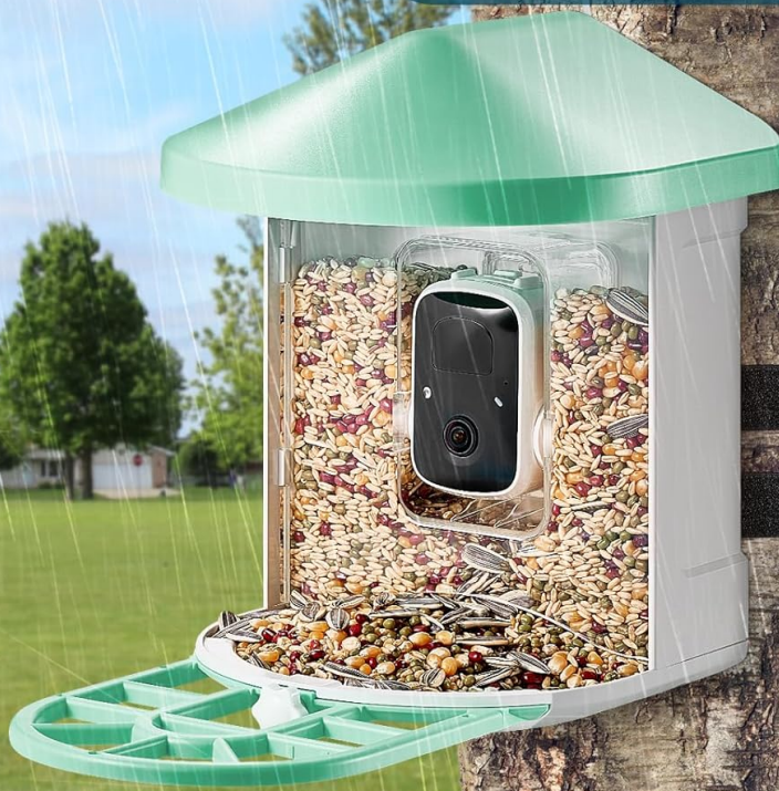
Figure 7: Bird-friendly design features, including drainage holes.