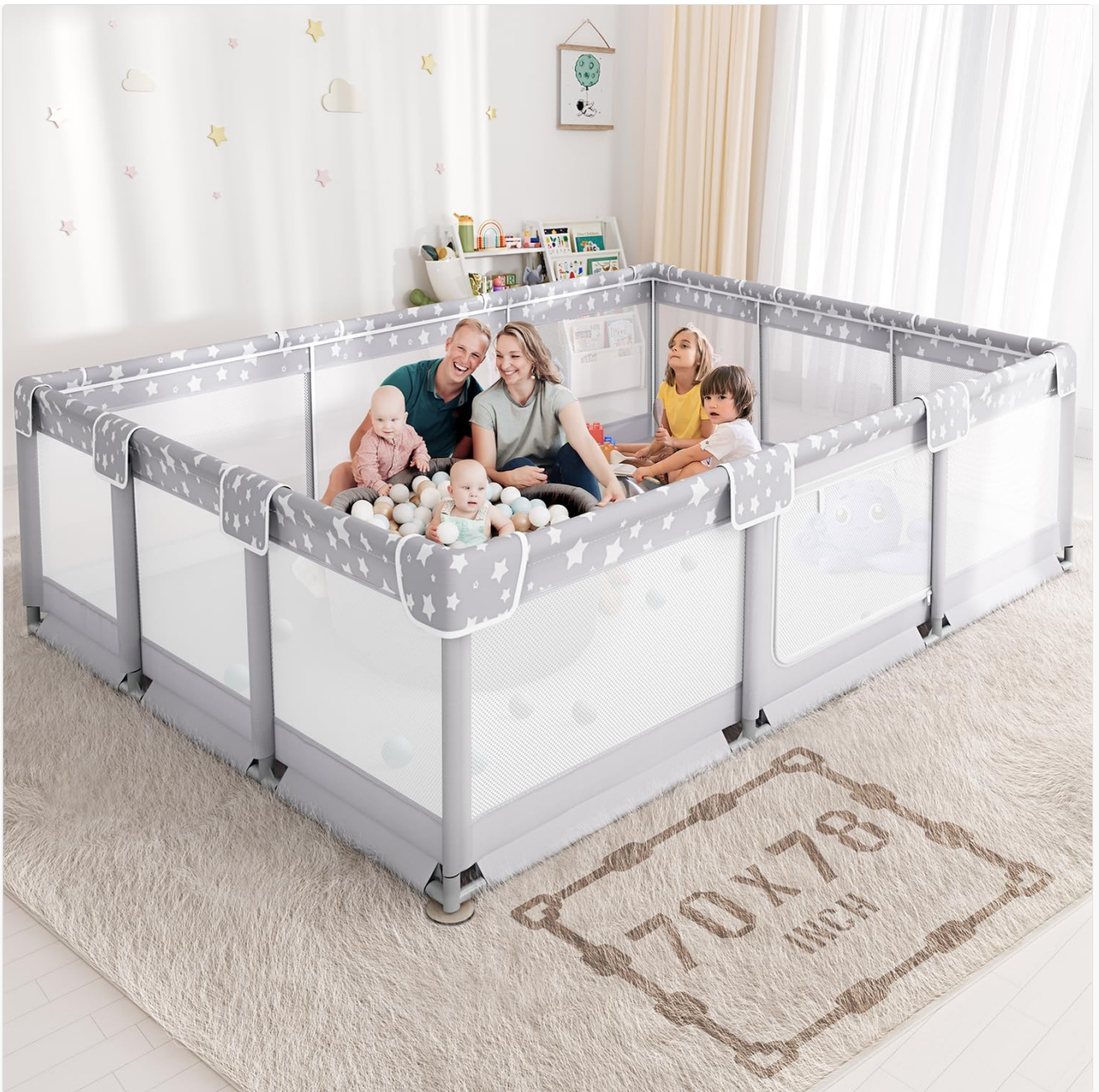
Image 1: The fully assembled NUTIKAS playpen, demonstrating its spacious design suitable for multiple children and adults. Note the secure mesh sides and sturdy frame.