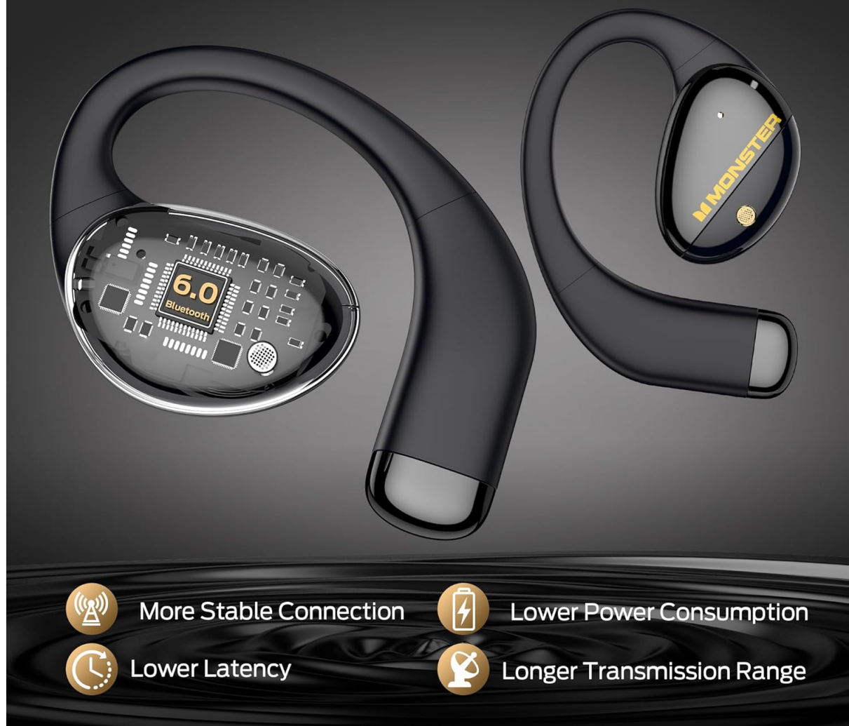
Figure 7.4: Upgraded Bluetooth 6.0