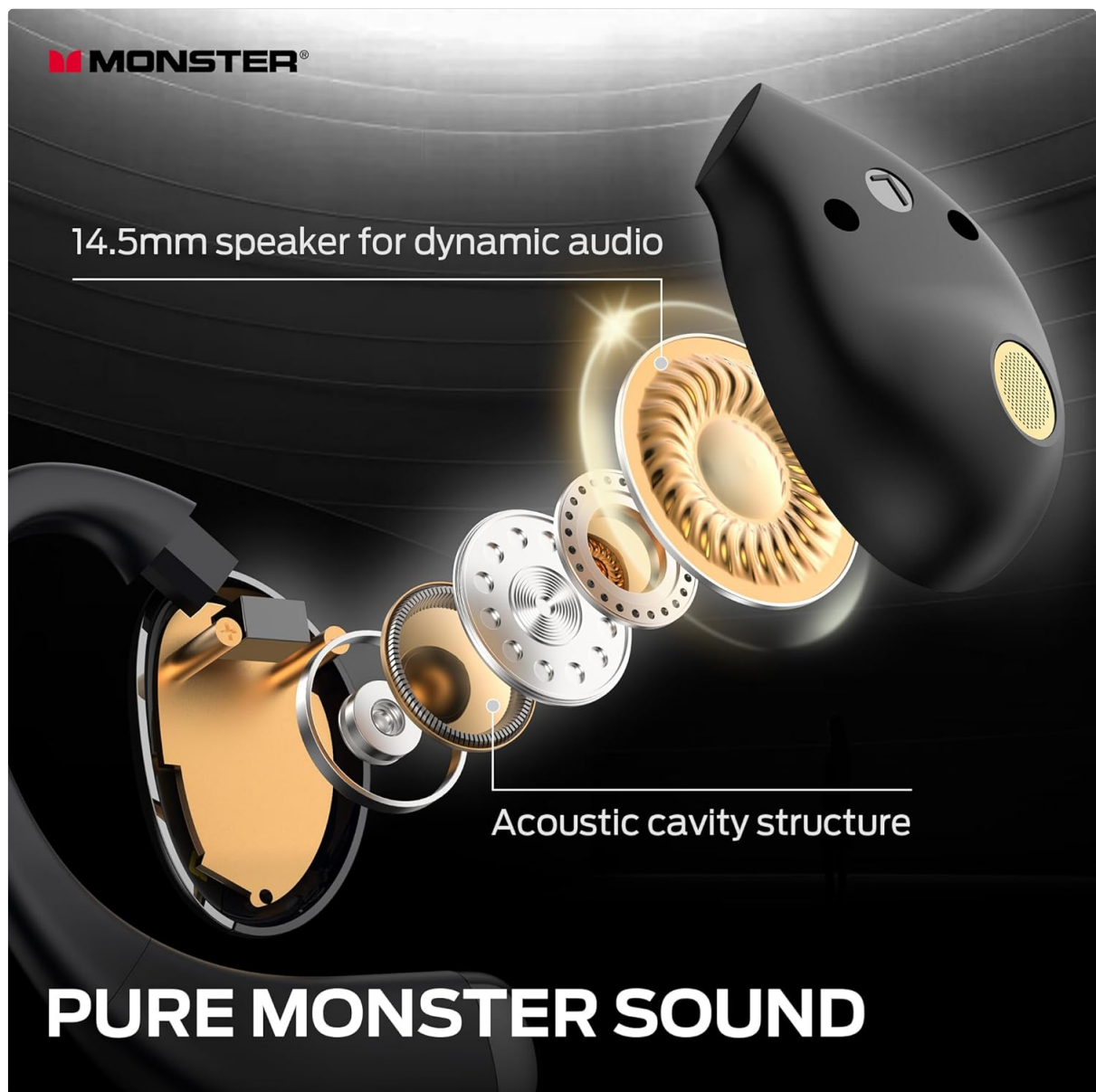
Figure 7.1: Pure Monster Sound Technology