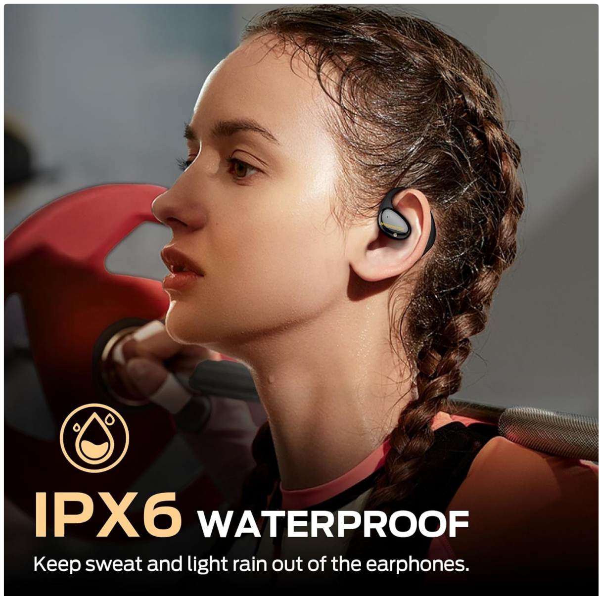
Figure 7.3: IPX6 Water Resistance