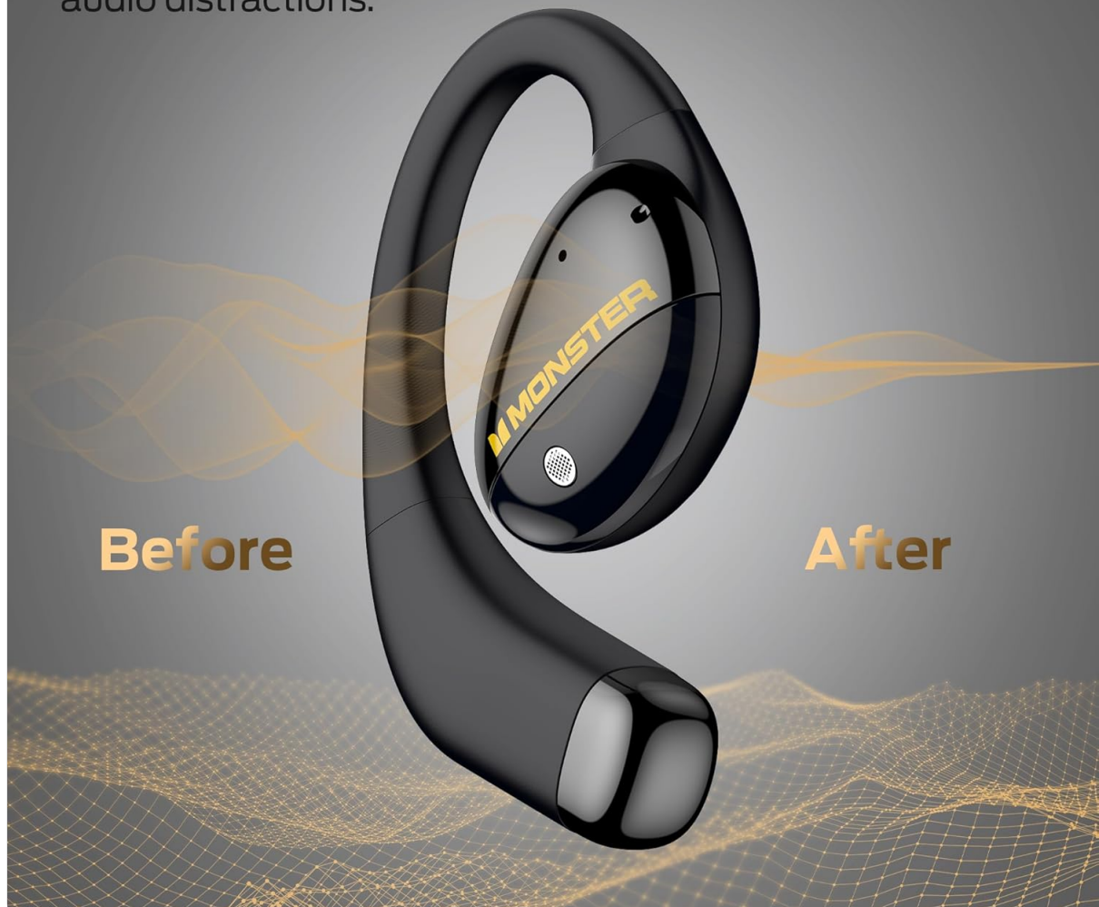
Figure 7.5: Crystal Clear Calls with AI Noise Reduction

AI noise reduction algorithm minimizes audio distractions.