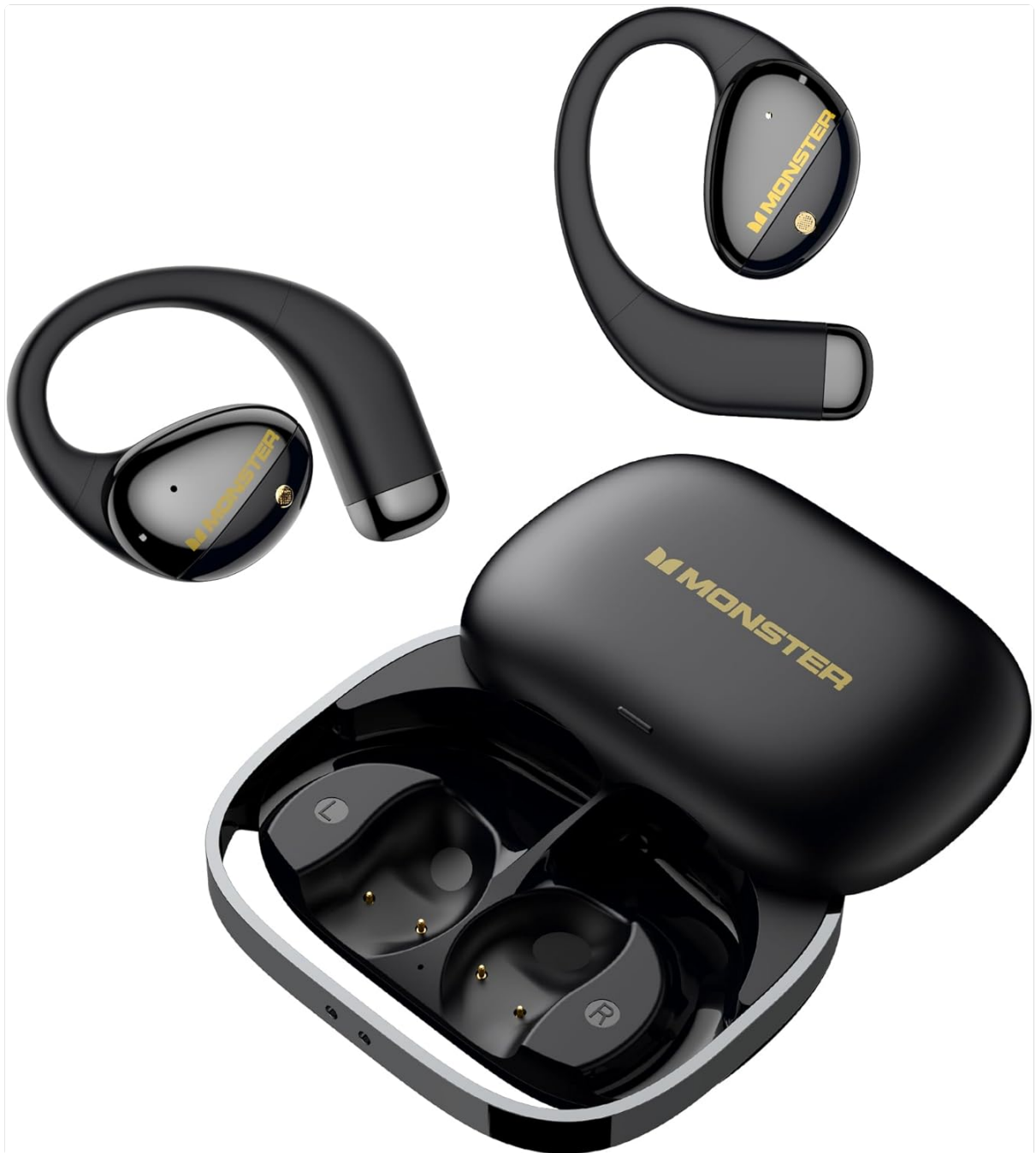
Figure 1.1: Monster Open Ear AC520 Headphones and Charging Case