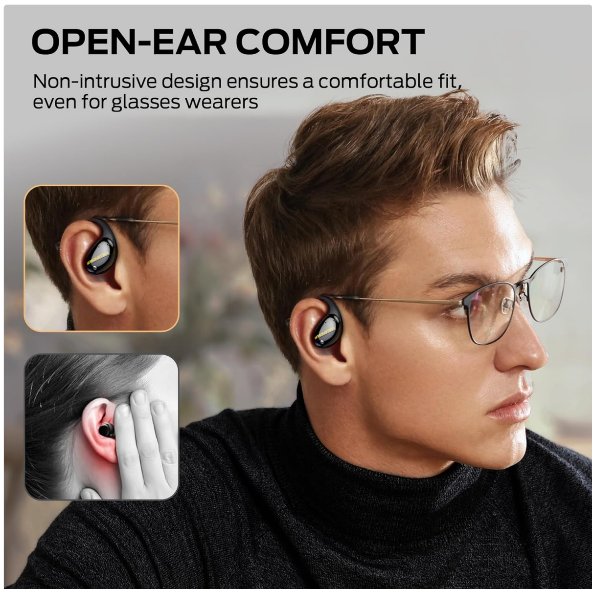
Figure 4.2: Open-Ear Comfort Design