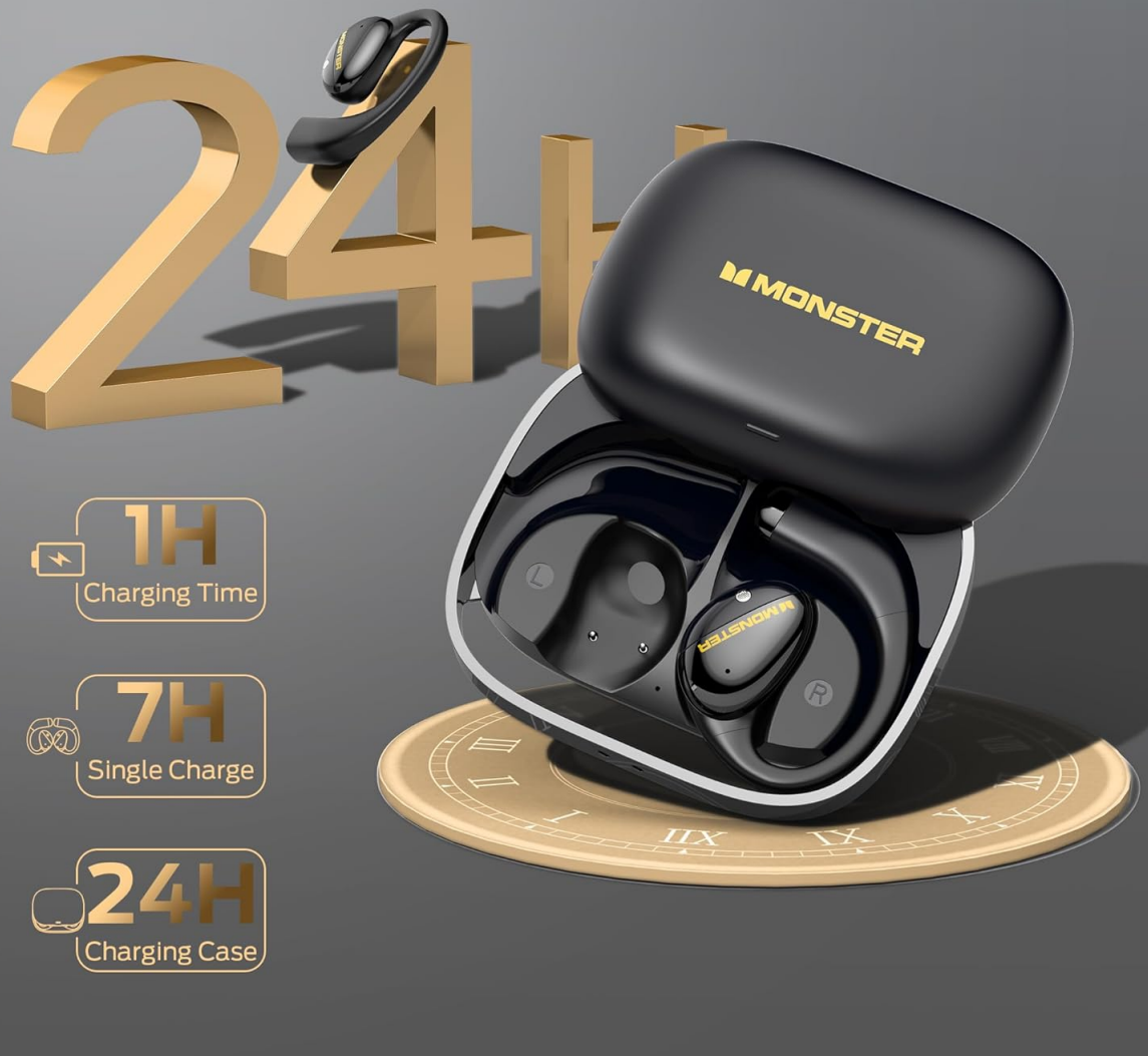
Figure 6.1: Enduring Power - 24H Playtime