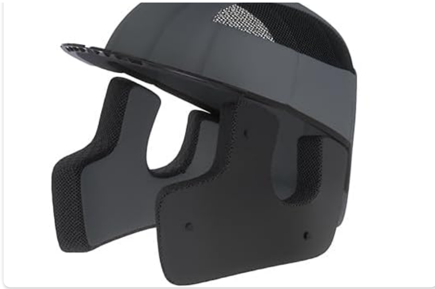
Image: Exploded view of the helmet's internal structure, highlighting the carbon fiber shell, EPS foam, and removable liner.