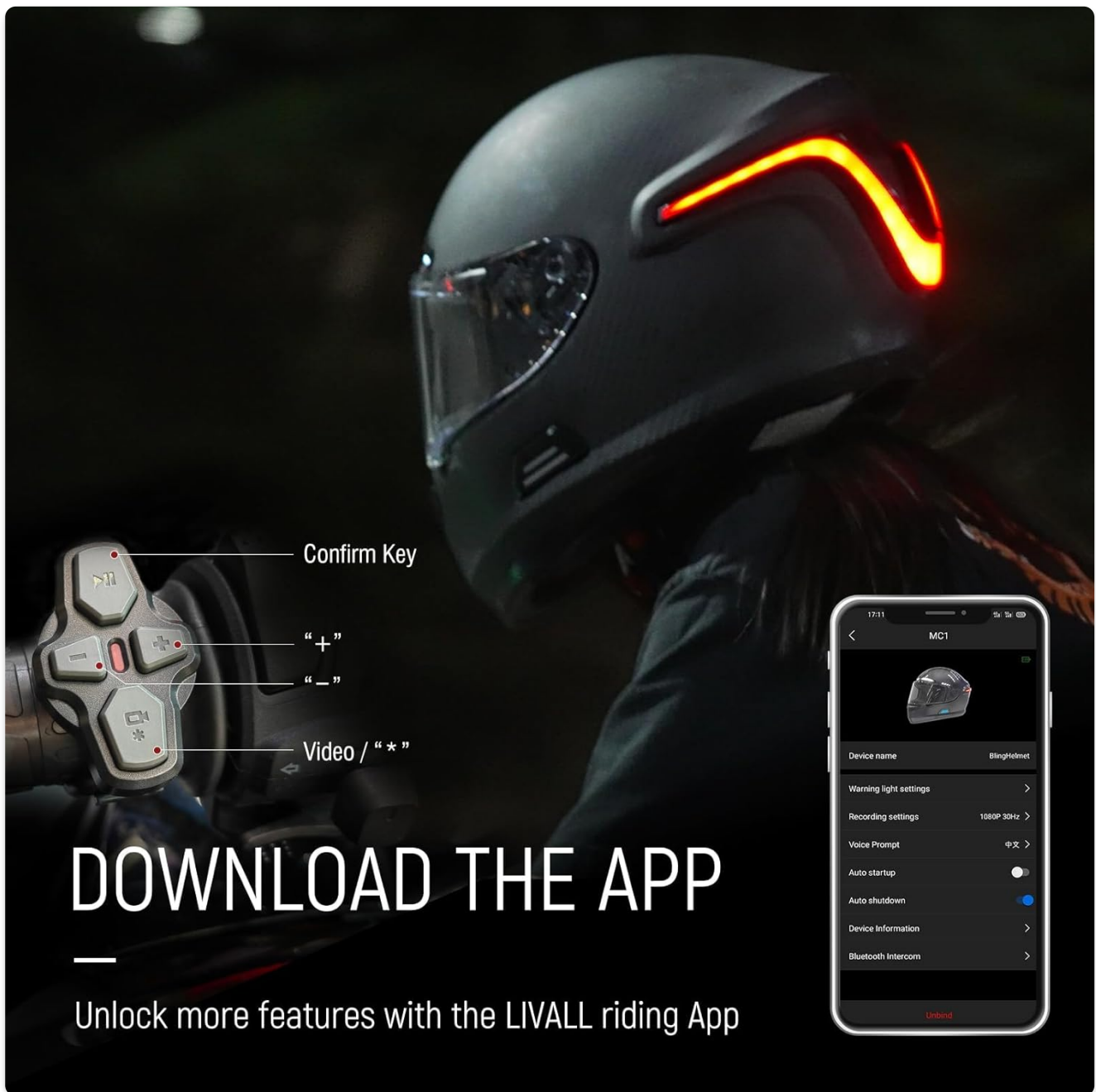
Image: A rider wearing the helmet, with an overlay showing the BR60 remote control and a smartphone displaying the LIVALL Riding App interface, prompting to download the app.