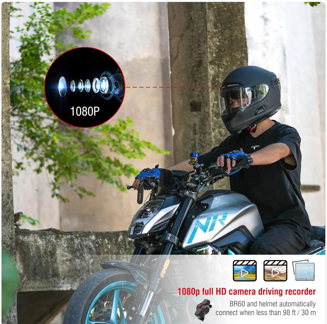
Image: A rider on a motorcycle, with an overlay highlighting the 1080P camera and its recording capabilities, including icons for video recording and a remote control.