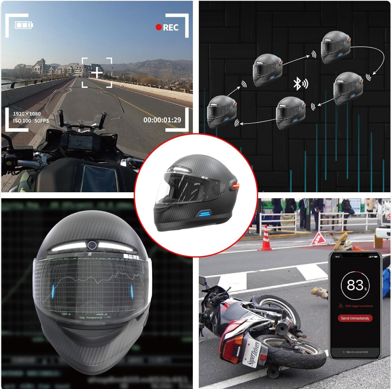
Image: Depicts multiple helmets connected via Bluetooth for intercom communication, alongside an illustration of the SOS alert system.

The integrated Bluetooth intercom allows communication with up to 5 users at a distance of up to 0.75 miles (1.2 km). Ensure all helmets are paired via the LIVALL Riding App for group intercom functionality. Refer to the app's instructions for setting up and managing intercom groups.