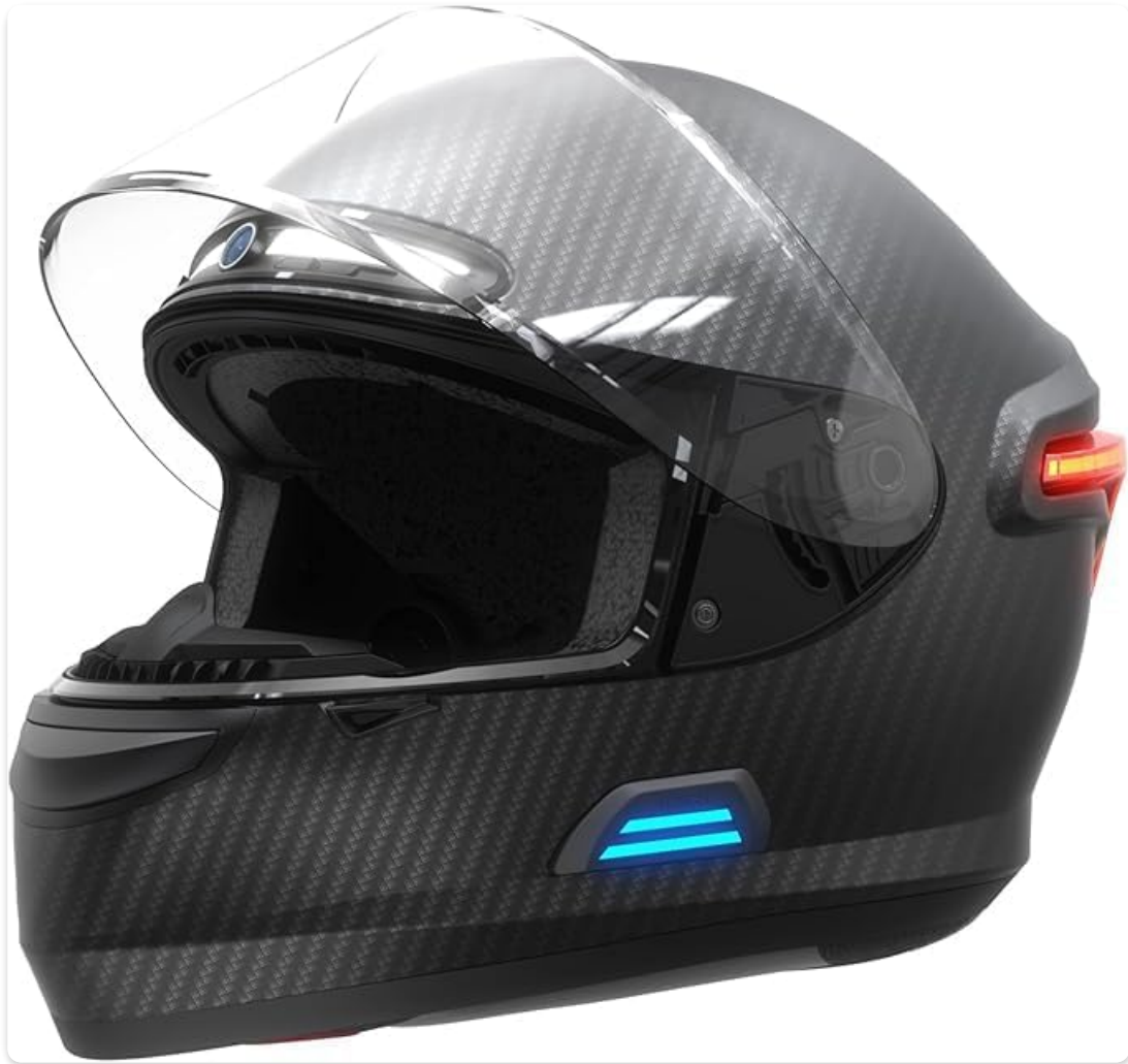
Image: The LIVALL MC1 Pro helmet, showcasing its sleek design and integrated lighting elements.