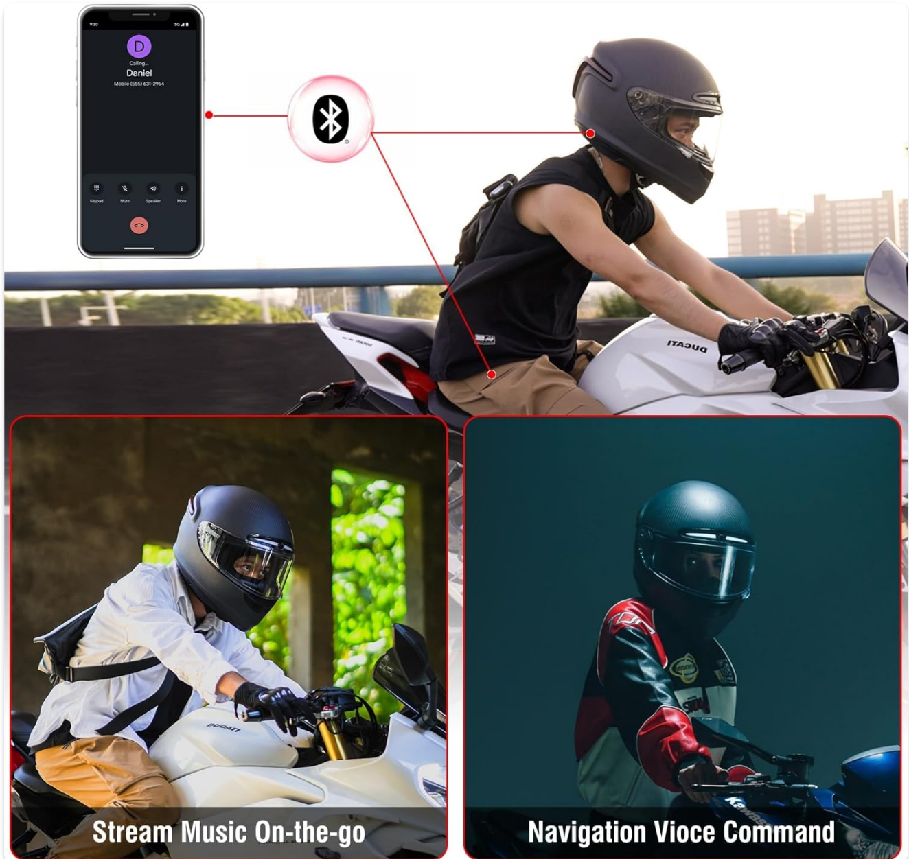
Image: Shows a smartphone connected to the helmet via Bluetooth, illustrating capabilities like streaming music on-the-go and receiving navigation voice commands.