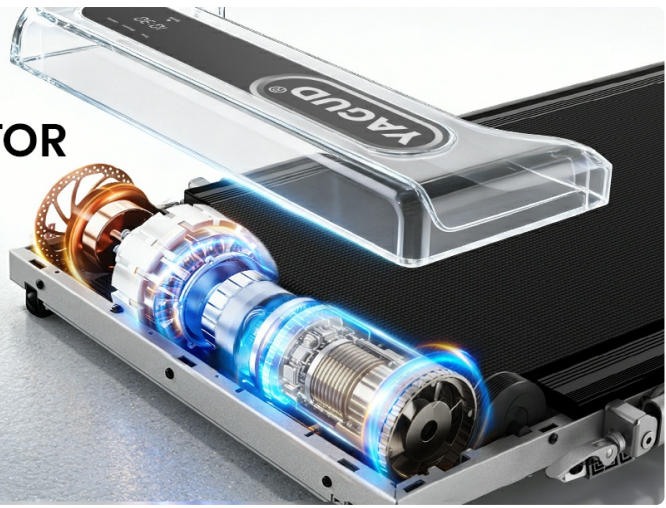
Image: The Yagud Walking Pad features a foldable design for easy movement and storage. It can be easily moved using its transportation wheels and stored under furniture like a sofa or bed.