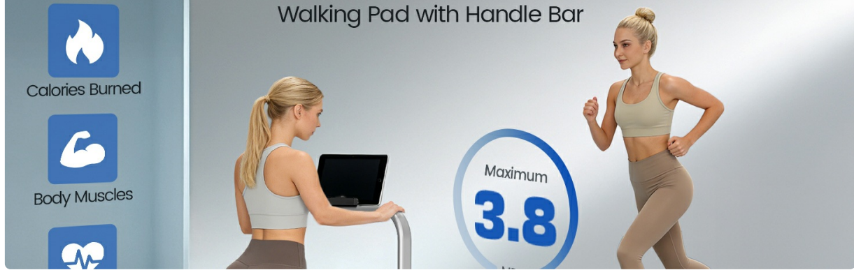
Image: The Yagud Walking Pad features a sturdy safety handle bar for enhanced stability during use. The handle bar is solid, strong load-bearing, and designed for long-lasting durability.