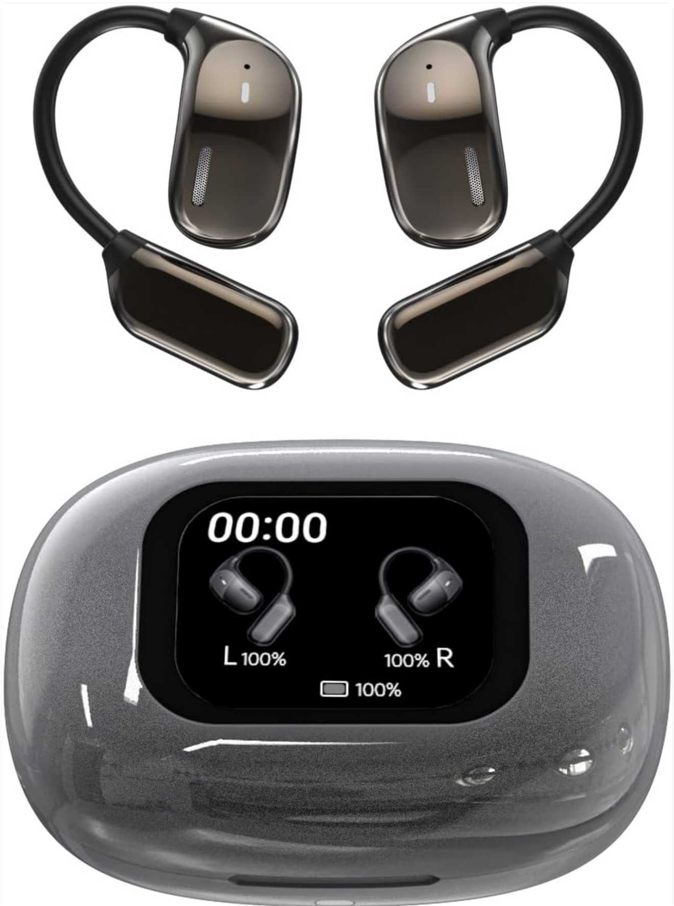
Image: The Yonblow JM16 Translation Earbuds and their smart LED touchscreen charging case, showcasing the sleek design and integrated display.