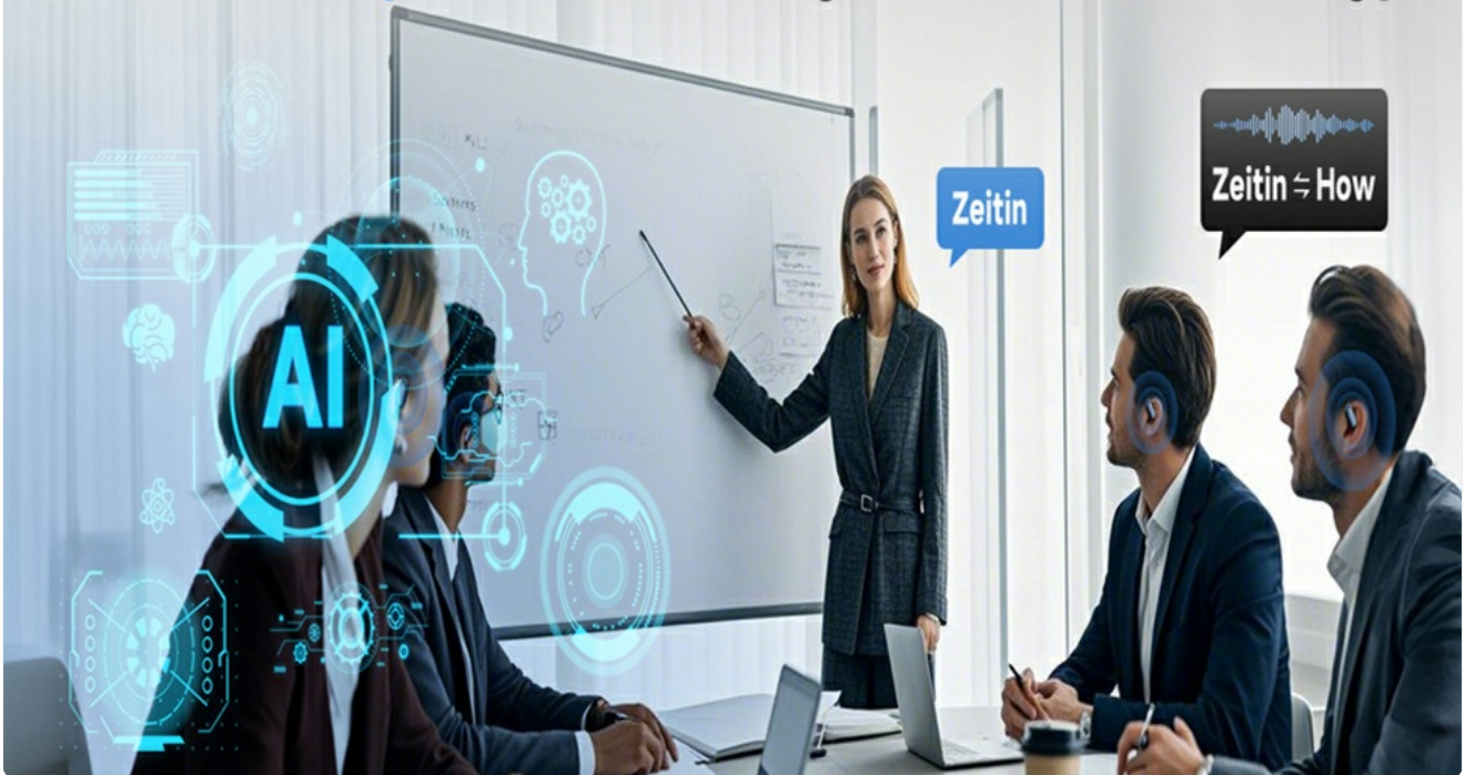
Image: A visual representation of the Revolutionary AI Semantic Segmentation Technology, showing real-time processing of speech for instant translation in a meeting setting.