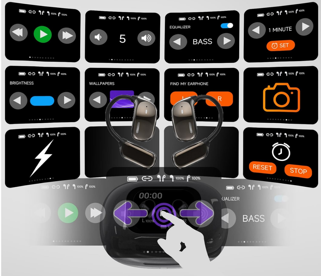
Image: A detailed view of the multifunctional one-touch control interface on the LED full-color touchscreen, showing various customizable options like equalizer, brightness, and find-my-earbuds.

LED Full-Color Touchscreen with Customizable Interfaces for an Enhanced Experience