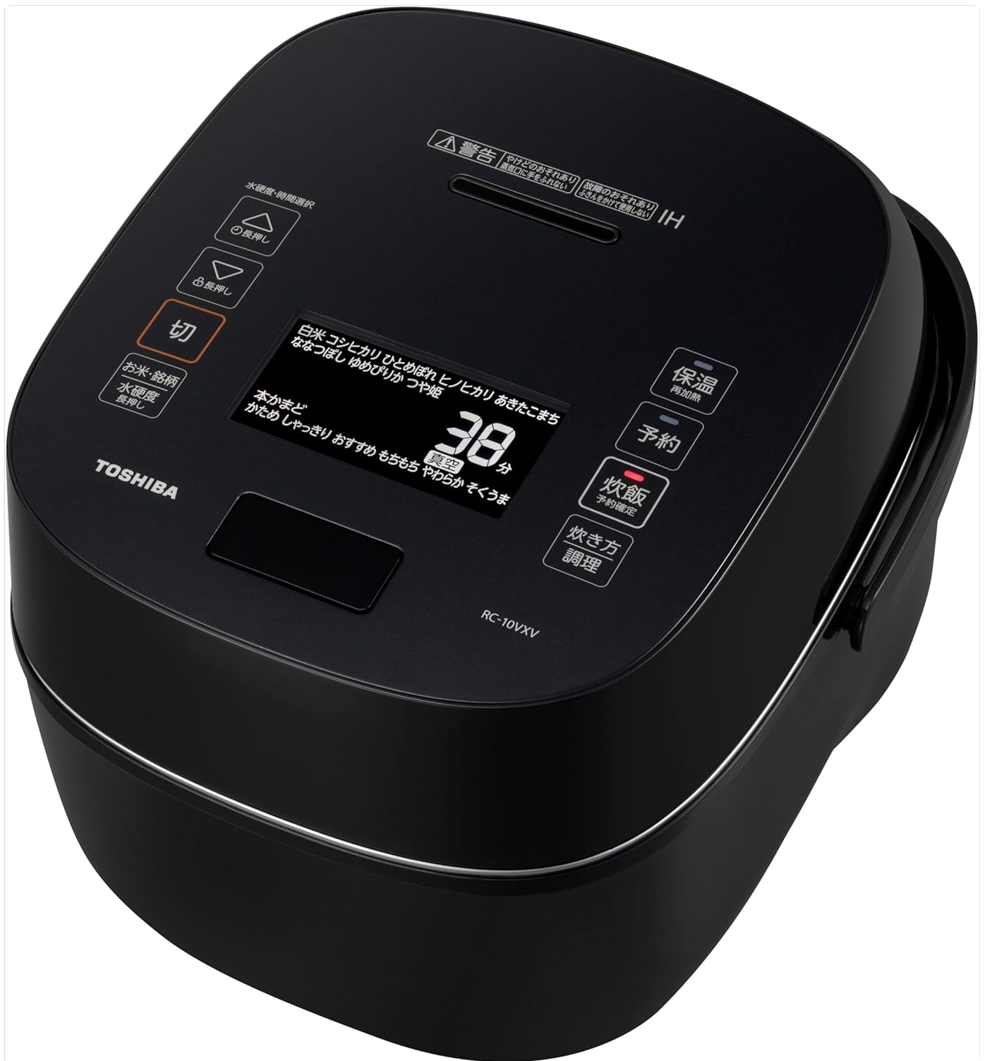
Figure 1: Front view of the TOSHIBA RC-10VXV Rice Cooker.