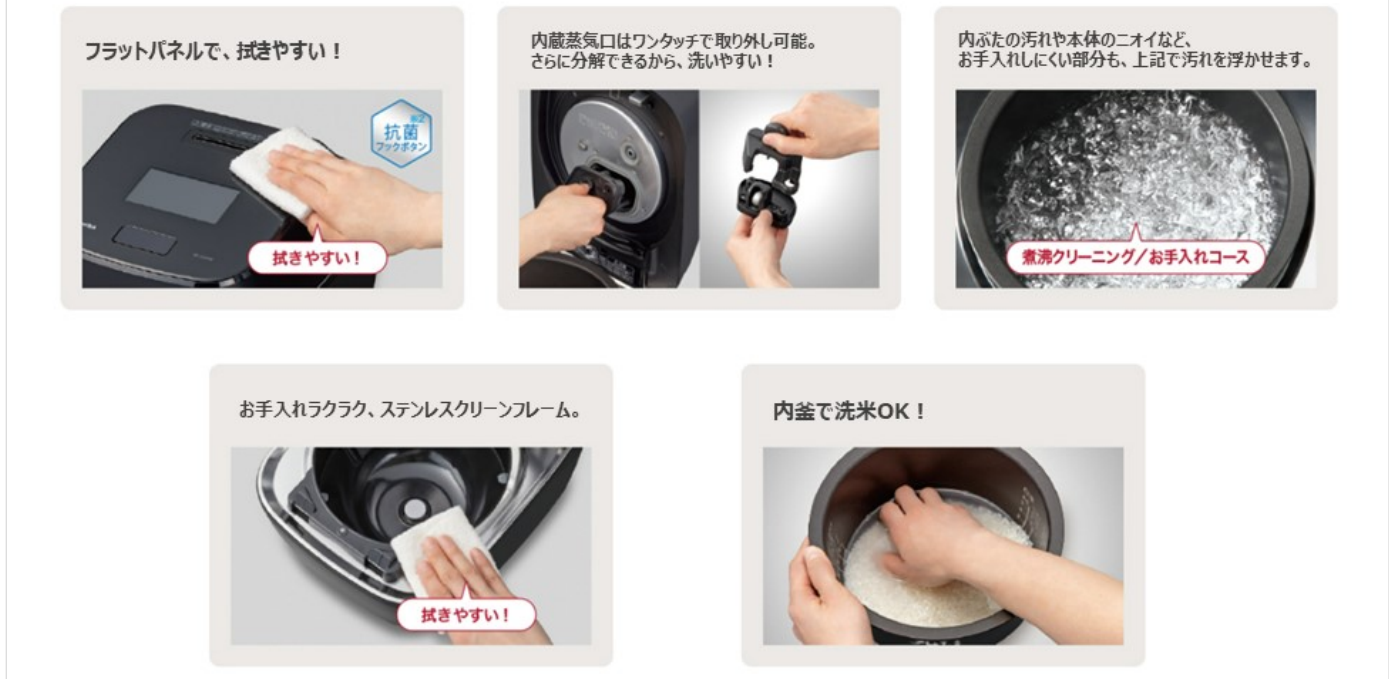
Figure 6: Easy cleaning steps for the inner lid and main unit.