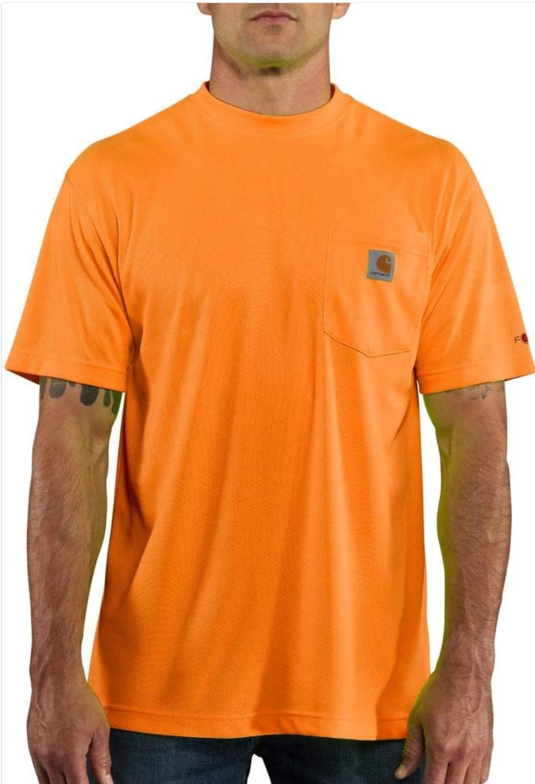
Figure 1: Carhartt Men's 100493 Force® Color Enhanced Short Sleeve T-Shirt in Brite Orange.