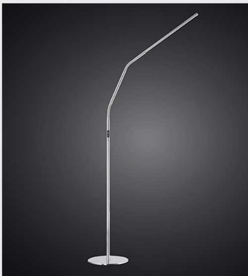
Original Brushed Steel

The Slimline 4™ is the latest evolution in our lighting series. Built on the success of the Slimline 3, it offers enhanced functionality, superior design, and exciting new color options.