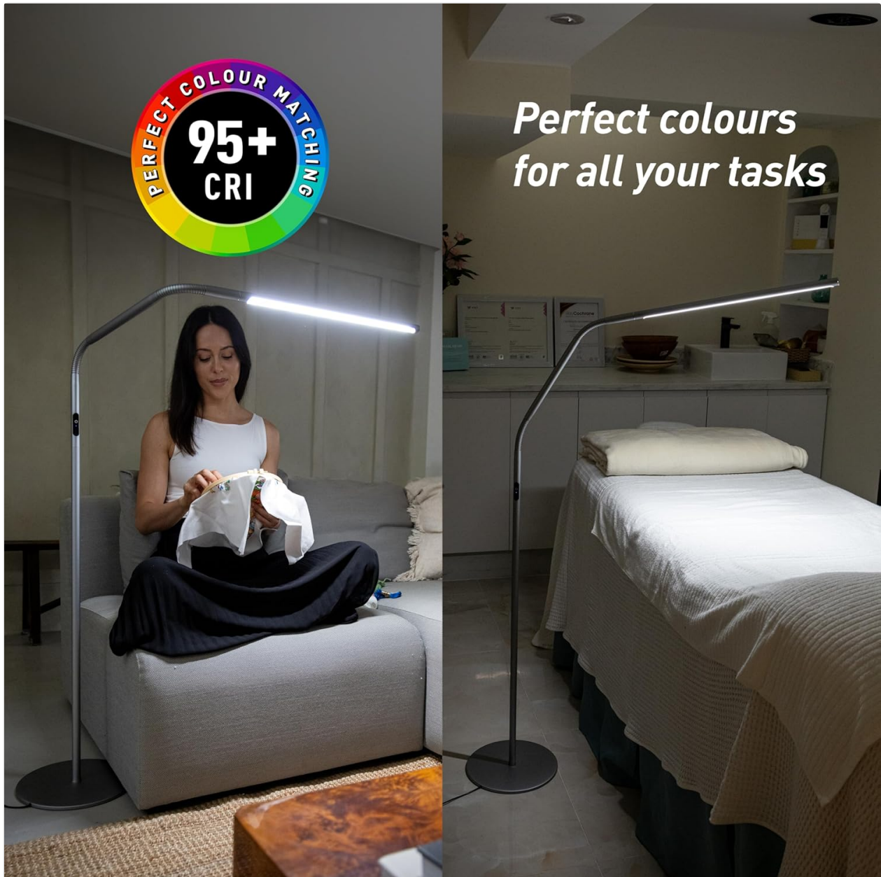
Image: The Slimline 4 lamp providing optimal lighting for detailed tasks like crafting and professional salon work.