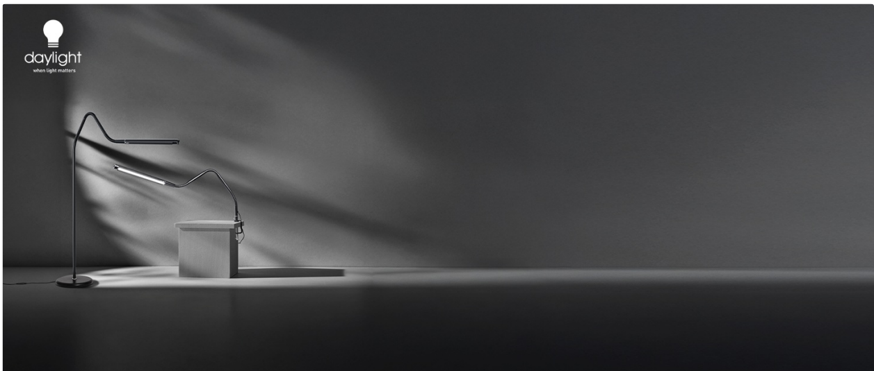
Image: The Slimline 4 LED Floor Lamp in Ice Grey, showcasing its sleek design and bright illumination.

The Slimline 4 LED Floor Lamp is designed to provide high-quality, natural daylight illumination for various tasks, including crafting, reading, and detailed work. It features adjustable brightness, a flexible design, and a convenient USB-C charging port.