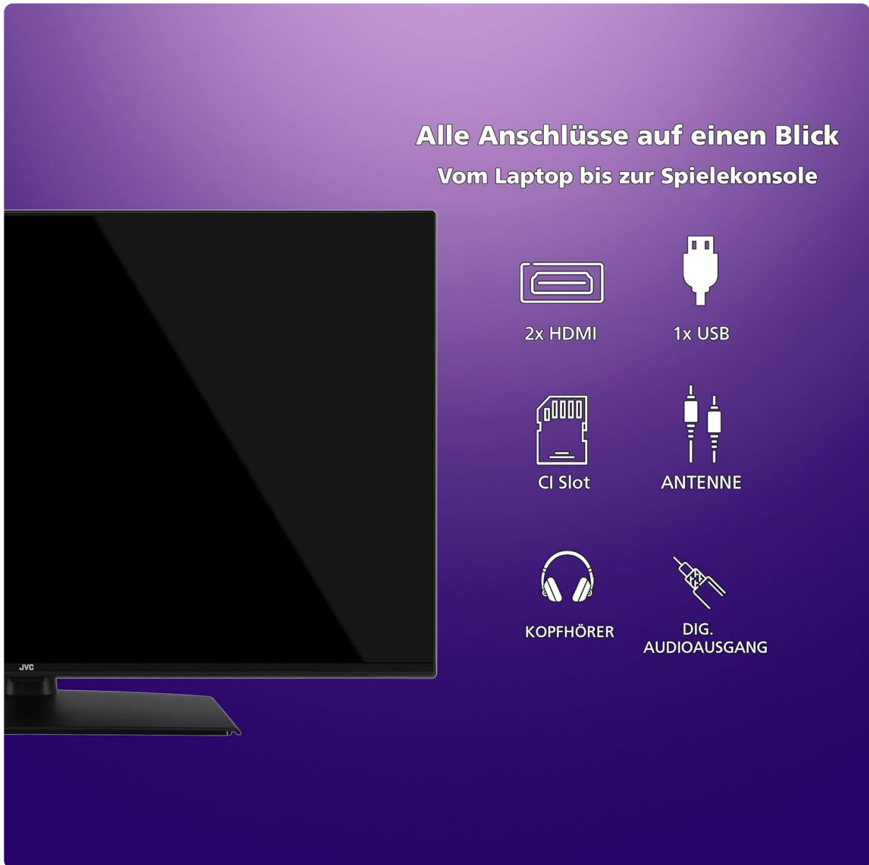
Figure 4: All Connections at a Glance

This image illustrates the available ports on the JVC LT-40VF4455, including HDMI, USB, CI slot, antenna input, headphone jack, and digital audio output.