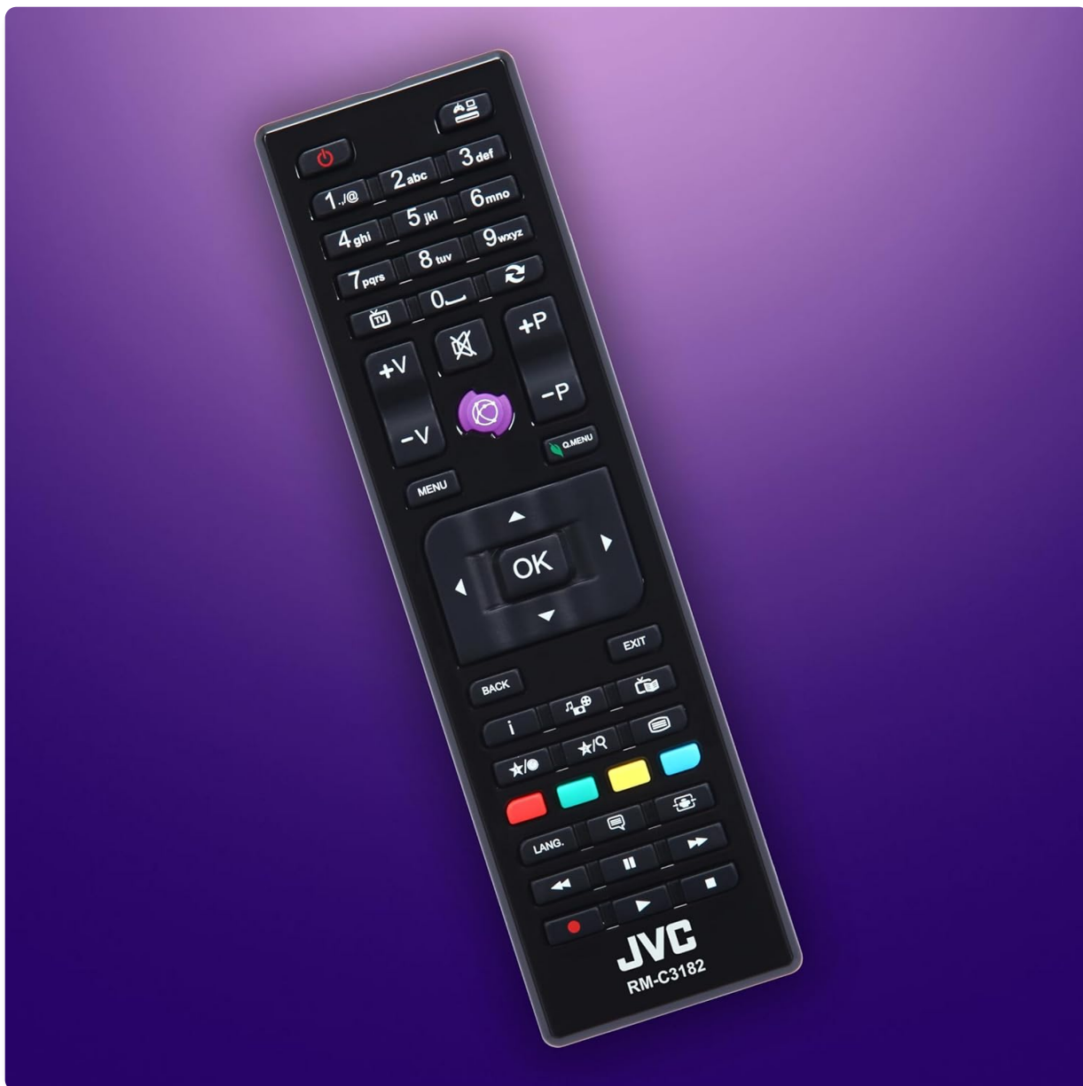
Figure 5: JVC RM-C3182 Remote Control

The included remote control allows you to operate all functions of your television. It comes with 2 AAA batteries already included.