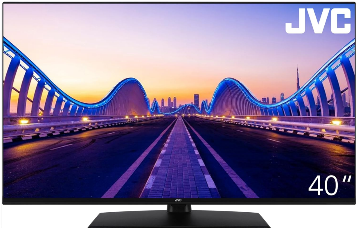
Figure 1: JVC LT-40VF4455 Full HD 40-inch Television

This manual provides comprehensive instructions for the setup, operation, maintenance, and troubleshooting of your JVC LT-40VF4455 Full HD 40-inch LED Television. Please read this manual carefully before using your television to ensure proper and safe operation.