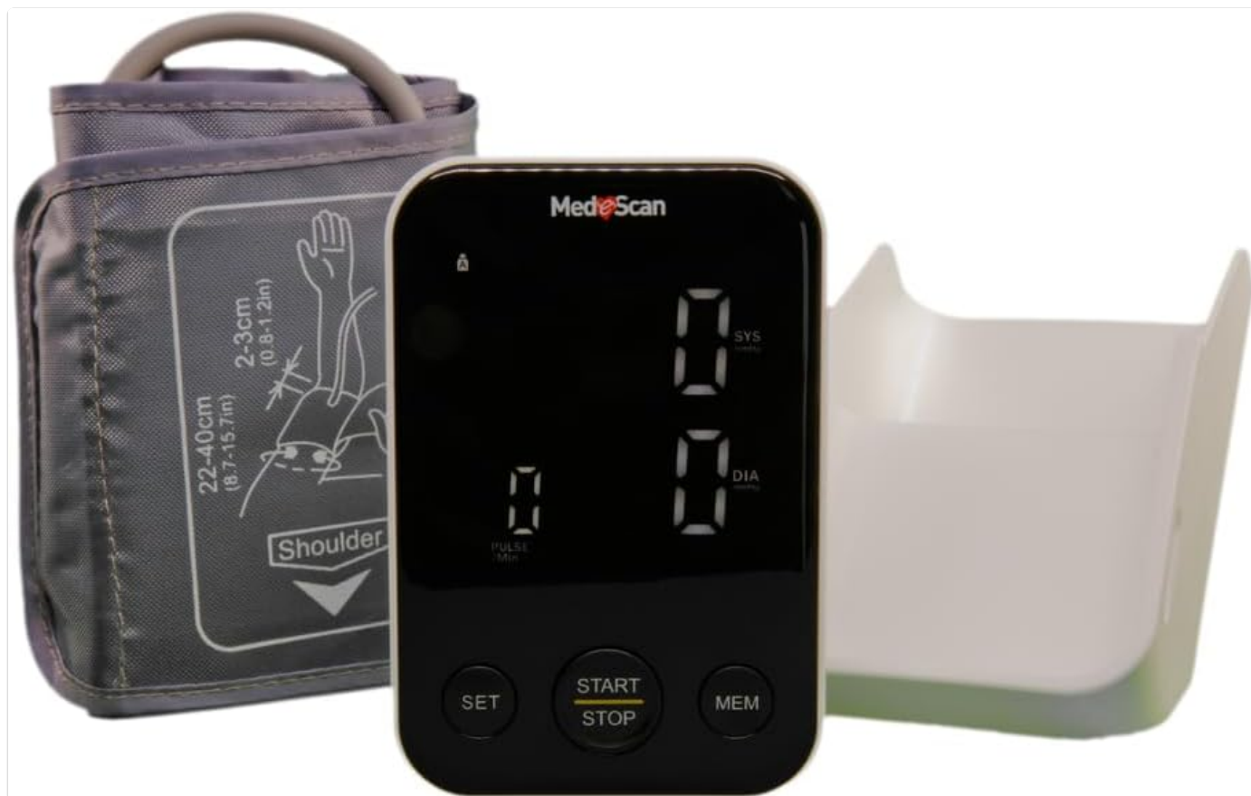
Image: The MedeScan Blood Pressure Monitor, arm cuff, and power adapter laid out, showing the complete package contents.