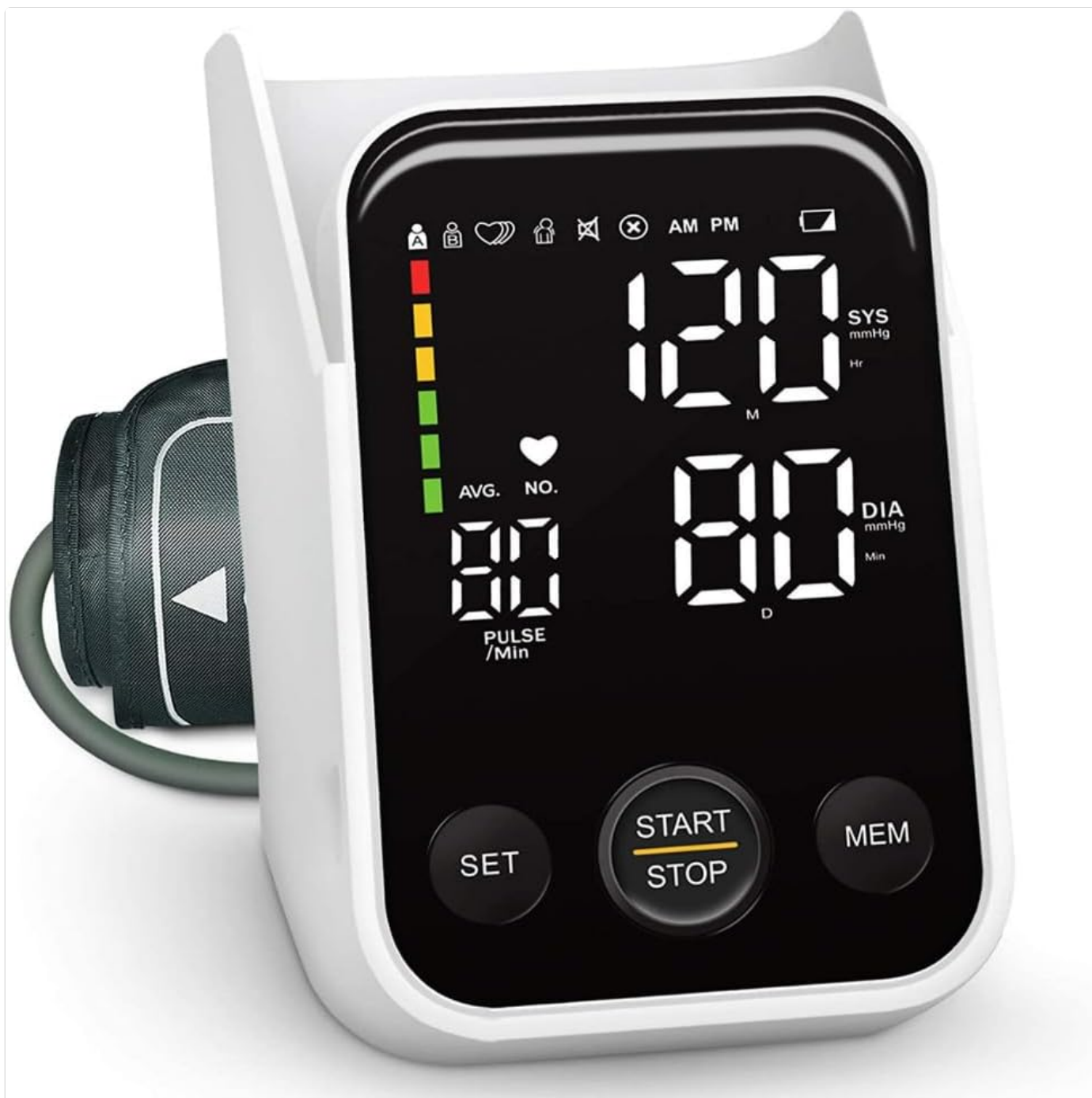
Image: The MedeScan Smart Talking Blood Pressure Monitor with its digital display showing blood pressure and pulse readings, and control buttons.