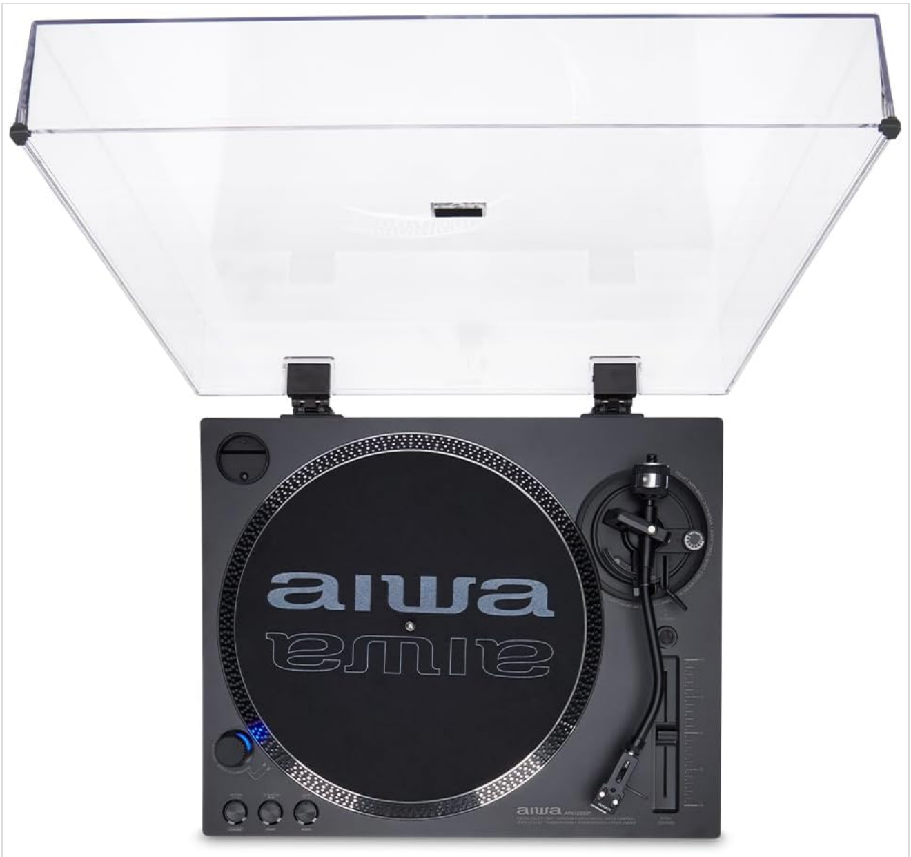
Image: A detailed view of the turntable's S-shaped tonearm, cartridge, and various control knobs, highlighting the precision components.

5. Set the anti-skate dial to a value corresponding to the tracking force.