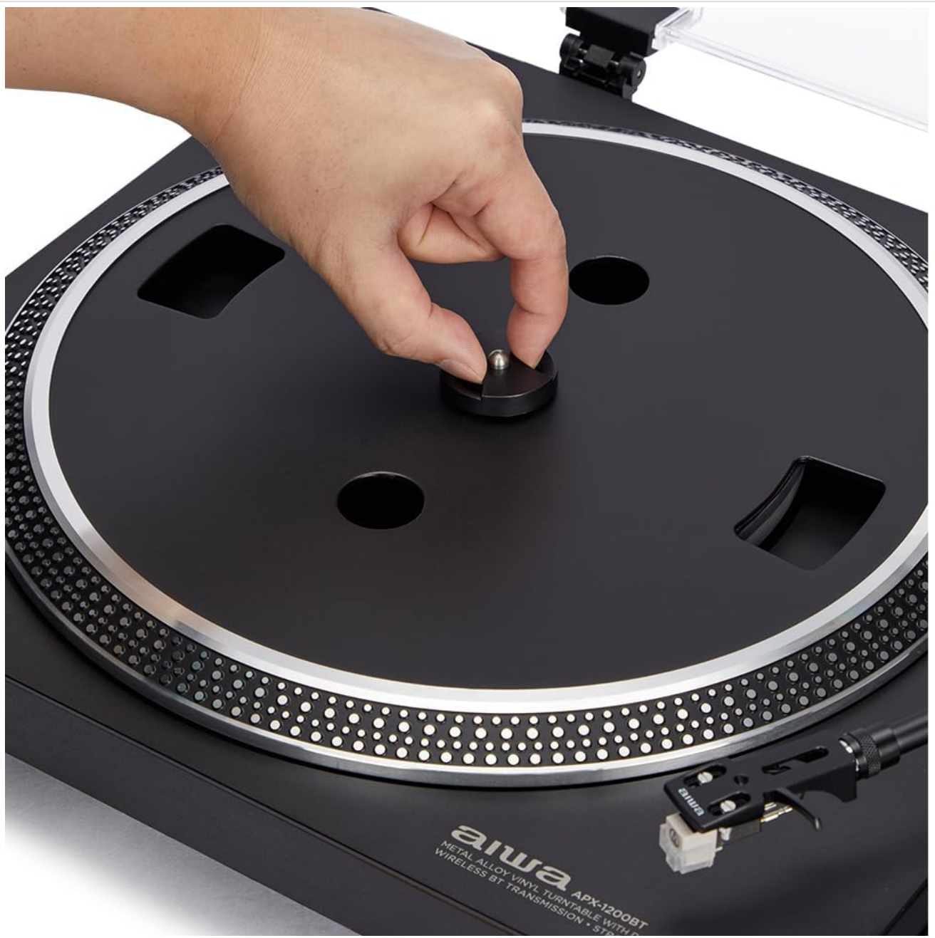
Image: A hand is shown carefully placing a component onto the turntable's aluminum platter, illustrating part of the assembly process.