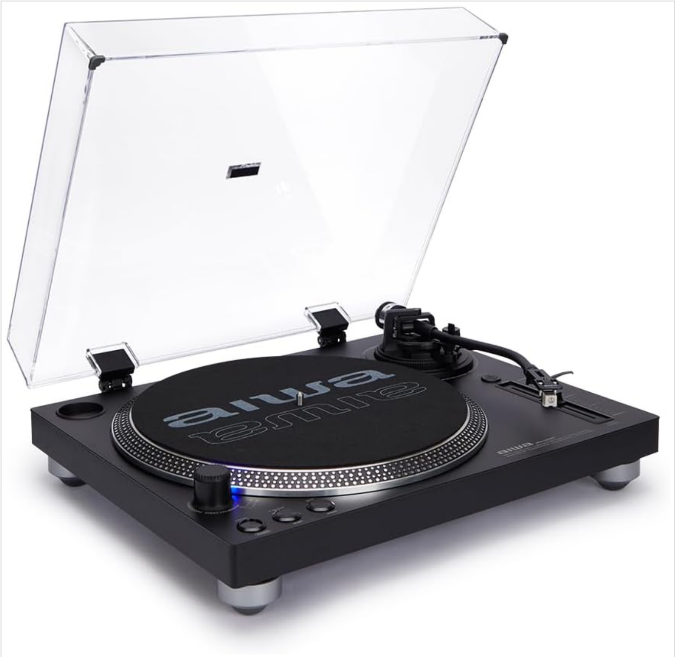
Image: The AIWA APX-1200BT turntable with its dust cover open, showcasing the platter, tonearm, and controls.