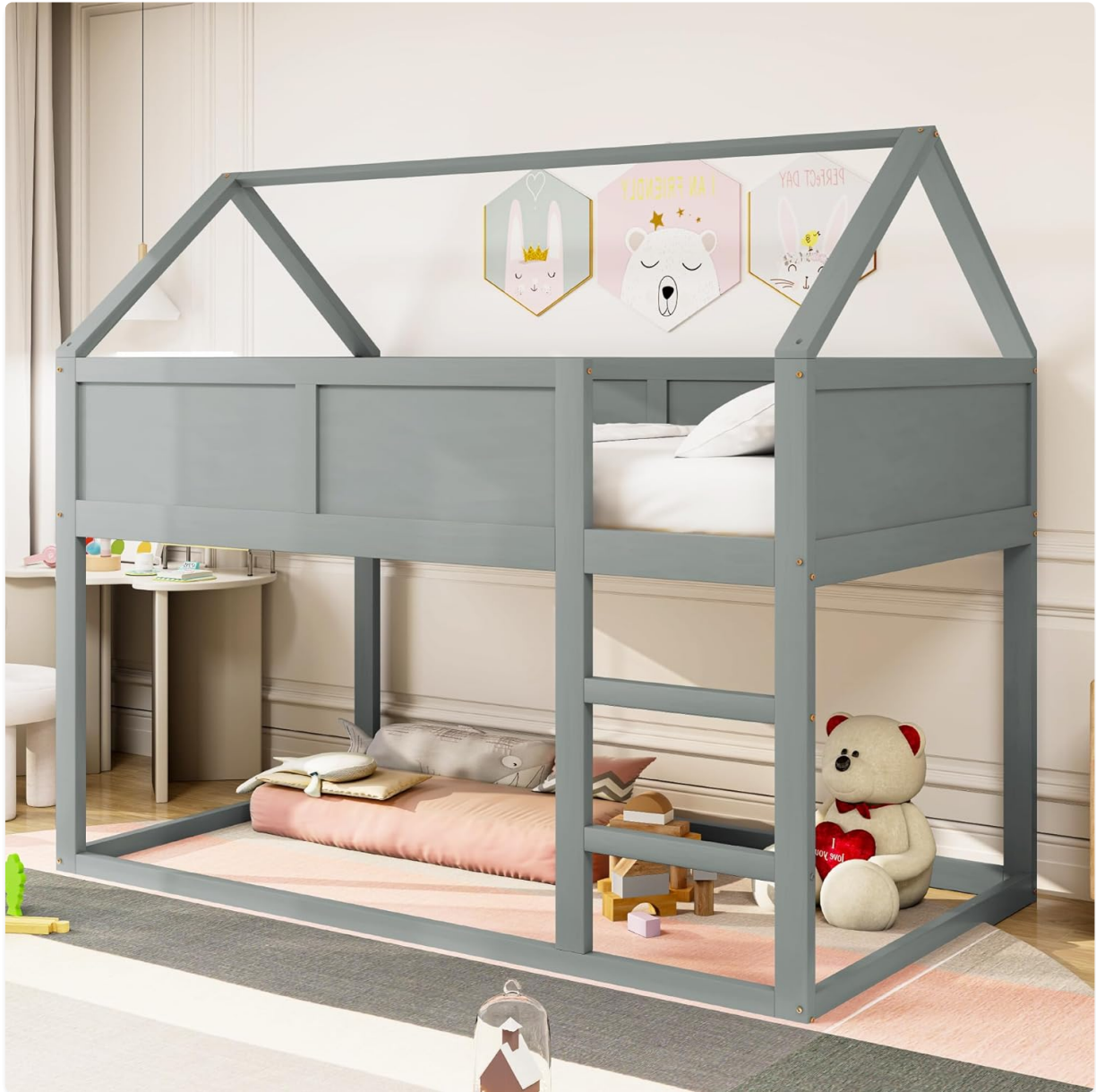
A side view of the Moimhear Low Bunk Bed, showcasing the low profile of the bottom bed and the height of the upper bunk, along with the ladder.