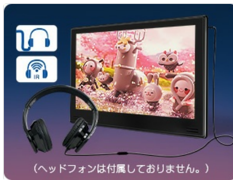
Image: Icons indicating support for both wired and infrared (IR) headphones.