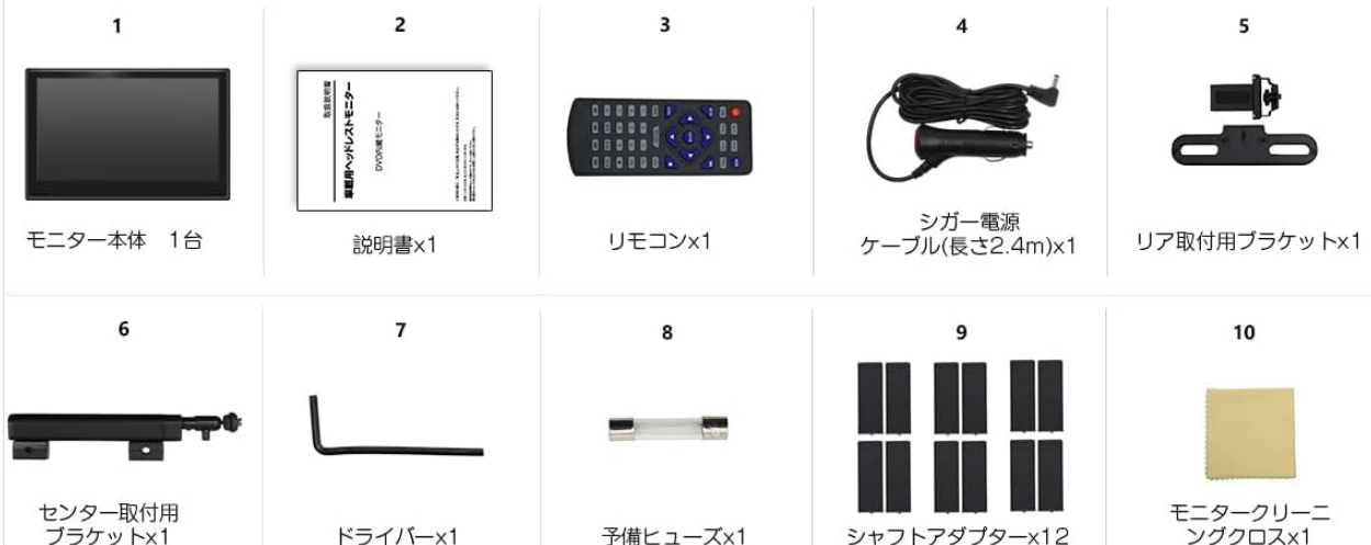
Image: All included accessories for the Eonon L0328J monitor.