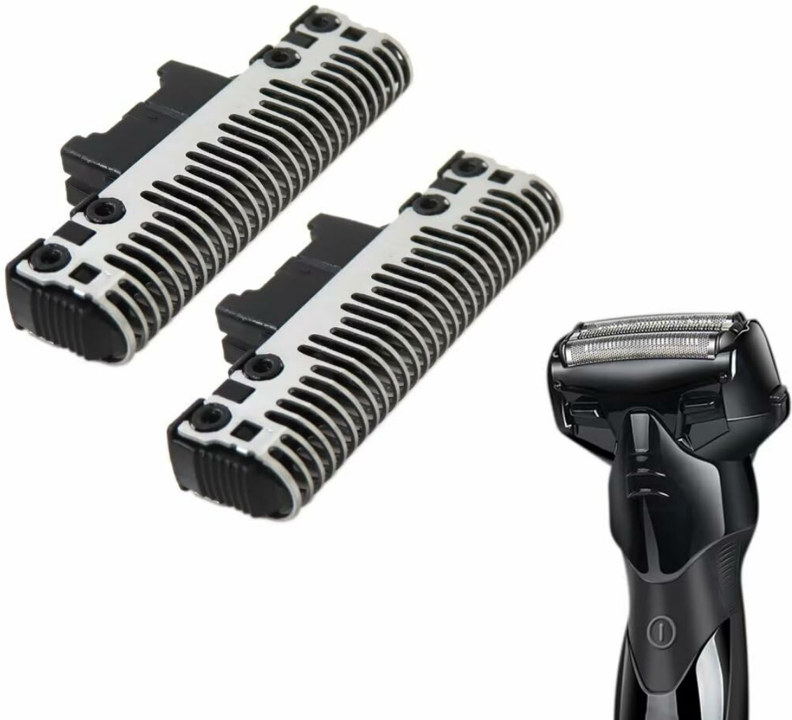
Image: Replacement blades shown with a compatible Panasonic shaver model.

For PANASONIC ES762 ES765 ES766 ES882 ES8951 WES9077P WES9075P