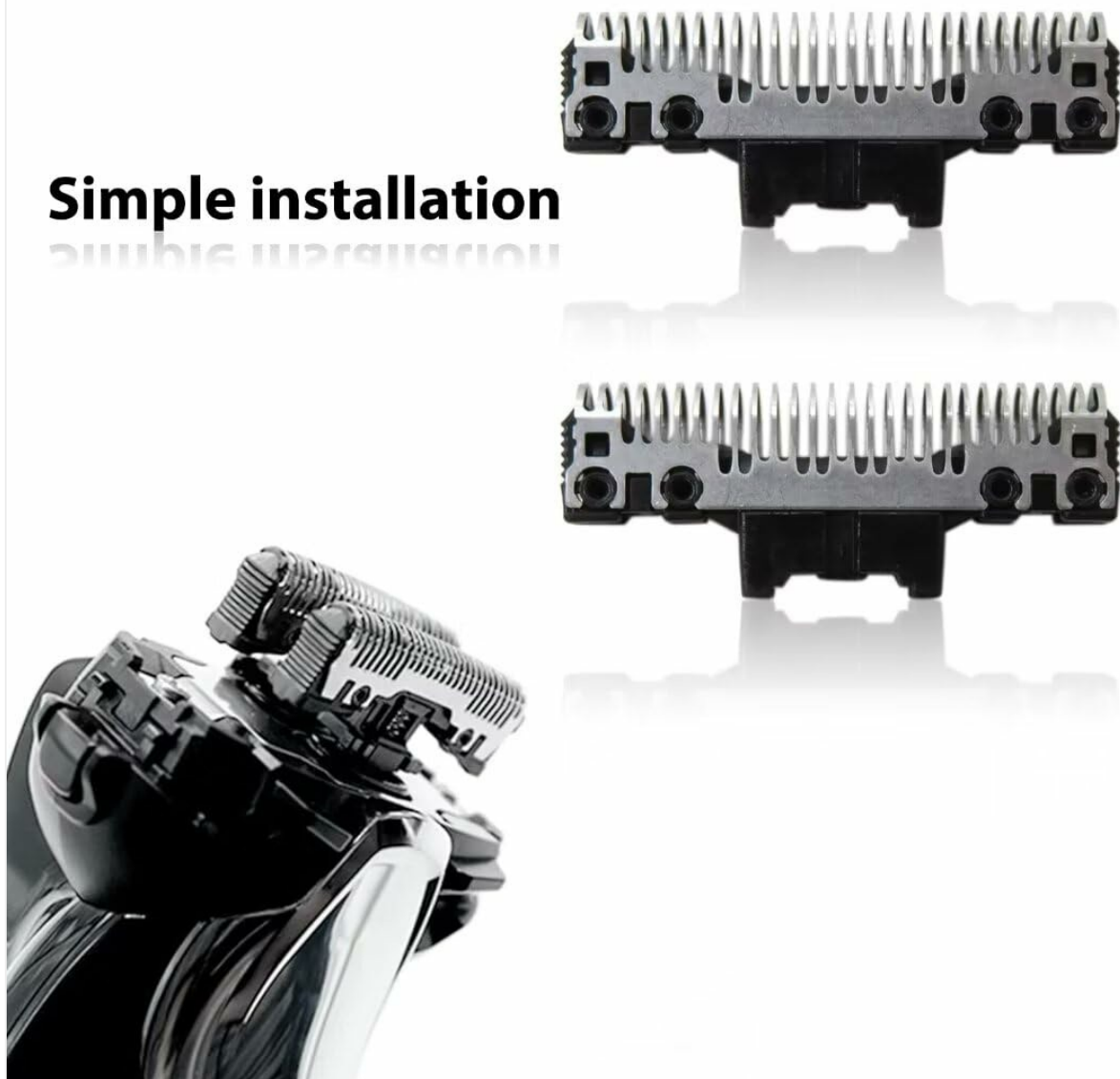
Image: Top view of the two replacement shaver blades included in the package.