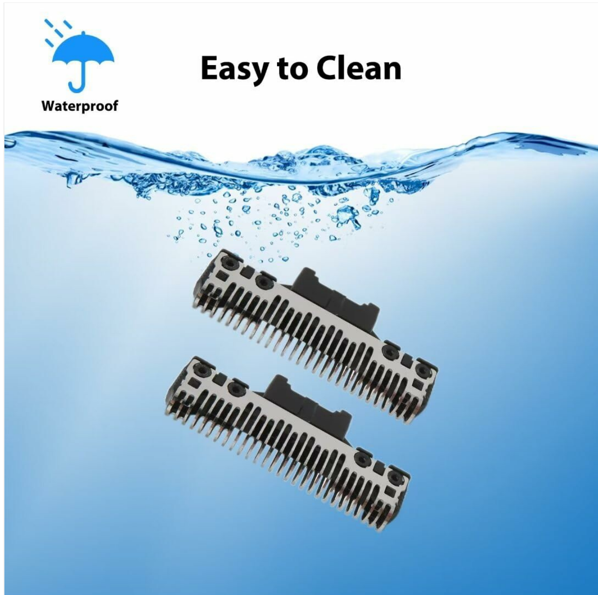
Image: The replacement blades are designed for easy cleaning, often under running water.