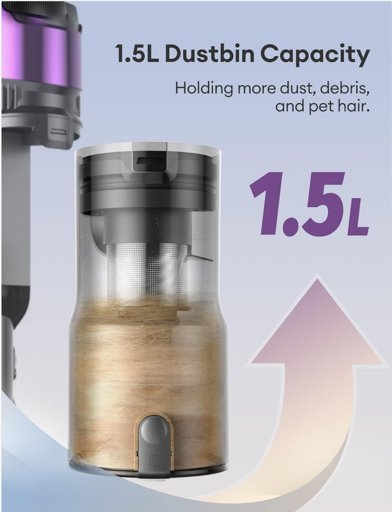
Image: An illustration highlighting the large 1.5L dustbin capacity of the Ultenic U20, designed to hold more debris.