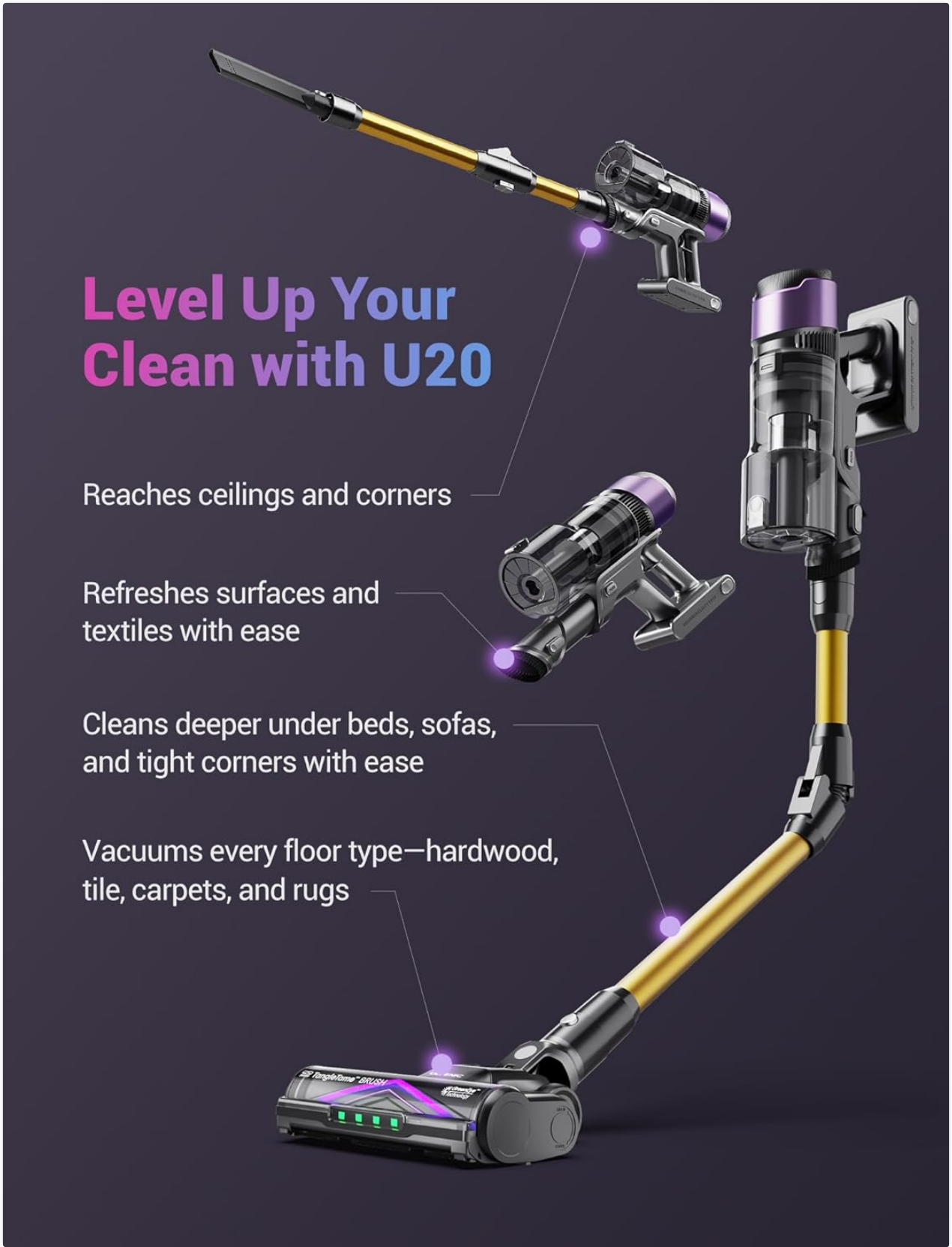
Image: The Ultenic U20 shown in its full upright configuration, as a handheld unit with a crevice tool, and with the flexible wand for under-furniture cleaning.

Vacuums every floor type—hardwood, tile, carpets, and rugs