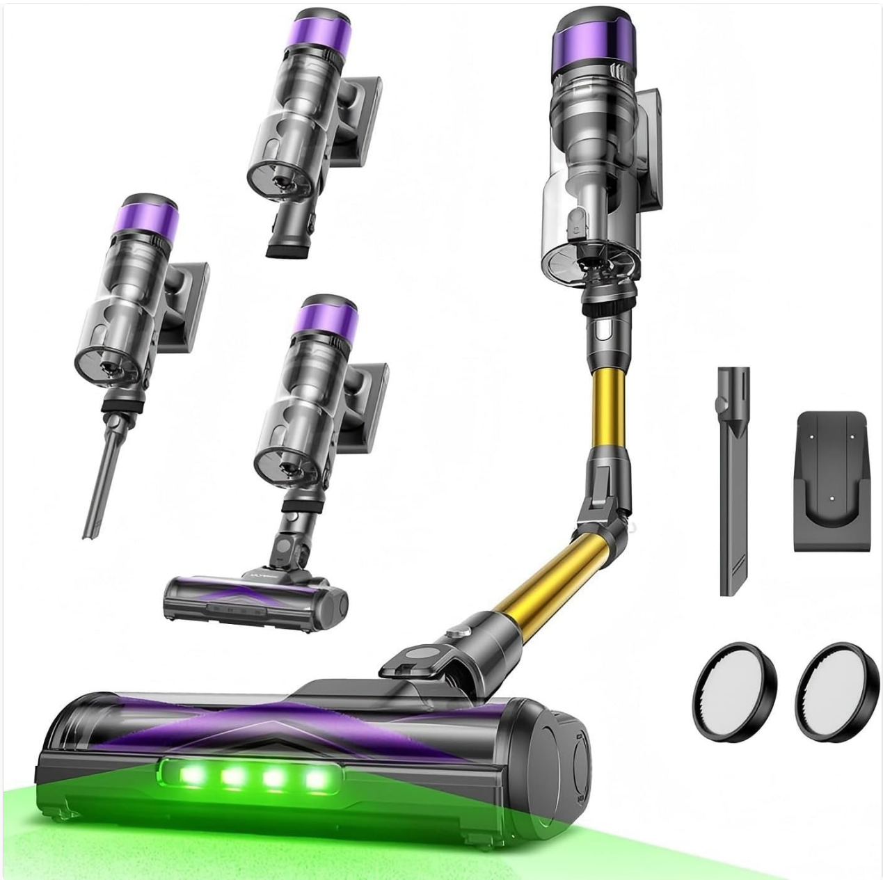
Image: All components of the Ultenic U20 Cordless Vacuum Cleaner, including the main unit, flexible wand, floor brush, and various attachments.