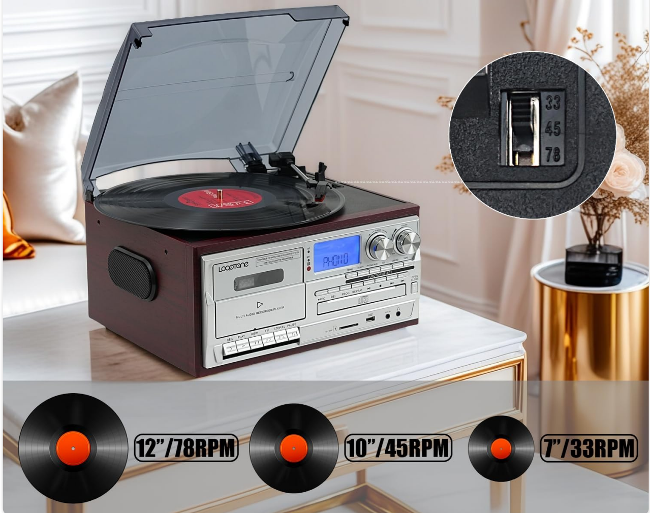
Image: A close-up of the turntable showing the 3-speed selector switch (33, 45, 78 RPM) and examples of 7", 10", and 12" vinyl records.