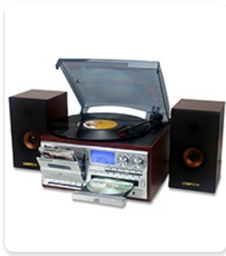
Image: A diagram illustrating the cassette player's capabilities: Supports Type I, II, III, IV tapes, complete buttons for fast-forward and rewind, and recording functionality.