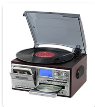
Image: A diagram illustrating the turntable's capabilities: 3 size vinyl (12"/10"/7"), 3 speed select (33 1/3 / 45 / 77 RPM), and automatic start and stop.