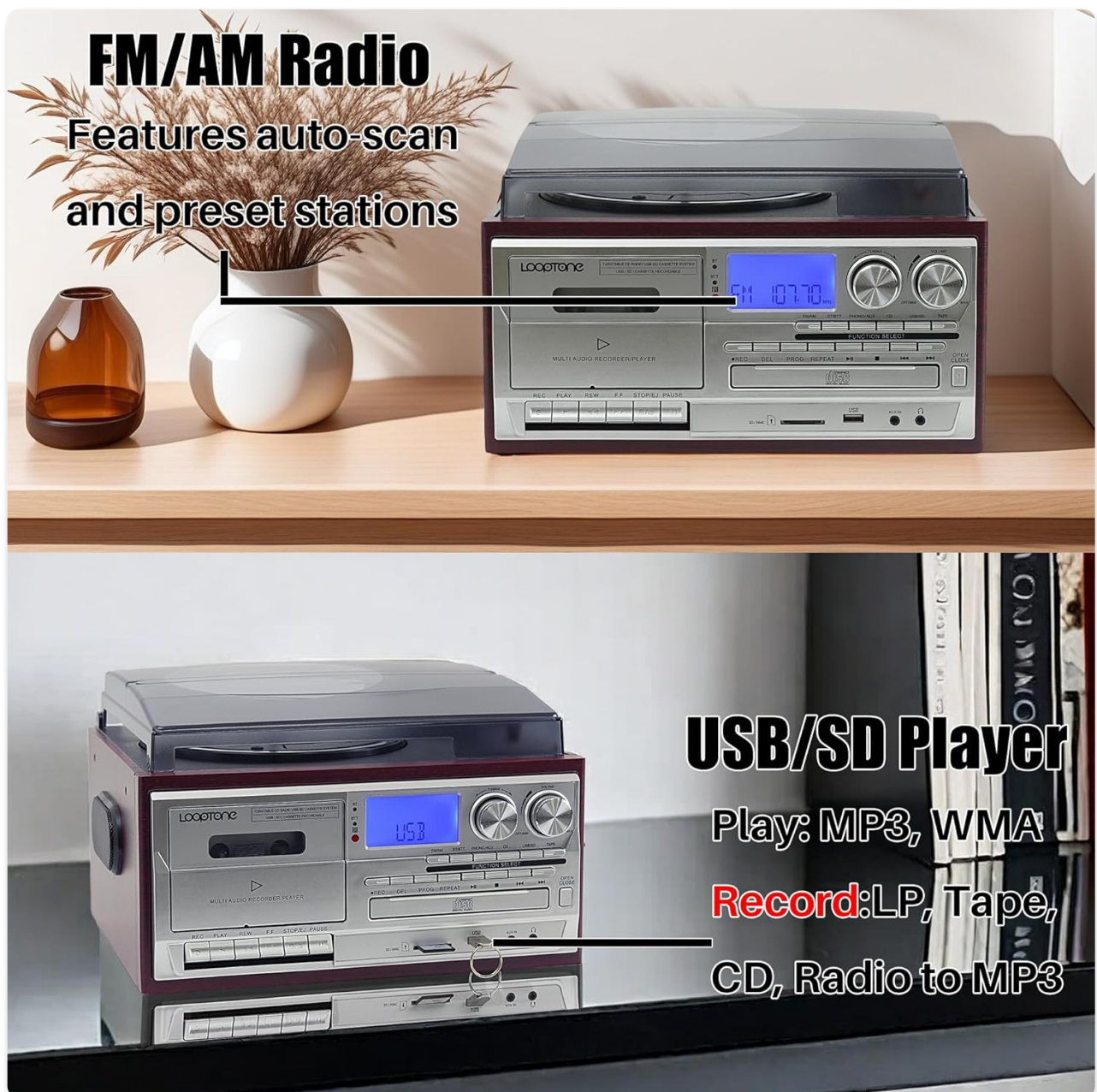
Image: The record player displaying an FM radio frequency on its digital screen, with text indicating FM/AM Radio features and