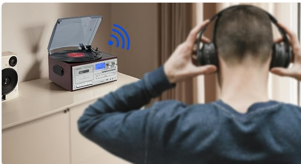
Image: A person wearing headphones, with blue wireless signals indicating a Bluetooth connection from the record player to the headphones, demonstrating private listening.