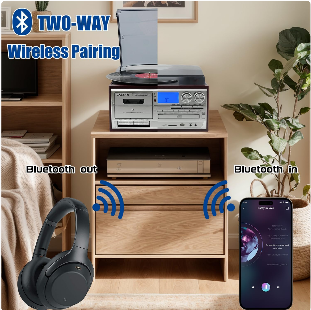
Image: An illustration demonstrating the two-way wireless Bluetooth pairing, showing the record player connecting to both Bluetooth headphones (output) and a smartphone (input).