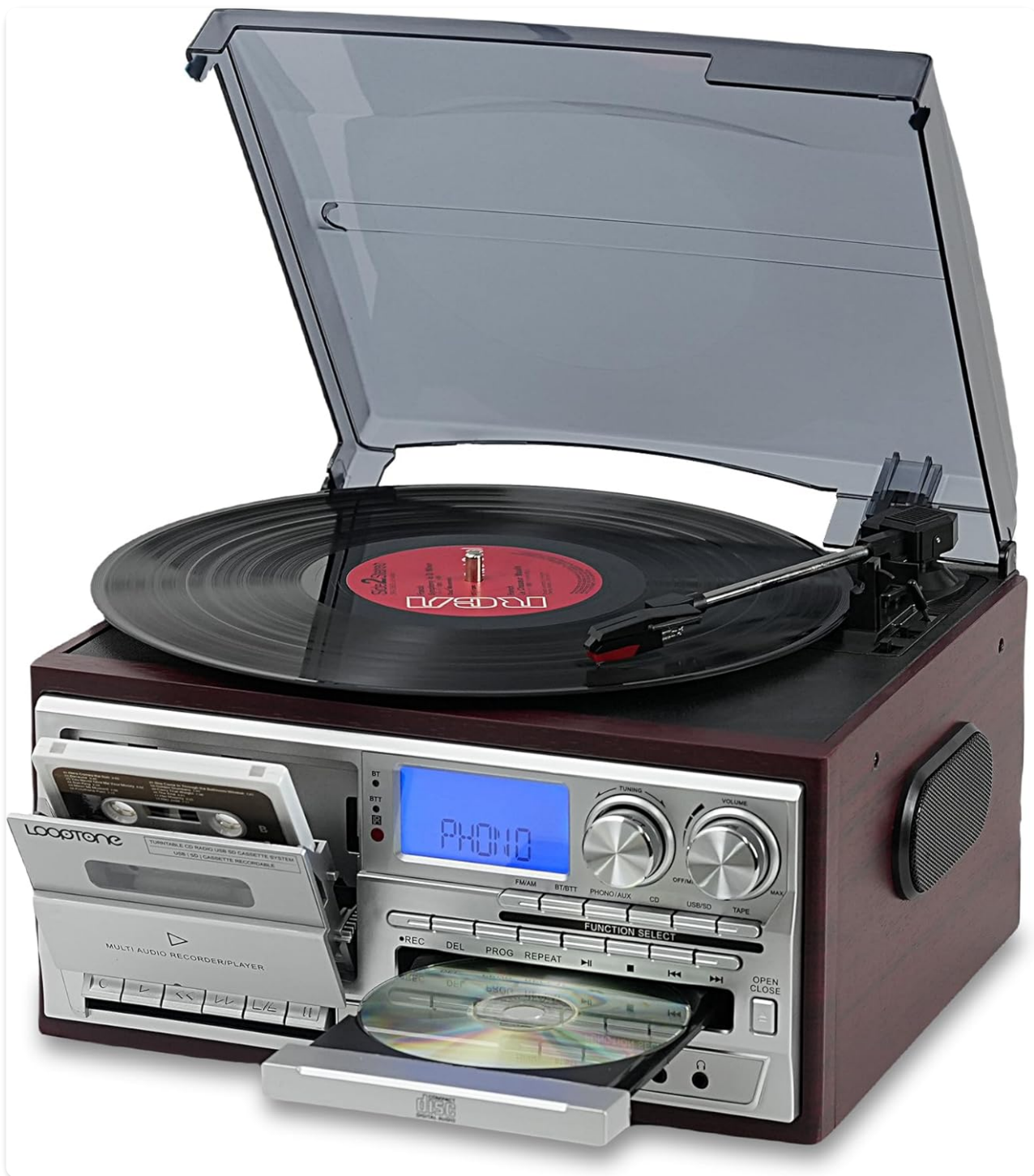
Image: The LoopTone 10-in-1 Vinyl Record Player, showcasing its multi-functional design with a record on the turntable, cassette deck, and CD tray visible.