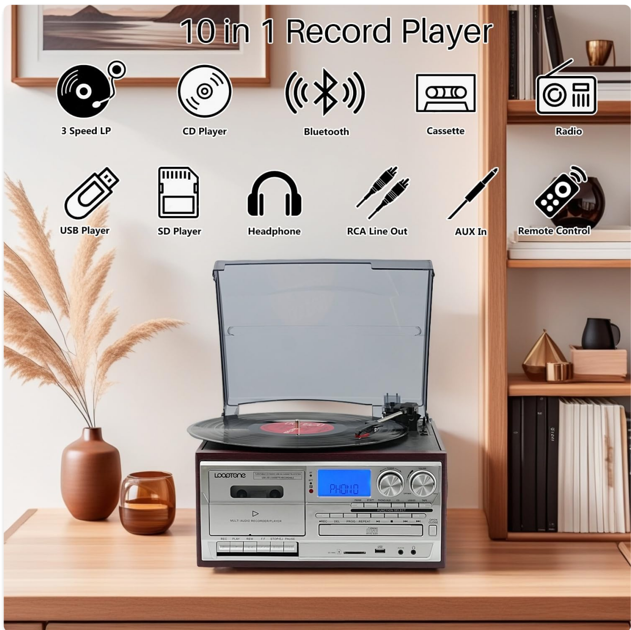
Image: An infographic highlighting the 10-in-1 features of the record player, including 3-speed LP, CD Player, Bluetooth, Cassette, Radio, USB Player, SD Player, Headphone, RCA Line Out, and AUX In.