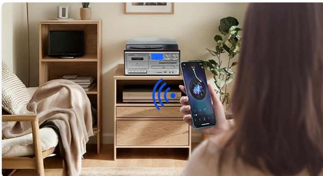
Image: A person holding a smartphone, with blue wireless signals indicating a Bluetooth connection to the record player, demonstrating audio streaming from the phone.