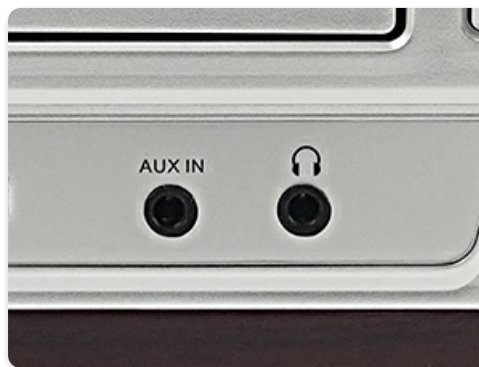
Image: A close-up view of the front panel showing the 3.5mm AUX IN port and the headphone jack.