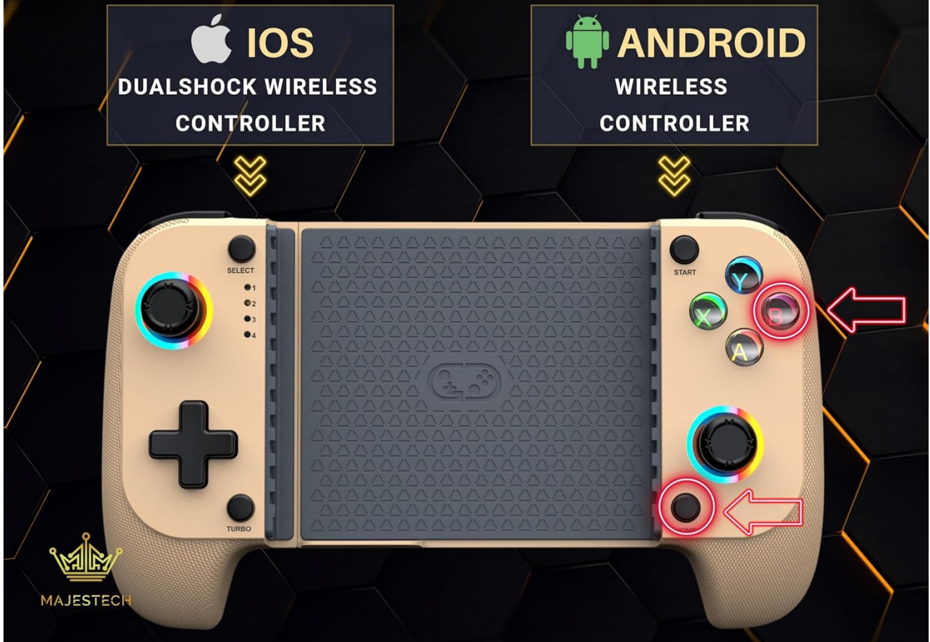
Figure 3.2: Visual guide for Bluetooth pairing, showing the [B] and [HOME] buttons to press for connection on both iOS and Android devices.

Simultaneously press [B] and [HOME] and connect with the corresponding Bluetooth name