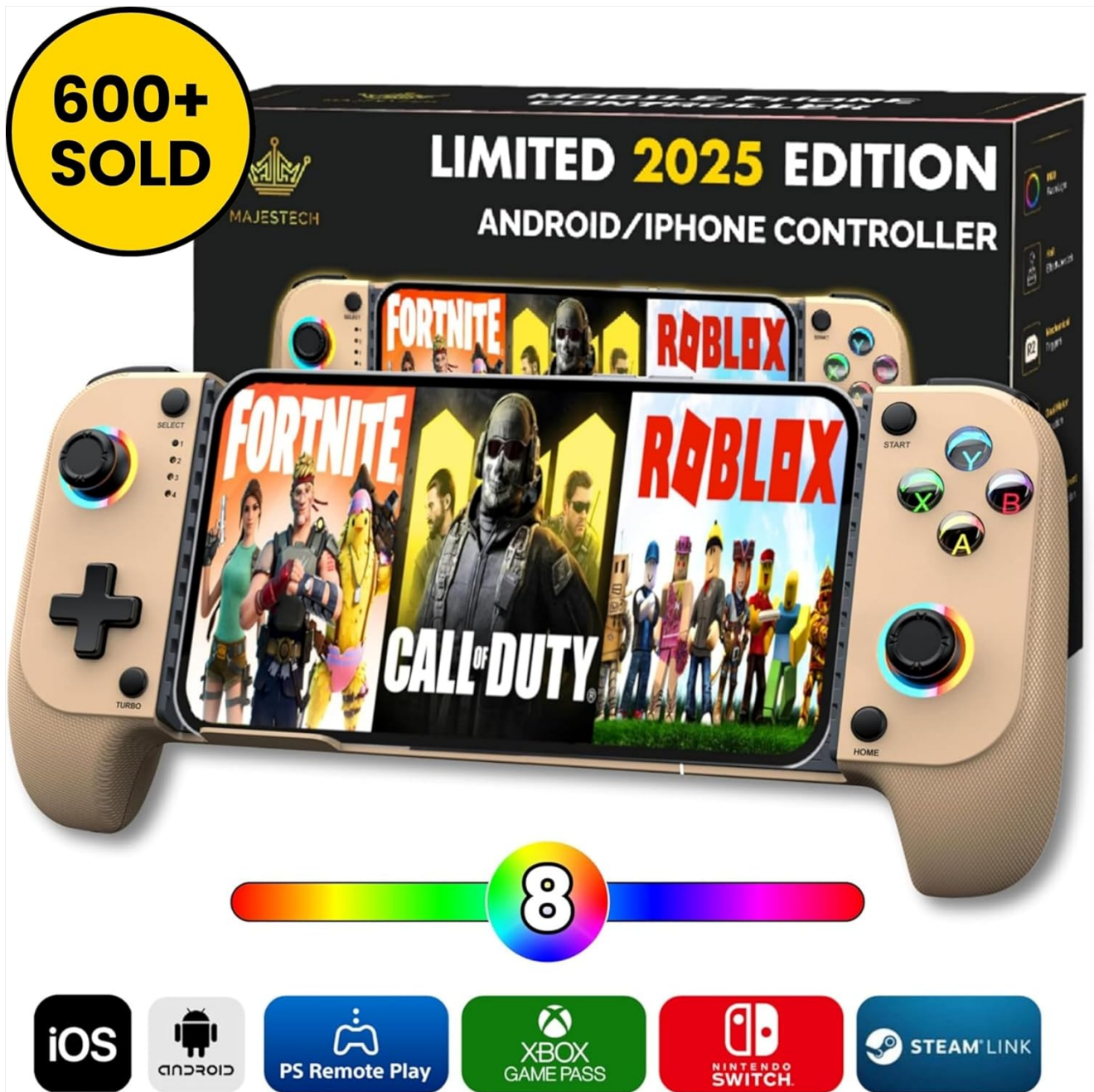
Figure 2.3: The MAJESTECH Mobile Gaming Controller with a smartphone inserted, showcasing its design and compatibility with various game titles.