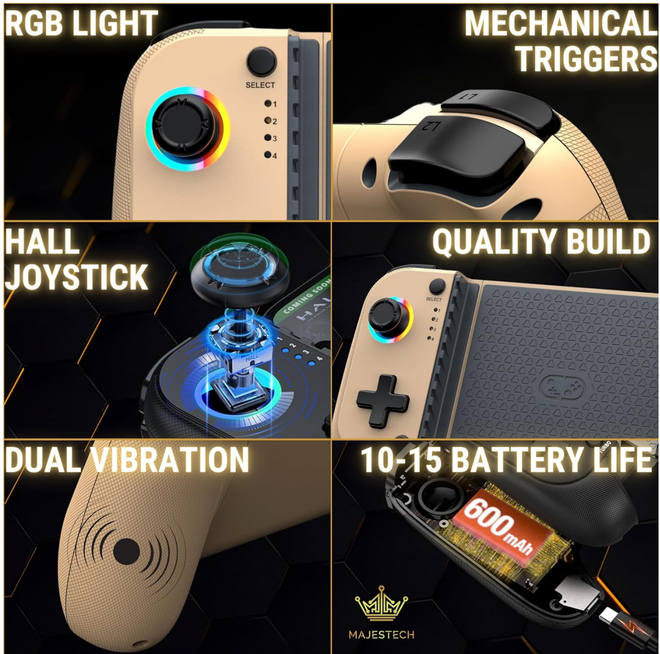
Figure 2.2: A detailed view highlighting key features such as RGB lighting, mechanical triggers, Hall effect joysticks, quality build, dual vibration, and the 600mAh battery.