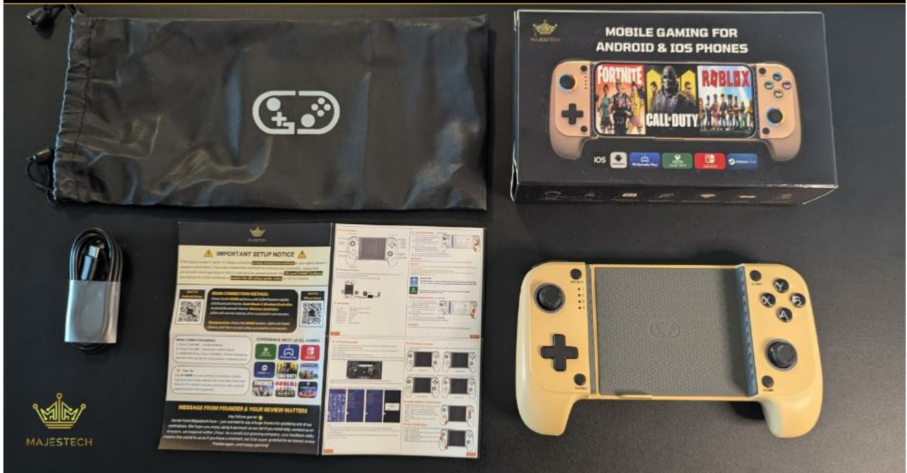
Figure 2.1: Contents of the MAJESTECH controller package laid out, including the controller, sleeve, USB-C cable, and setup guide.

1x Controller | x1 Sleeve | x1 USB-C Cable | x1 Setup Guide with QR Video Instructions