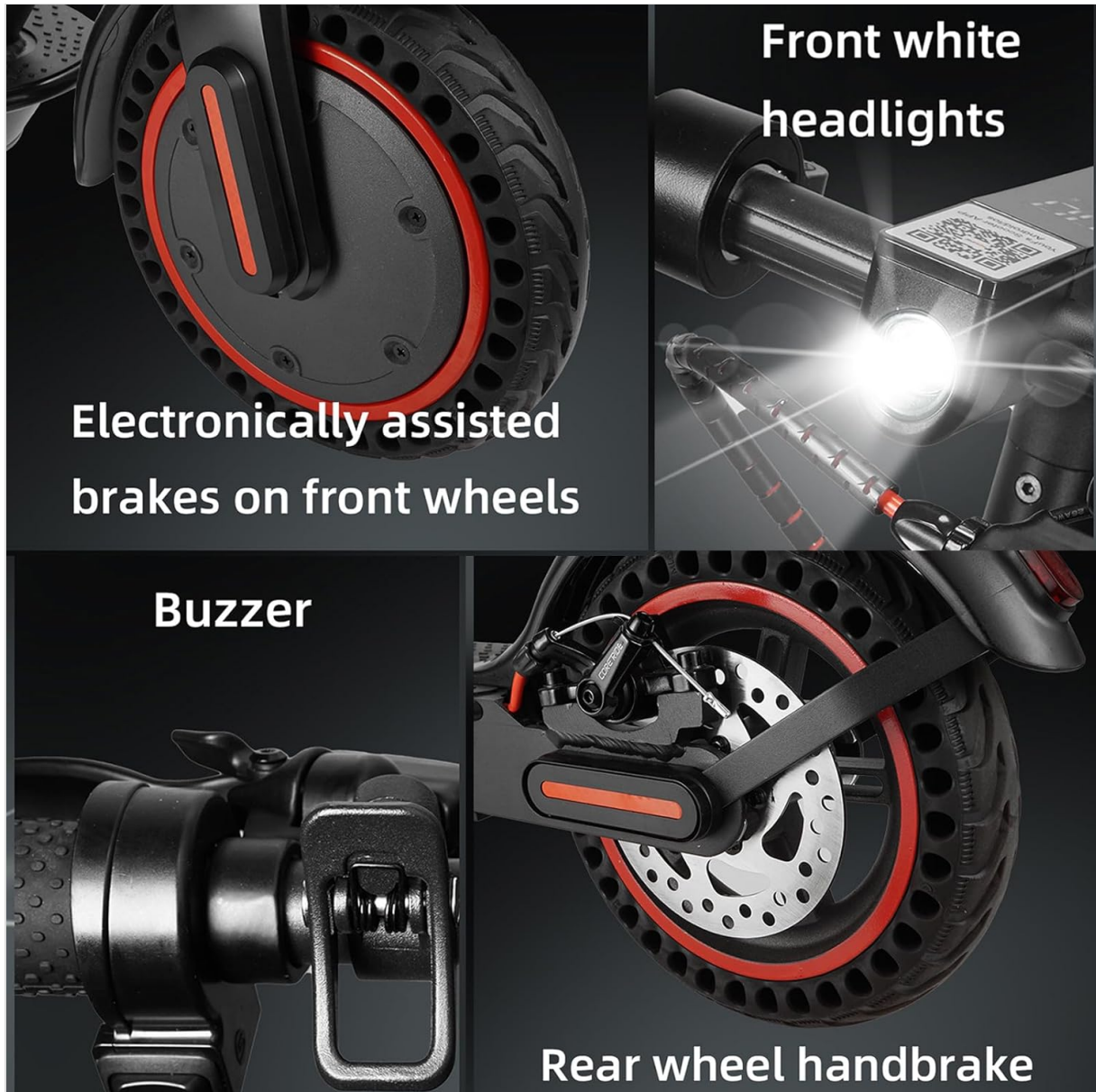
Image: Close-up view of the scooter's front white headlights, electronically assisted front wheel brakes, buzzer, and rear wheel handbrake system.

Familiarize yourself with the main parts of your electric scooter.