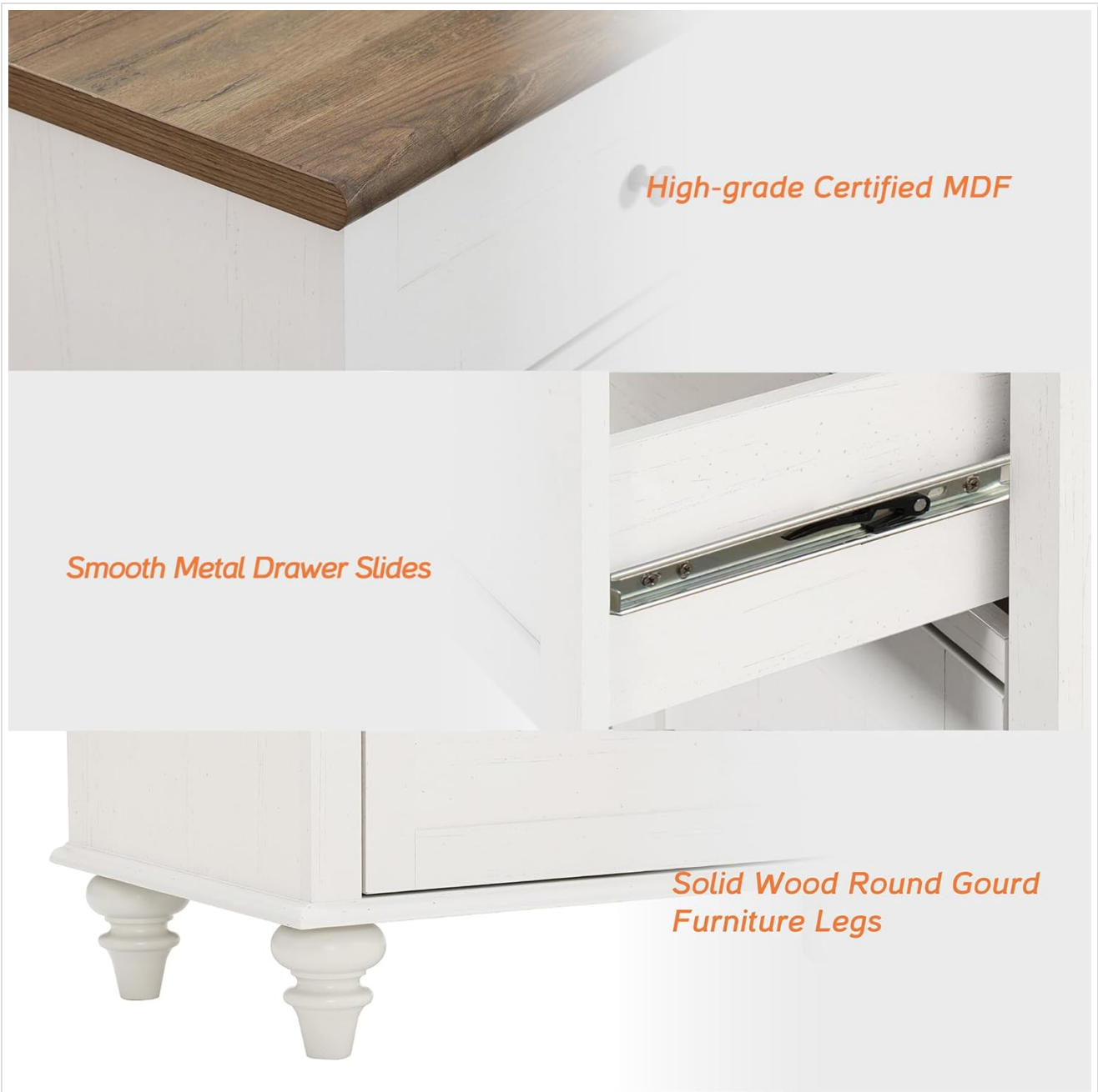
Image: Material and Component Details. This image provides a close-up view of the dresser's construction, showcasing the high-grade certified MDF material, the smooth metal drawer slides for easy operation, and the solid wood round gourd furniture legs that provide stability and aesthetic appeal.