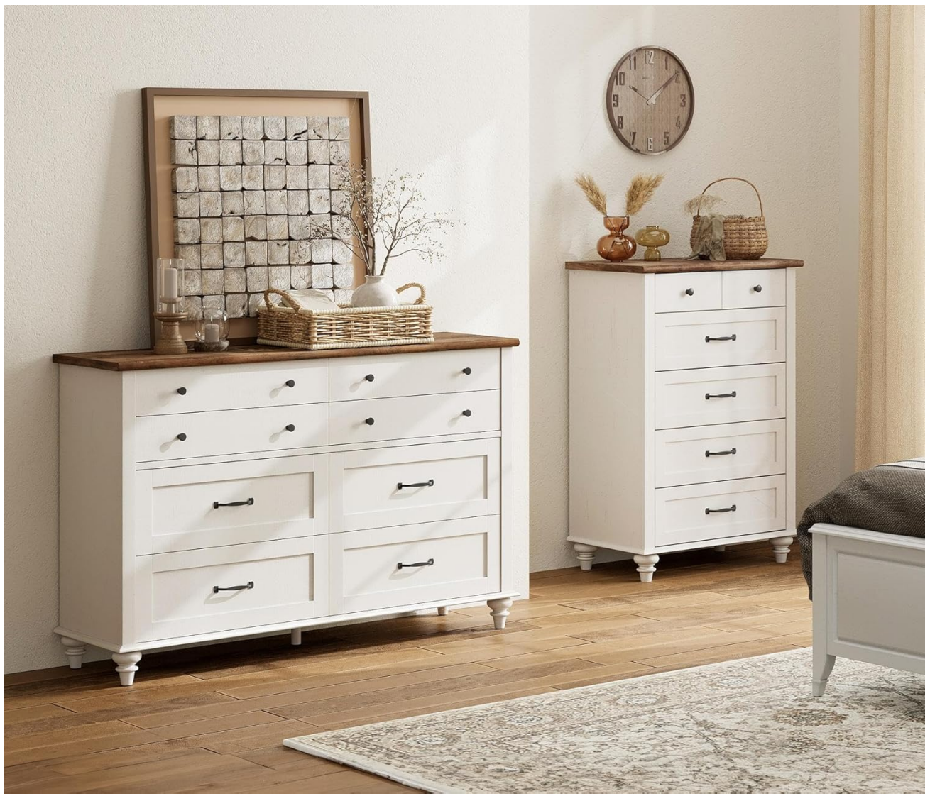
Image: Complete Bedroom Set. This image shows both the 8-drawer and 5-drawer dressers placed together in a bedroom, illustrating their complementary design and how they can enhance the room's aesthetic.