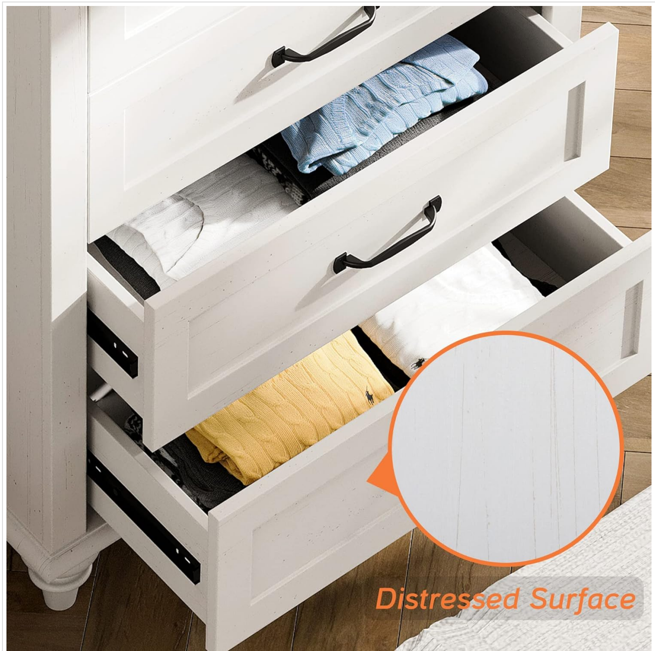
Image: Distressed Surface Detail. A close-up view of a drawer front, showcasing the distressed surface finish that adds to the farmhouse style of the dressers.