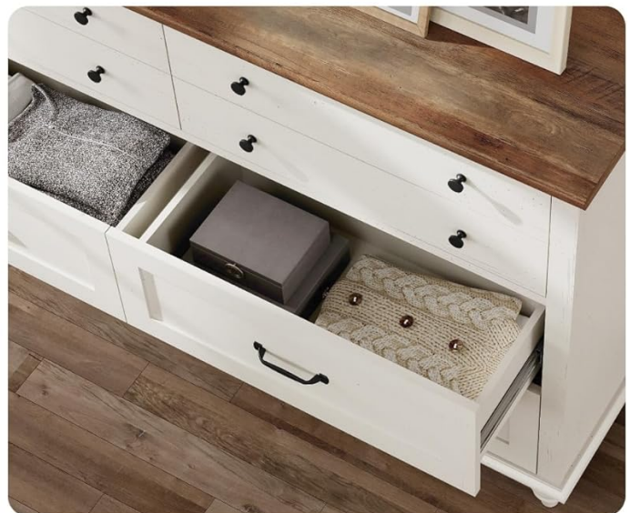
Image: Drawer Configuration. This image displays the internal structure of the 8-drawer dresser, highlighting the four top small drawers and four lower large drawers. It shows how items can be organized within the different drawer sizes.