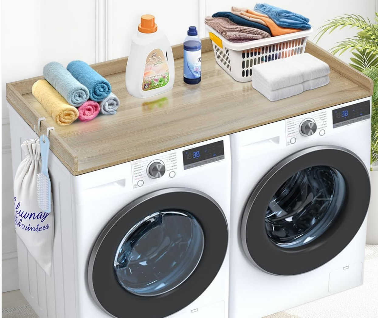
Image: Demonstrates the multi-functional storage design with hooks and space for laundry essentials.