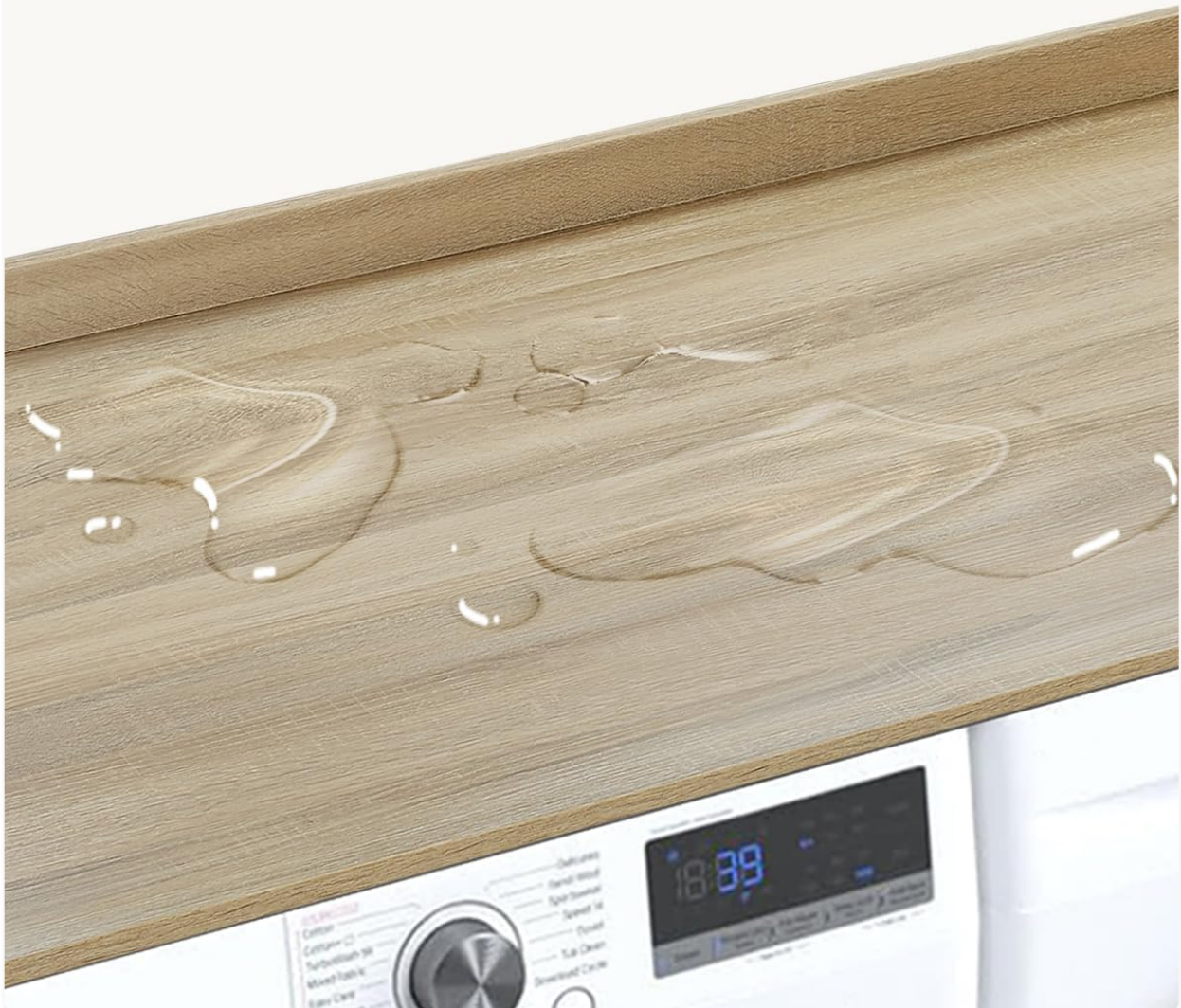
Image: Close-up showing the water-resistant surface of the high-density particle board.