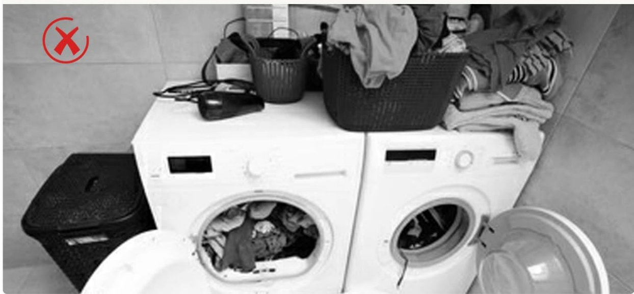
Image: Illustrates the extra storage space provided by the countertop for organizing laundry items.