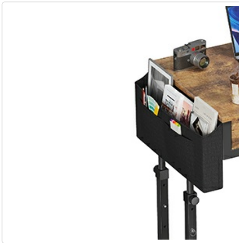
Figure 5: The removable side storage bag, offering convenient access to frequently used items and maximizing desktop space.