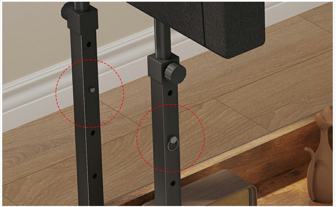
Figure 3: The desk in use, illustrating the versatility of its adjustable height for both sitting and standing work.