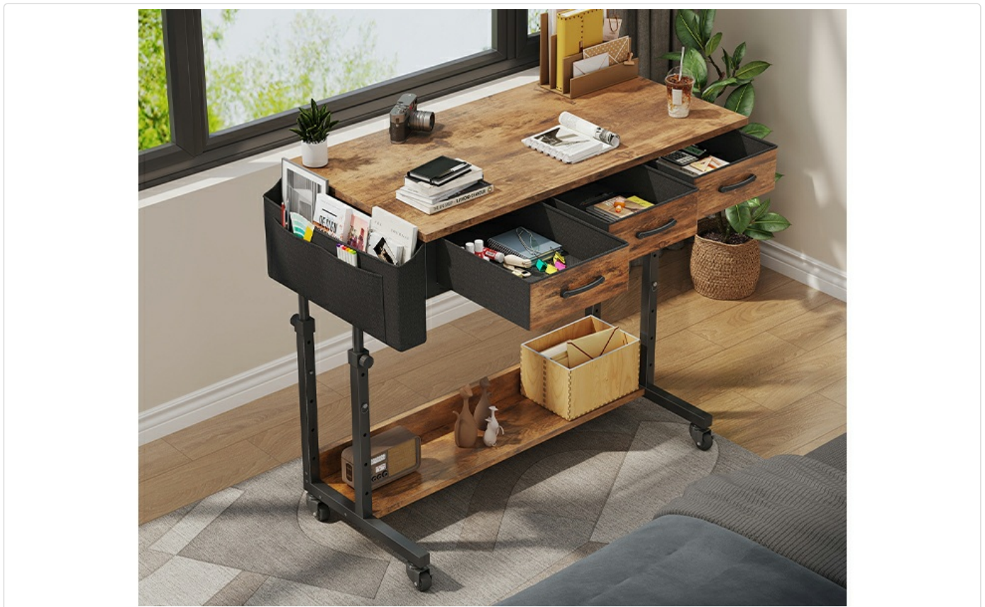
Figure 1: Product dimensions and key features. This image illustrates the overall size and design elements of the desk, including the metal frame, desktop, and fabric drawers.