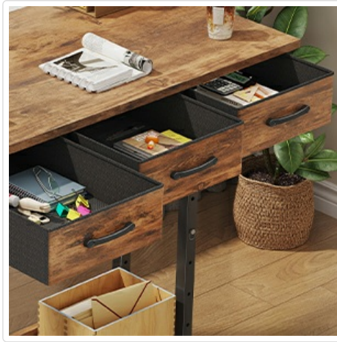
Figure 4: The spacious fabric drawers, designed for organizing various items to maintain a tidy workspace.