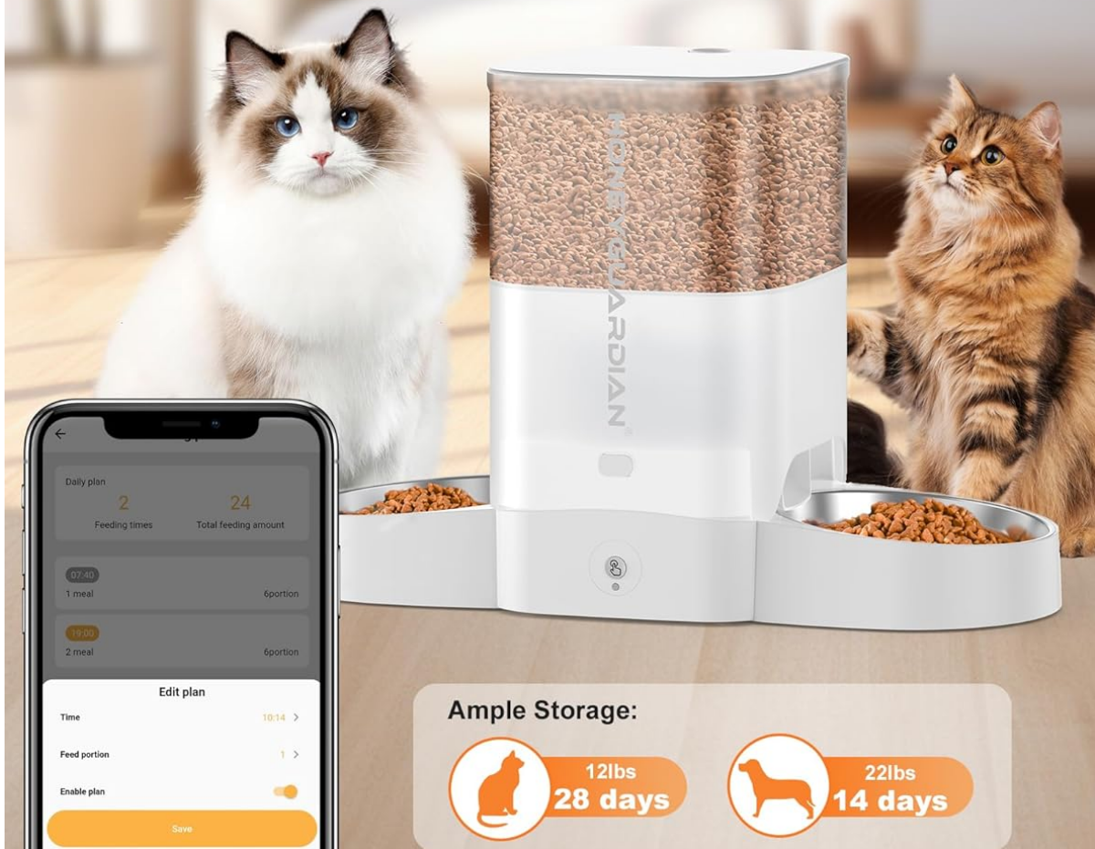
Image: App Controlled Features Overview

This infographic summarizes the key functionalities available through the HoneyGuardian app, including WiFi connectivity, capacity, meal frequency, kibble size compatibility, and portion control.