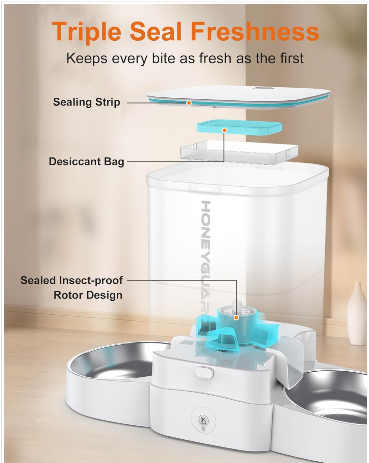
Image: Triple Seal Freshness System