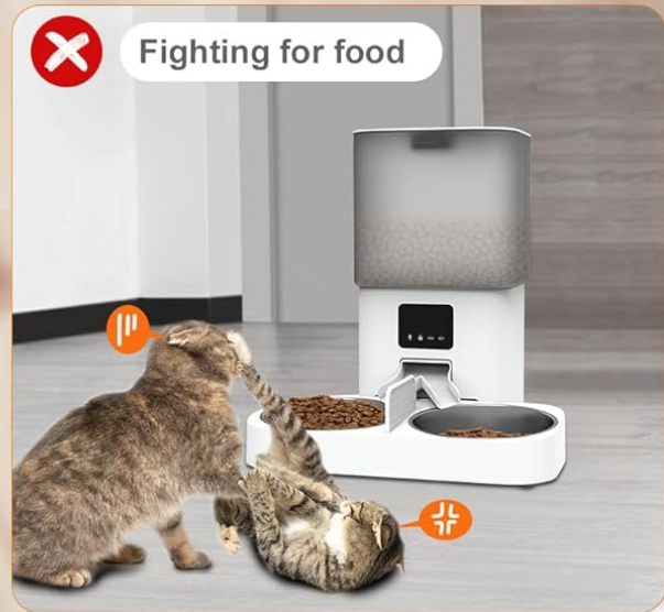
Image: Dual Side Equal Feeding Mechanism

This visual demonstrates how the feeder distributes food equally into both bowls, promoting harmonious feeding for two pets.