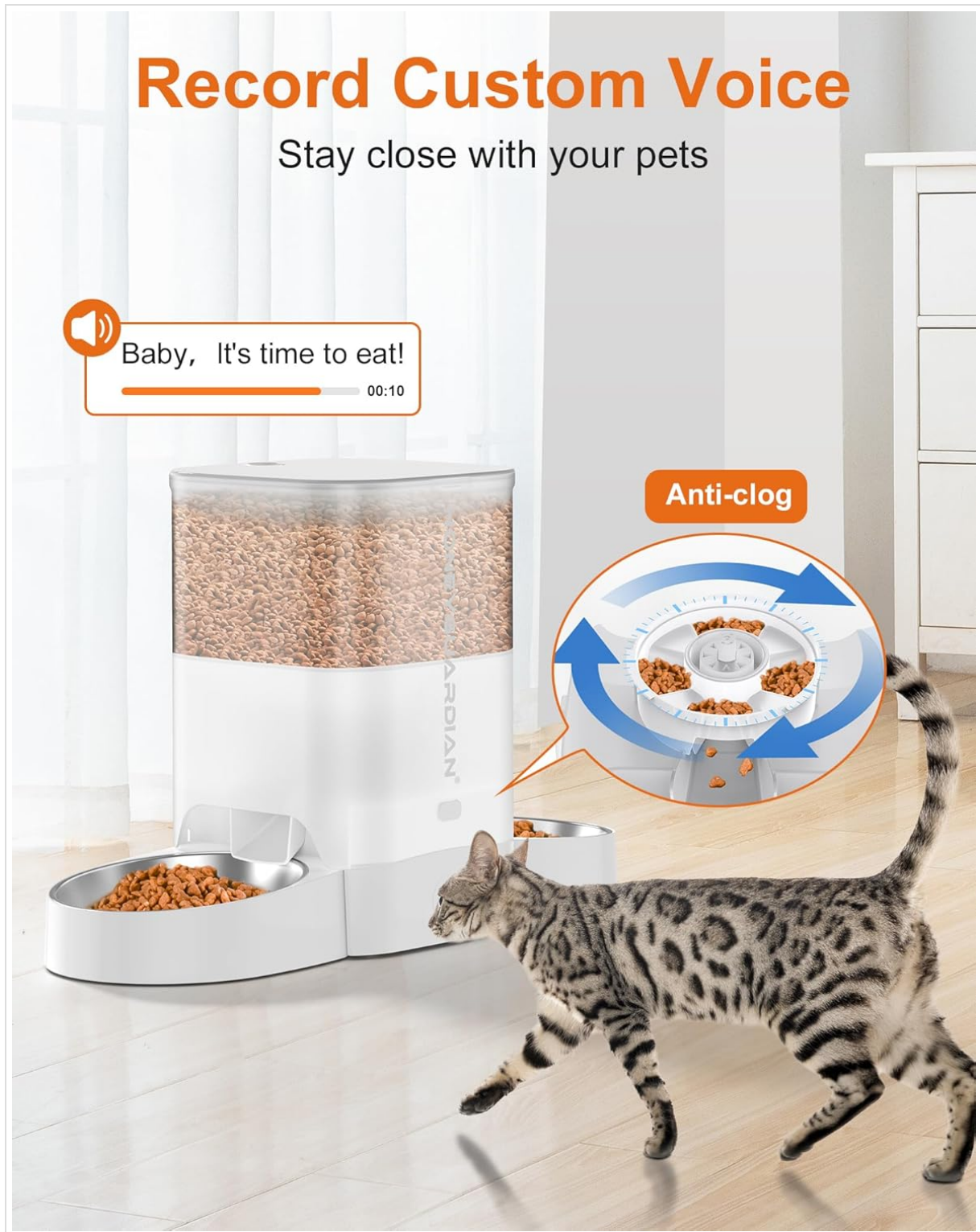
Image: Record Custom Voice Feature

This image highlights the voice recording function, allowing you to personalize meal calls for your pets. It also shows the anti-clog design for reliable food dispensing.