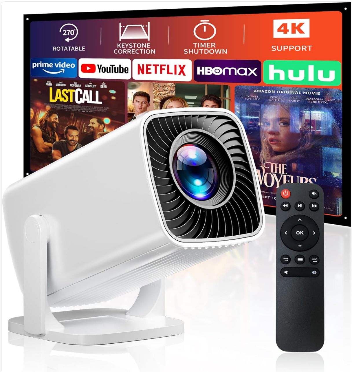
Figure 1.1: Sainyer Mini Projector Q100 and its accessories.