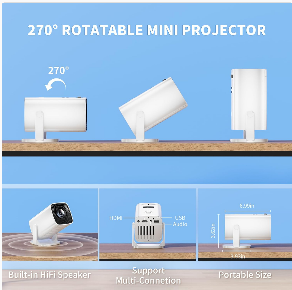
Figure 4.1: Rear view of the projector showing HDMI, USB, and AUX ports.

Familiarize yourself with the projector's main components and connectivity ports: