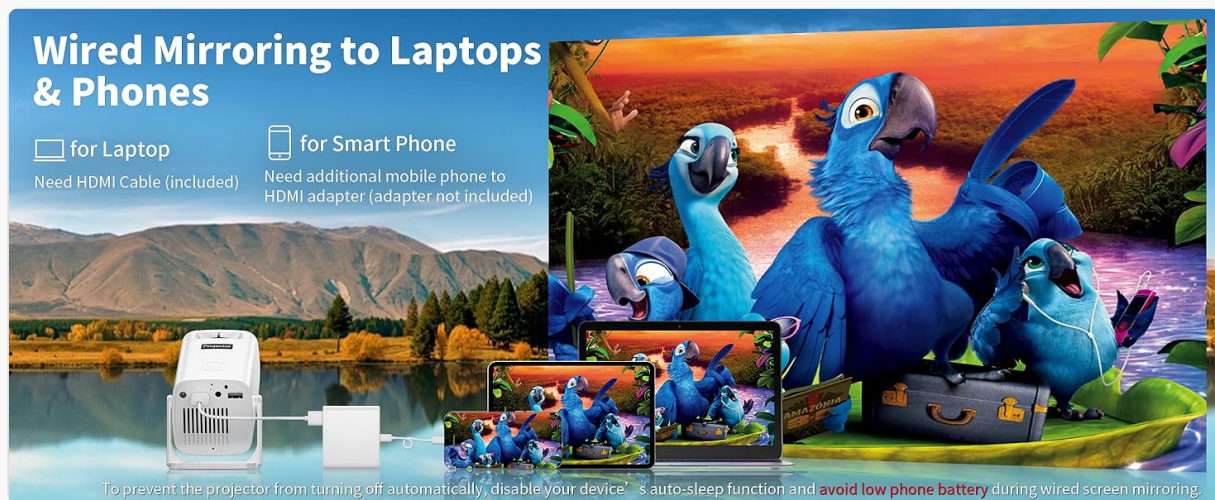
Figure 6.1: Wired mirroring to laptops and phones via HDMI and USB connections.

Video 6.1: An overview of the Sainyer Mini Projector's compact design, ease of use, and compatibility with various devices for entertainment and learning.