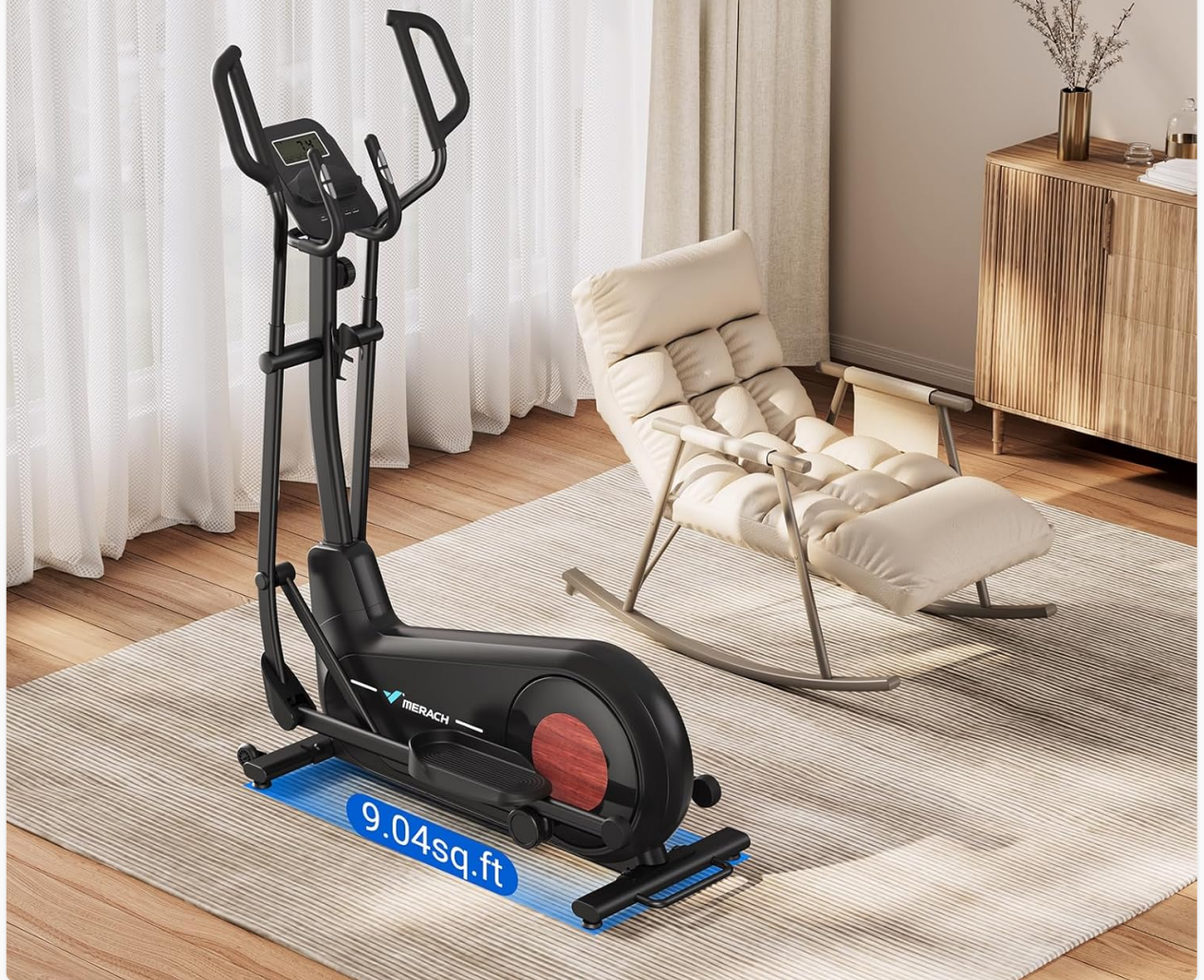
Figure 9: Space-Saving Design