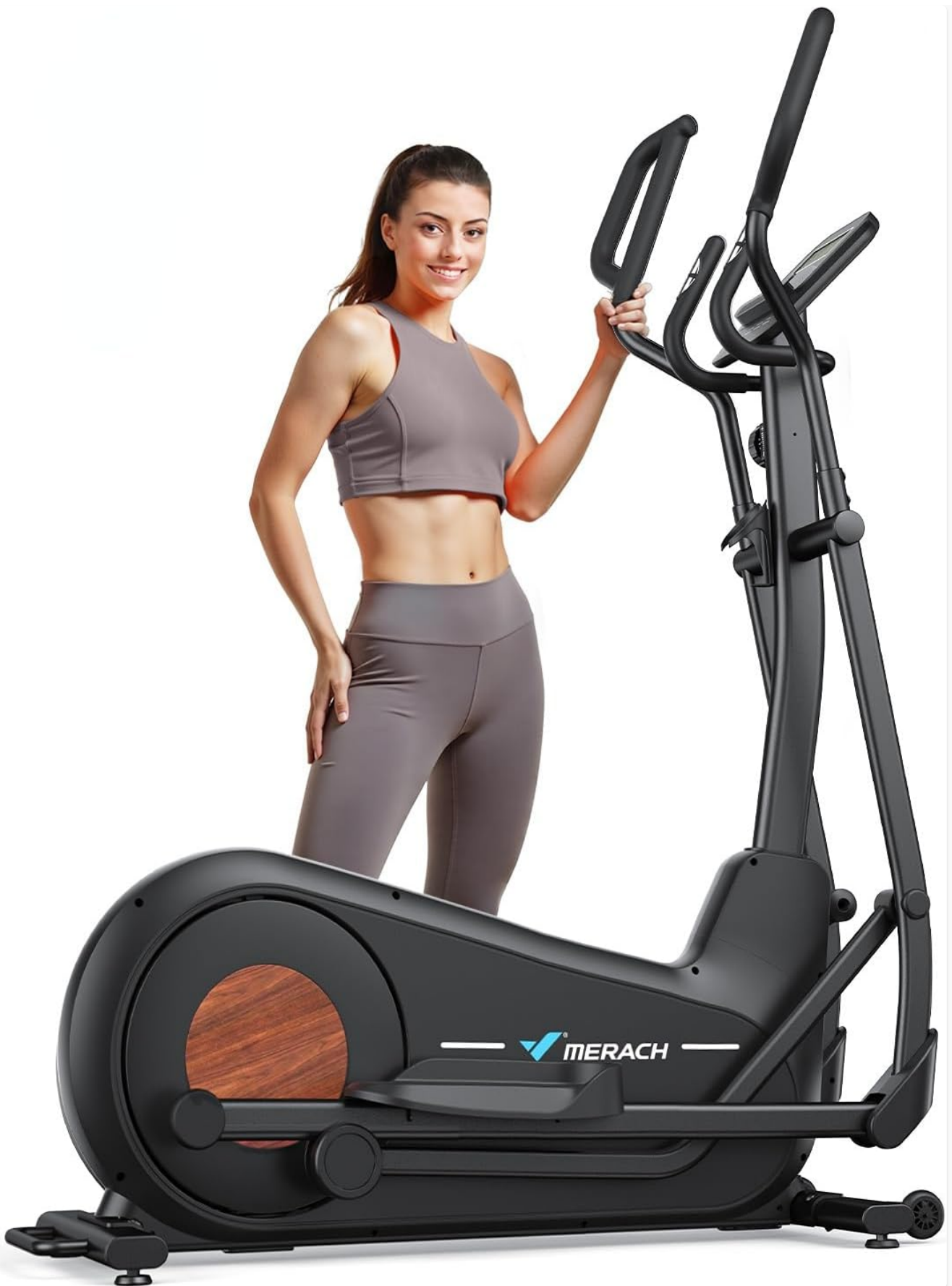
Figure 1: MERACH Elliptical Machine