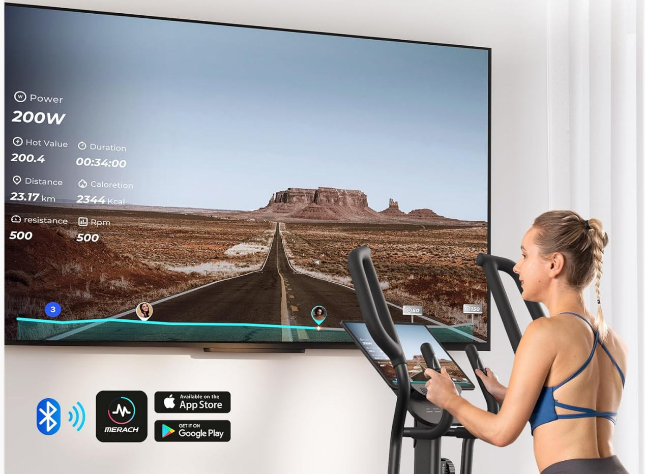
Figure 3: MERACH Fitness App Integration