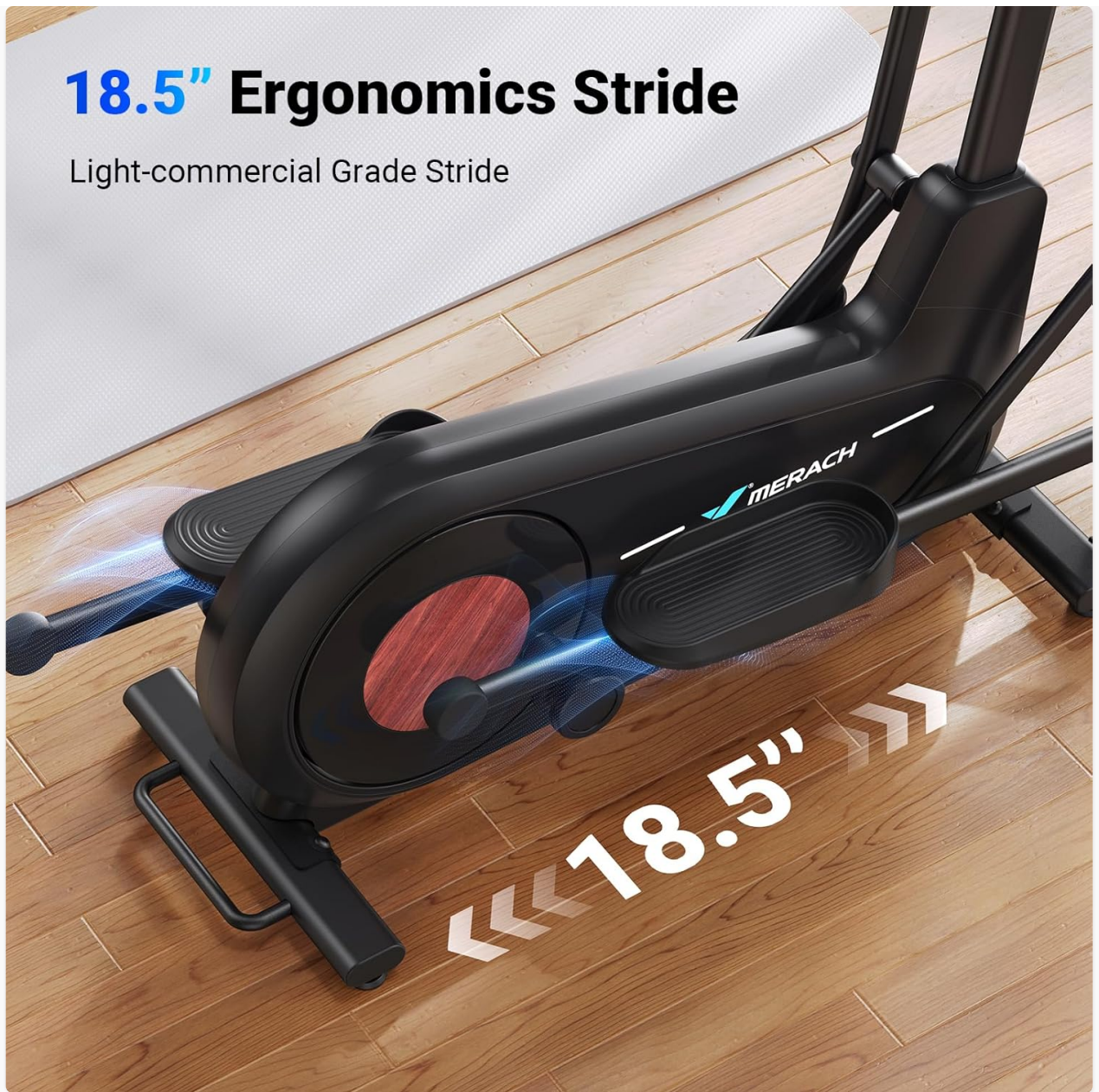
Figure 4: Ergonomic Stride Length