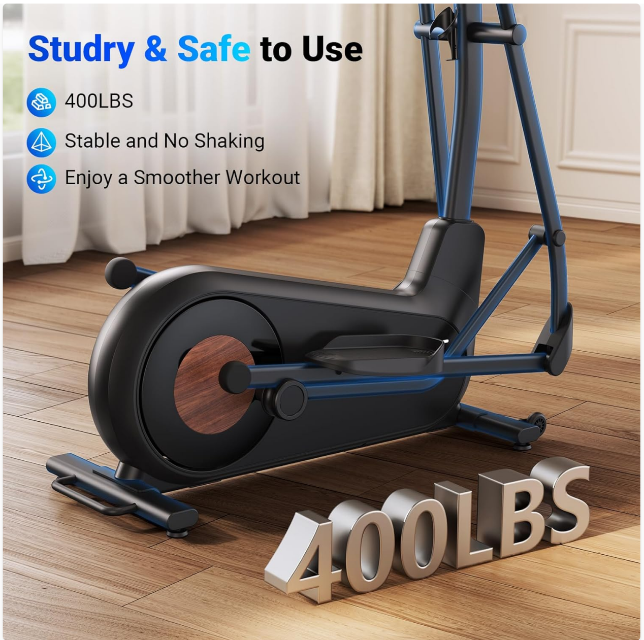
Figure 8: Robust 400 LBS Capacity