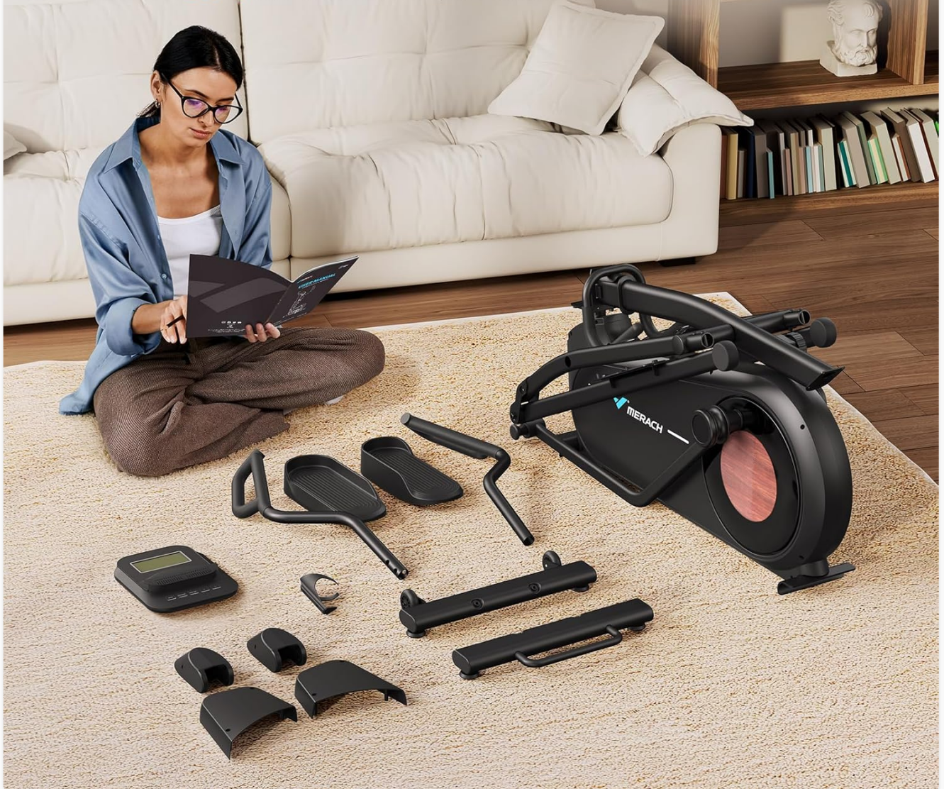
Figure 2: Components for Easy Assembly

80% Pre-assembled, Installation in 30 Minutes