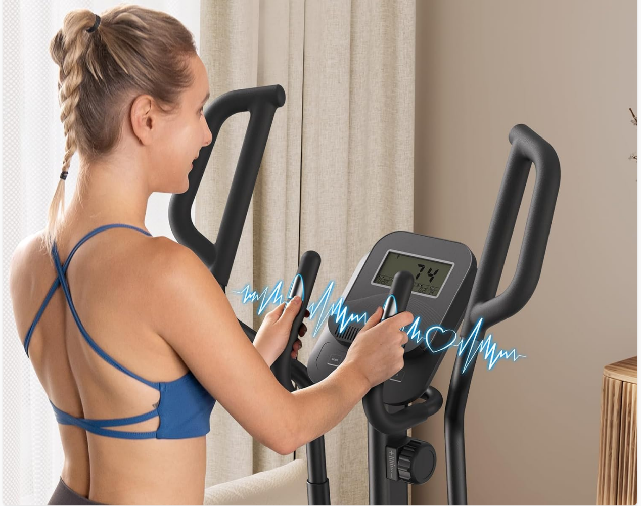
Figure 7: Integrated LCD Screen and Heart Rate Monitoring

Follow Your Heart Rate in Real Time to Maintain Healthy Elliptical Exercise