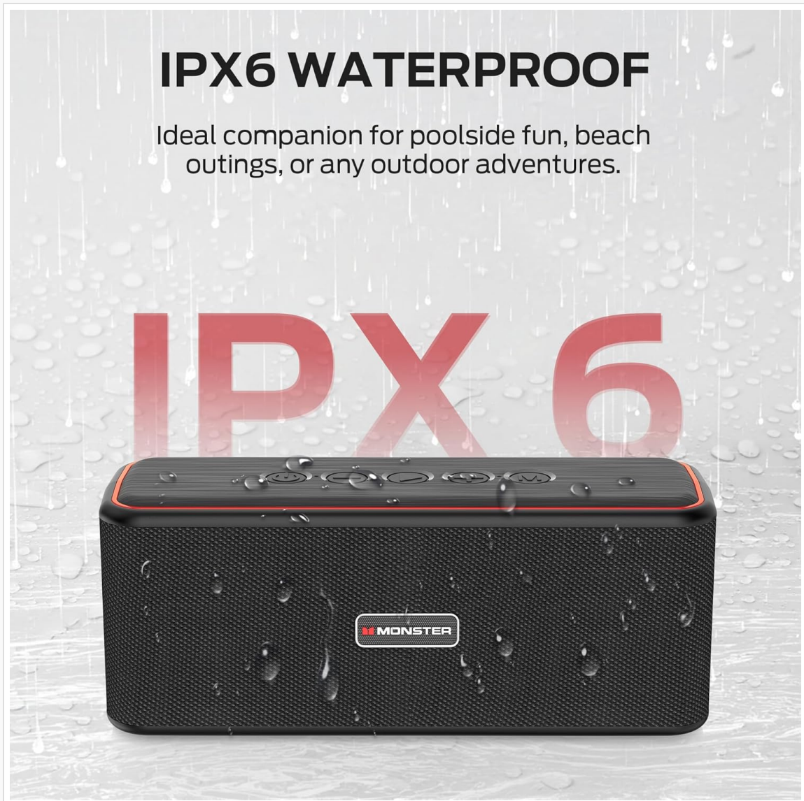
Image: The Monster Shock Plus S21 speaker demonstrating its IPX6 water resistance, suitable for outdoor use.