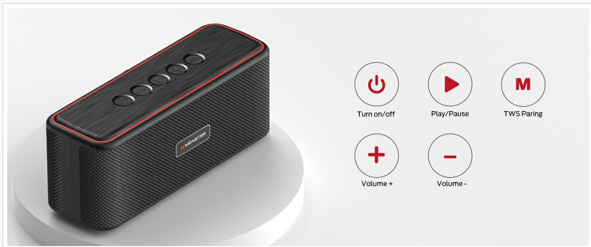
Image: Top panel of the speaker displaying the power, volume down, play/pause, volume up, and mode (M) buttons.