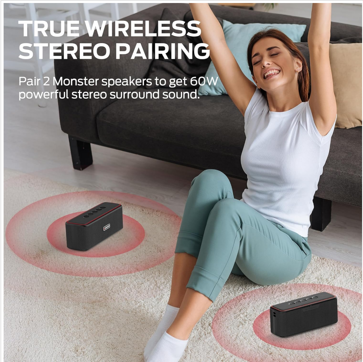
Image: Two Monster Shock Plus S21 speakers positioned for TWS pairing, creating a stereo sound experience.

TWS allows you to pair two Monster Shock Plus S21 speakers together for a true stereo sound experience.