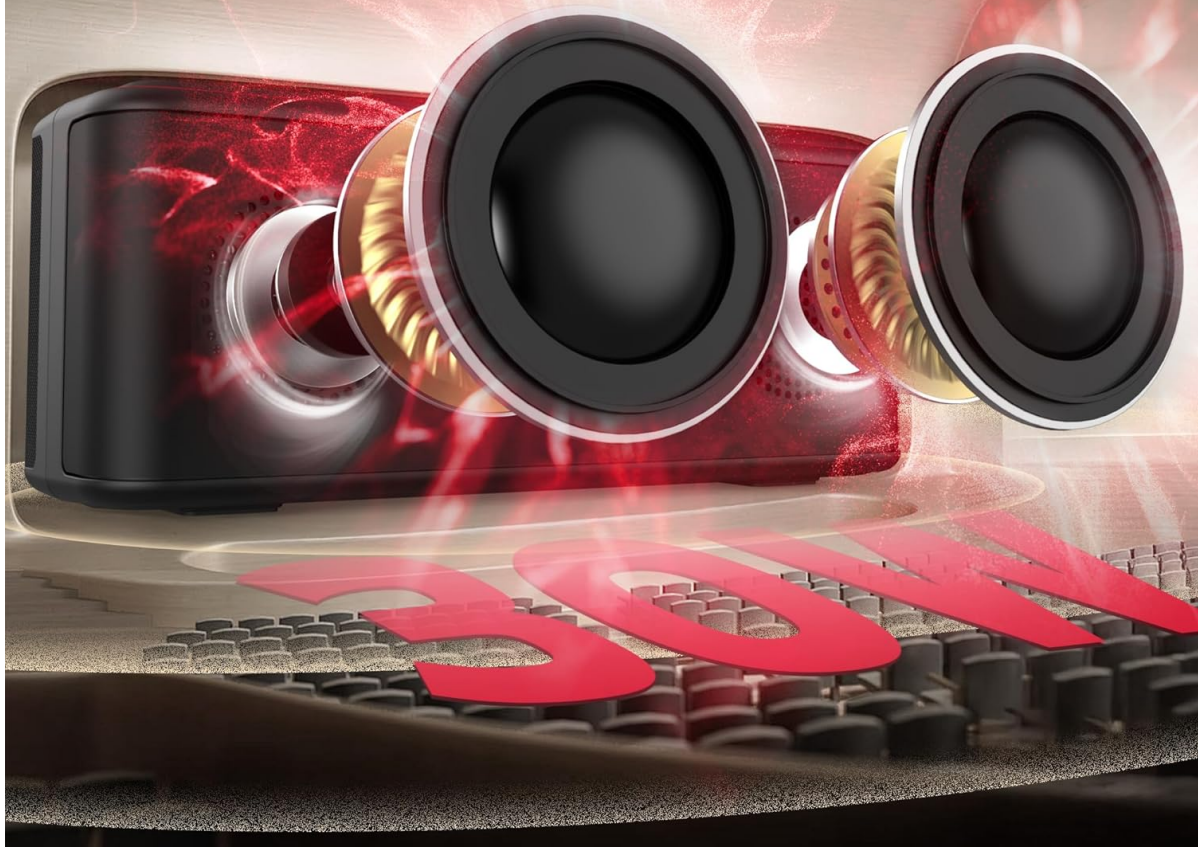
Image: The Monster Shock Plus S21 speaker, highlighting its 30W audio performance for a powerful sound experience.

Deliver a truly unparalleled listening experience with 30W audio performance.