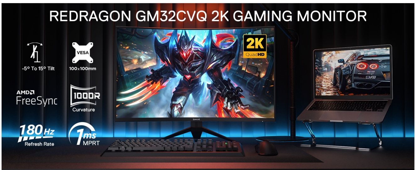
Image: Redragon GM32 monitor with stand, illustrating key features and connectivity.