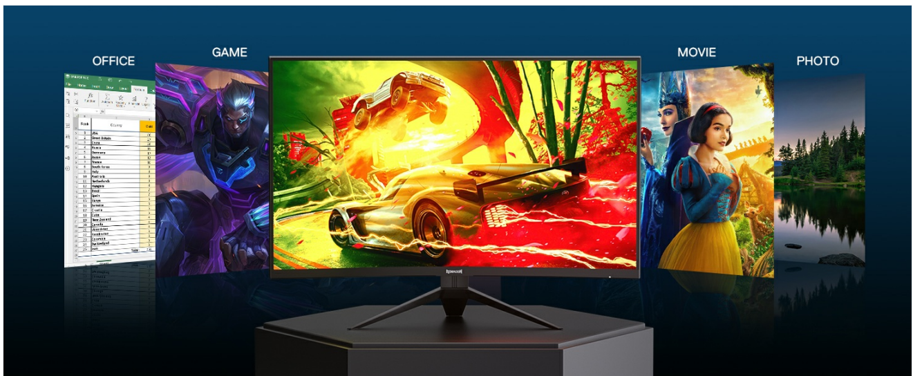
Image: Monitor displaying various applications, demonstrating its adaptability for different tasks.